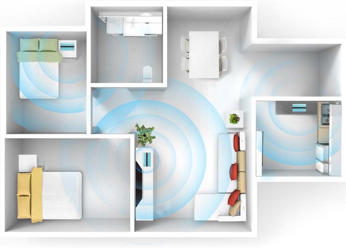
Image: A floor plan diagram showing how multiple GGMM E Series speakers can be placed in different rooms for multi-room audio synchronization.

Using 2 or more GGMM E Series Speaker can build a multiroom to play different songs or the same song. (add 16 speakers at most)