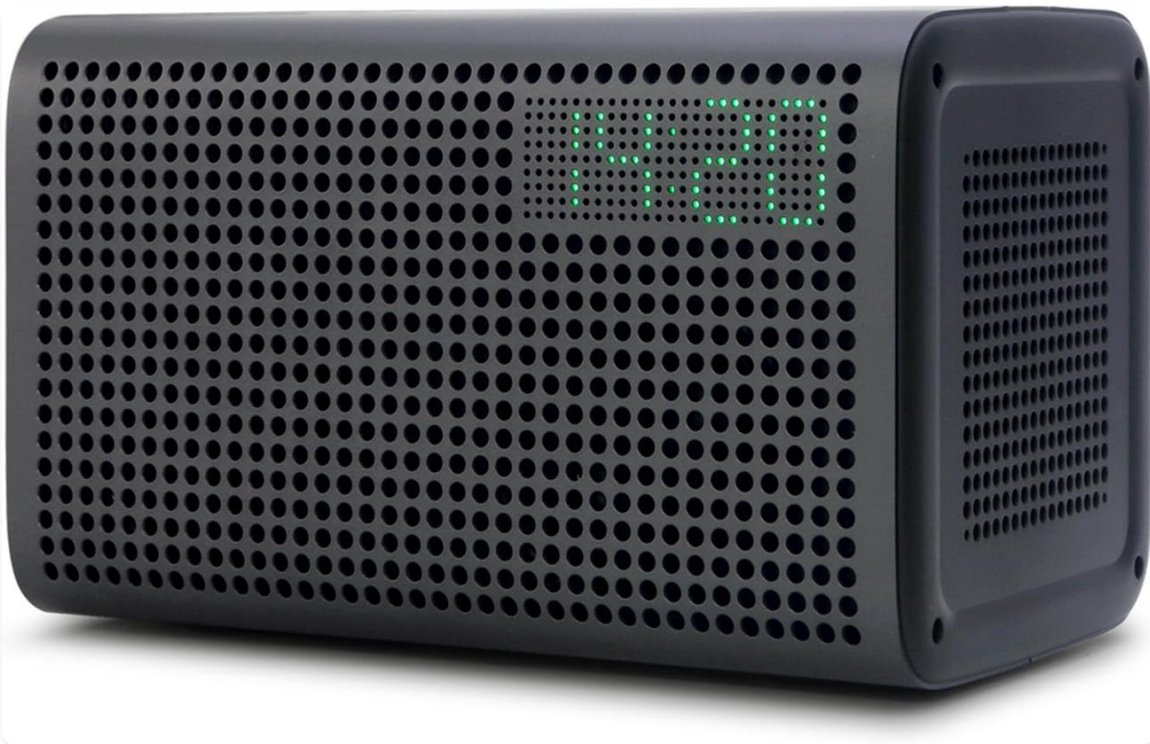
Image: The front of the GGMM E3 speaker, showcasing its perforated grille and integrated digital clock display.