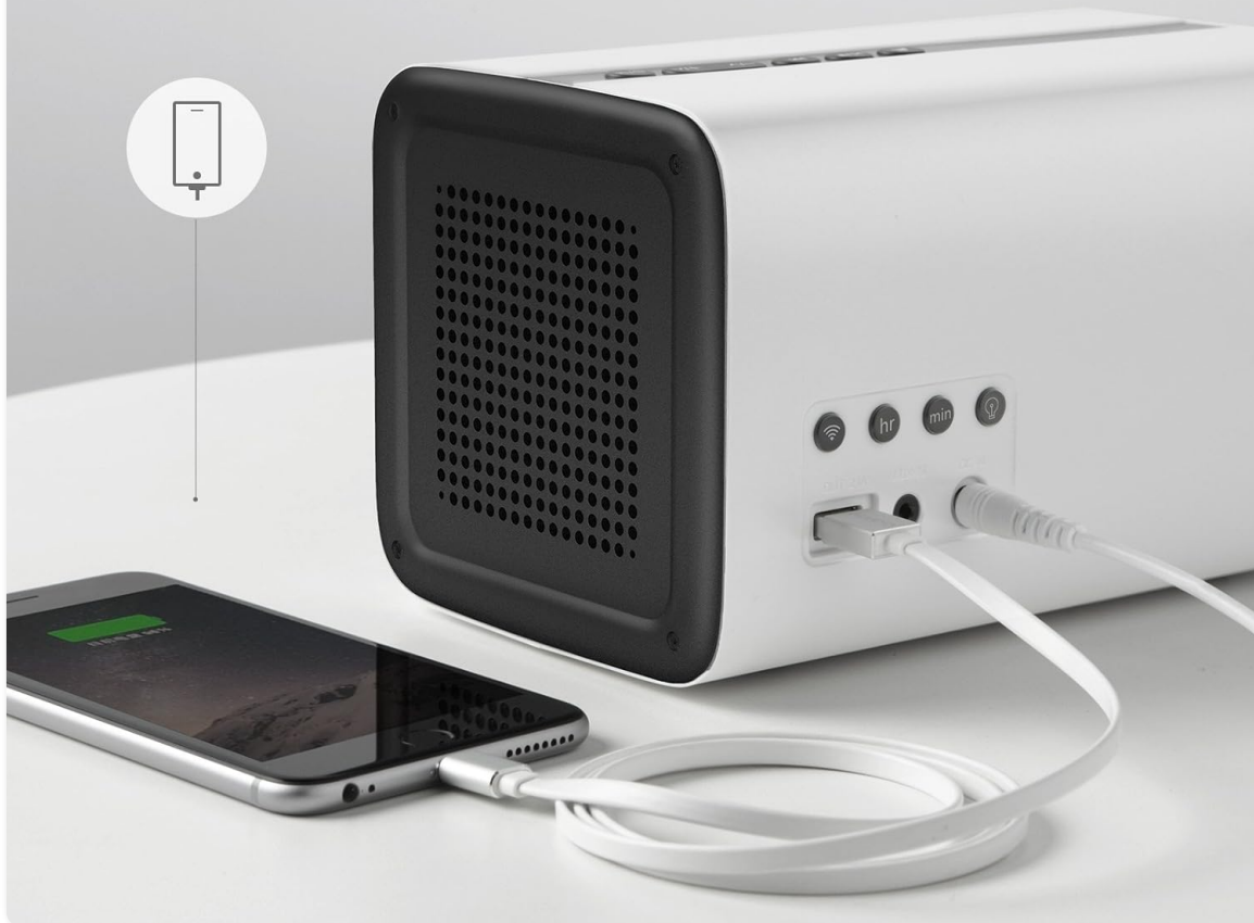
Image: The rear panel of the GGMM E3, displaying the DC power input, AUX-in port, and USB charging port, along with additional control buttons for clock and Wi-Fi settings.