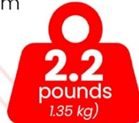
Image: The stock pot displaying its key dimensions and capacity.