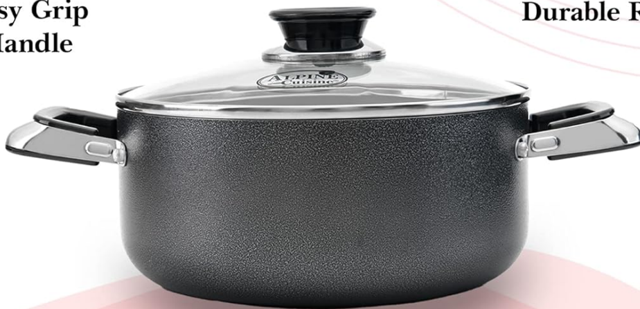
Image: Alpine Cuisine 3-Quart Stock Pot with ergonomic handles and lid knob, ready for use.