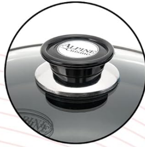
Easy Hold Knob