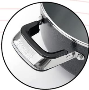
Easy Grip Handle