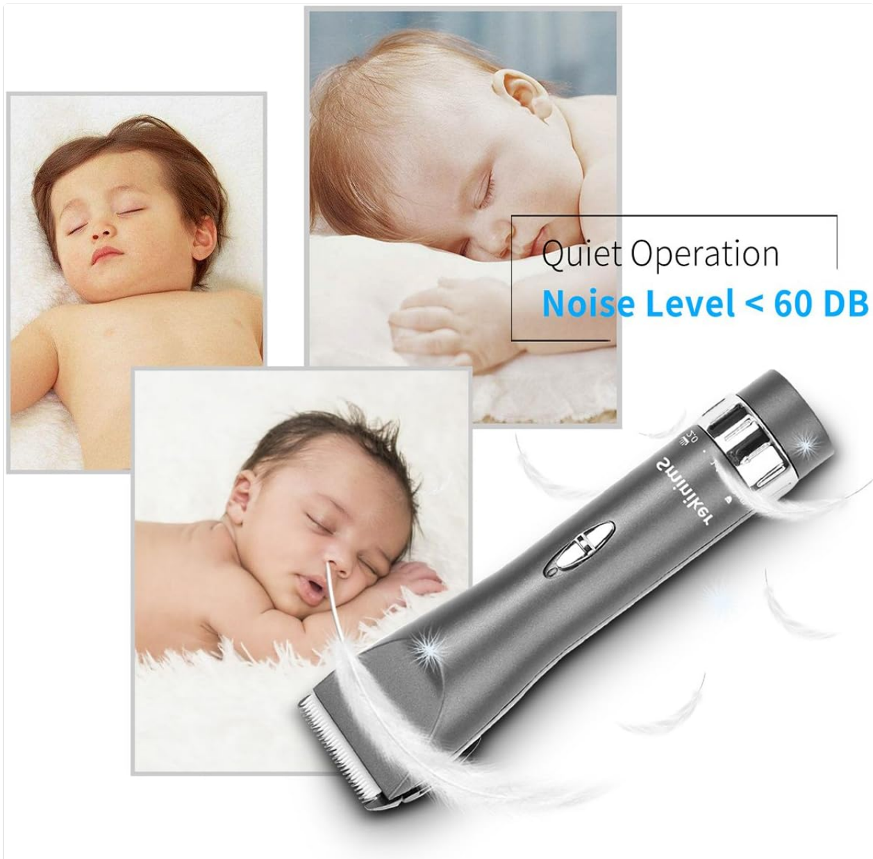
Figure 2: Quiet Operation Feature