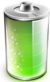
Figure 3: Battery and Charging Information