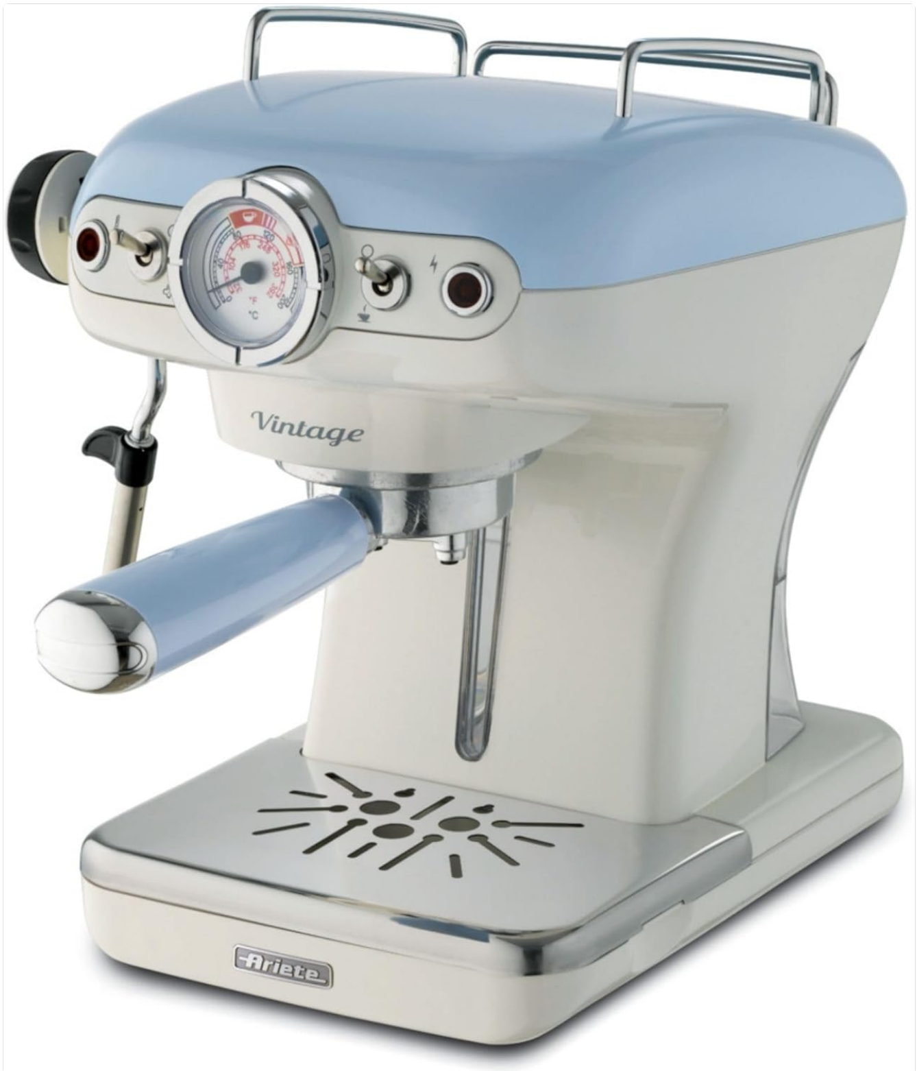
The Ariete 1389 Vintage Espresso Coffee Machine, featuring a retro design with light blue and cream colors.