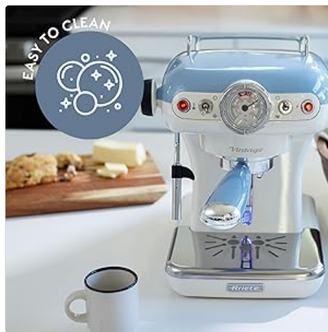
The Ariete 1389 is designed for easy cleaning and maintenance.