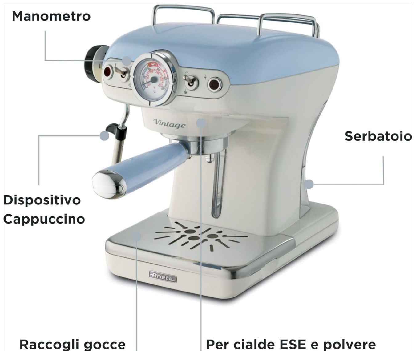
Key components of the Ariete 1389 Espresso Coffee Machine:

Familiarize yourself with the various parts of your Ariete 1389 Espresso Coffee Machine: