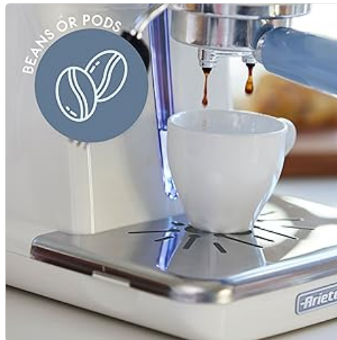
The Ariete 1389 machine is compatible with both ground coffee and ESE pods.