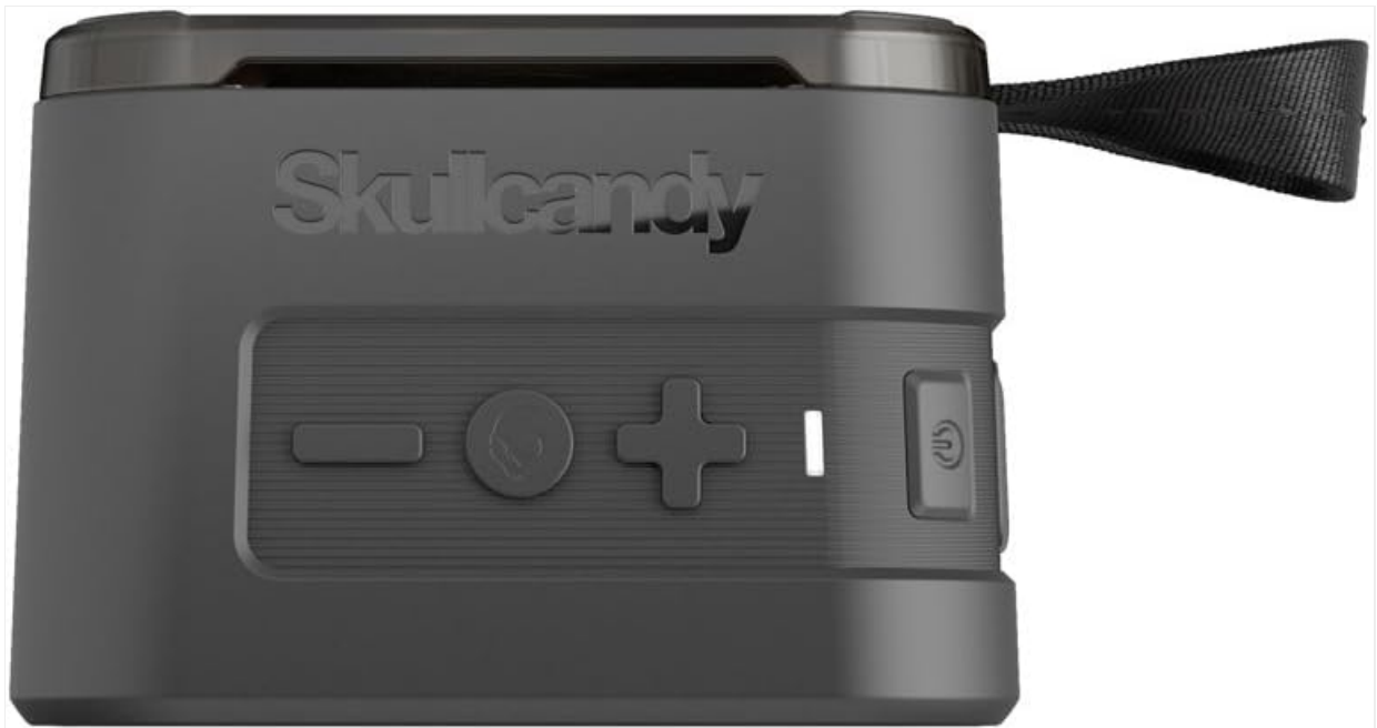
Image: Top view of the Skullcandy Barricade Mini speaker, showing the control panel with power, volume, and track buttons.