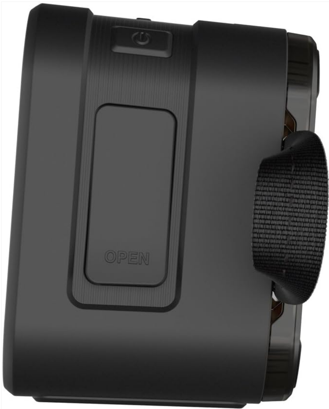
Image: Side view of the Skullcandy Barricade Mini speaker, highlighting the rubber flap marked "OPEN" which conceals the charging and auxiliary ports.