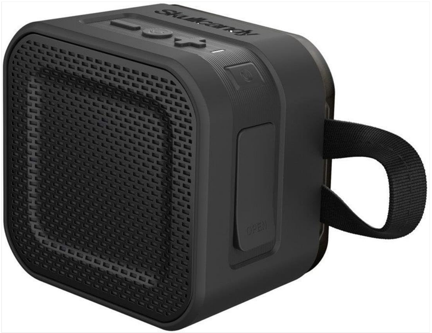
Image: Front view of the Skullcandy Barricade Mini Wireless Portable Speaker, black in color, showcasing its compact, square design with a textured speaker grille and a fabric loop on the side.