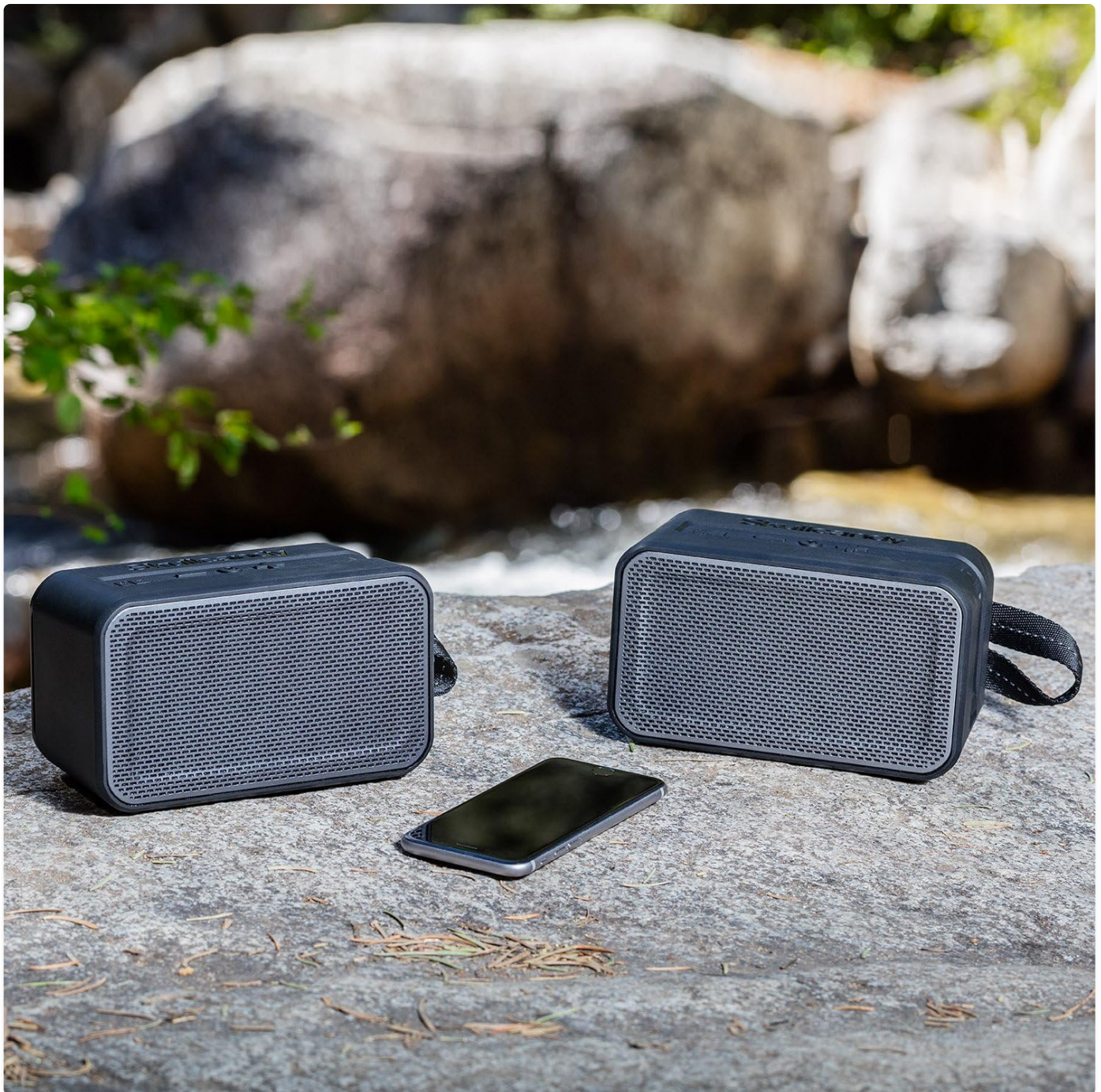
Image: Two Barricade XL speakers positioned next to a smartphone on a rock, illustrating multi-speaker setup.