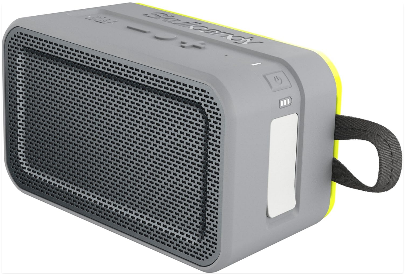
Image: Side view of the Barricade XL speaker, showing the covered port for external device charging and battery indicator lights.