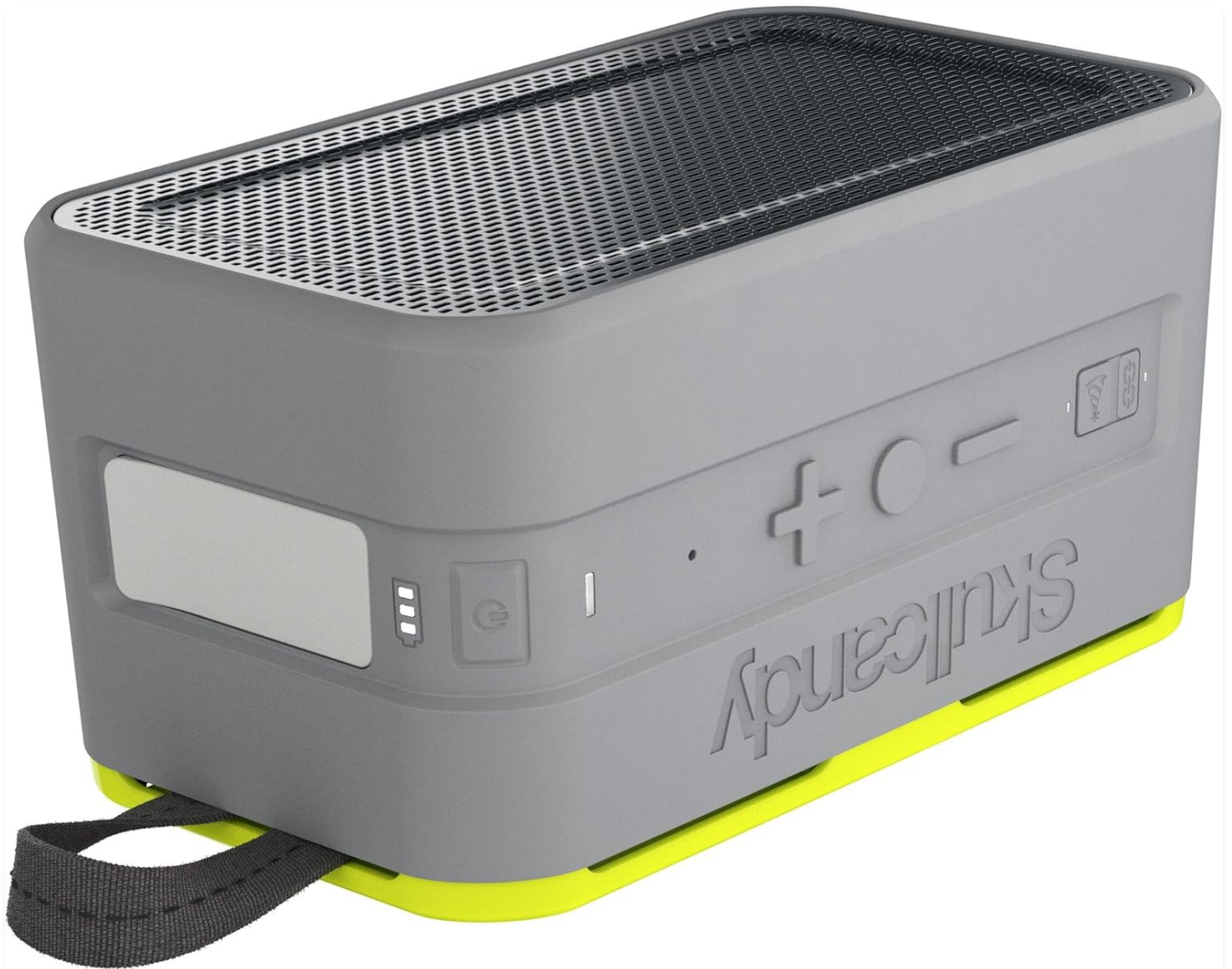
Image: Top view of the Barricade XL speaker, highlighting the power, volume, and multi-function buttons.