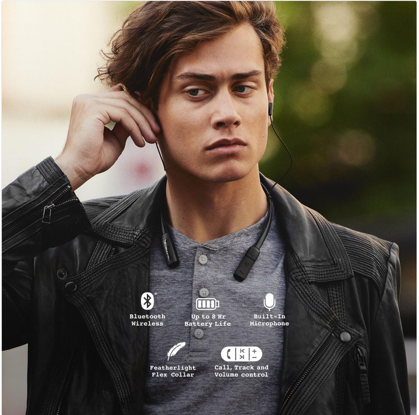
Image: Lifestyle image showing a user wearing the Skullcandy Ink'd Wireless earbuds, with callouts for Bluetooth Wireless, Up to 8 Hr Battery Life, Built-In Microphone, Featherlight Flex Collar, and Call, Track, and Volume control.

The Skullcandy Ink'd Wireless earbuds feature integrated controls for managing audio playback and calls.