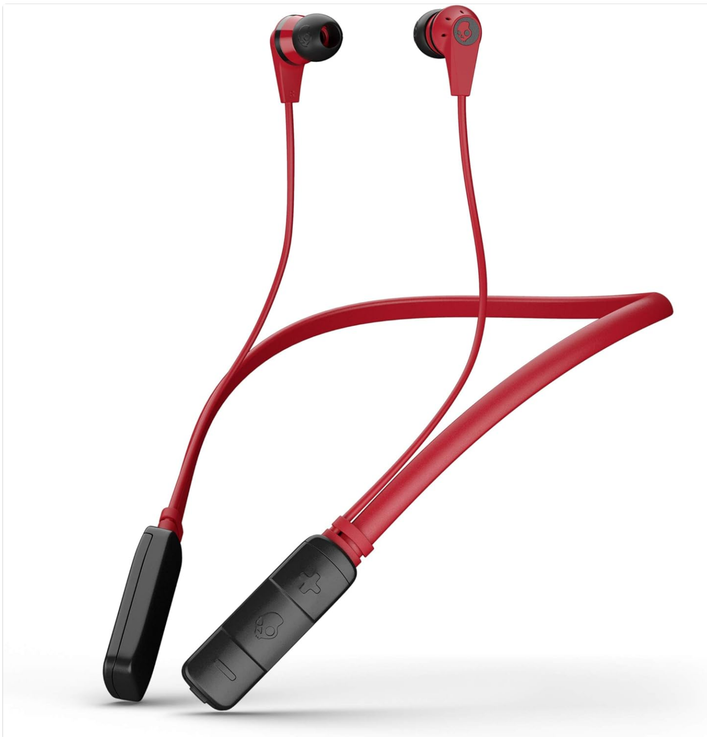
Image: Angled view of the Skullcandy Ink'd Wireless earbuds, showing the flexible neckband and the control modules. The charging port is typically located on one of these modules.