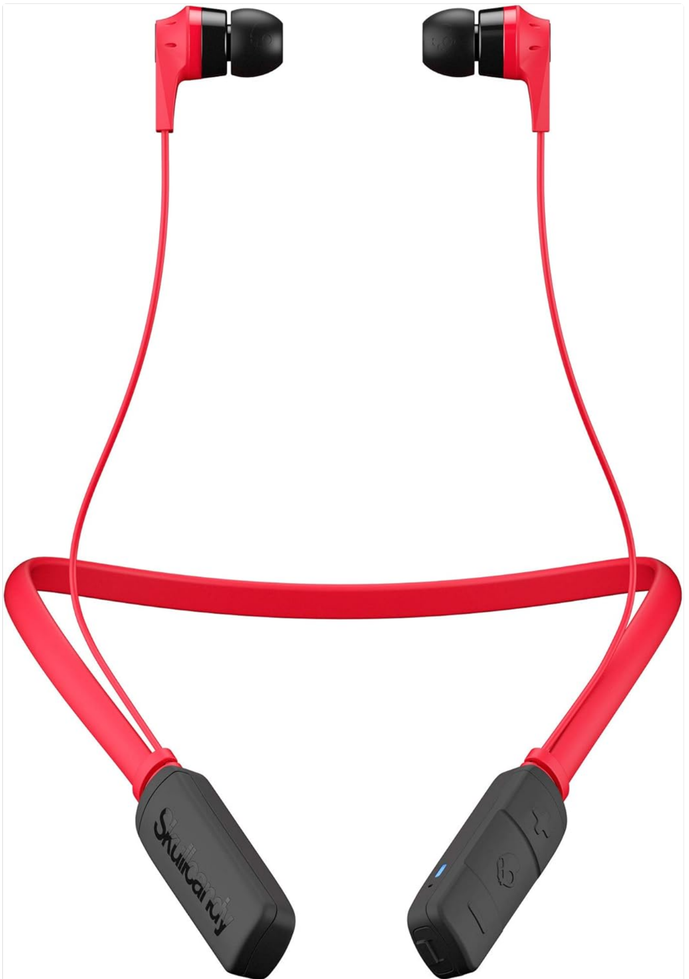
Image: Front view of the Skullcandy Ink'd Wireless in-ear earbuds, showcasing the red earbuds connected by a flexible neckband, with black control modules.