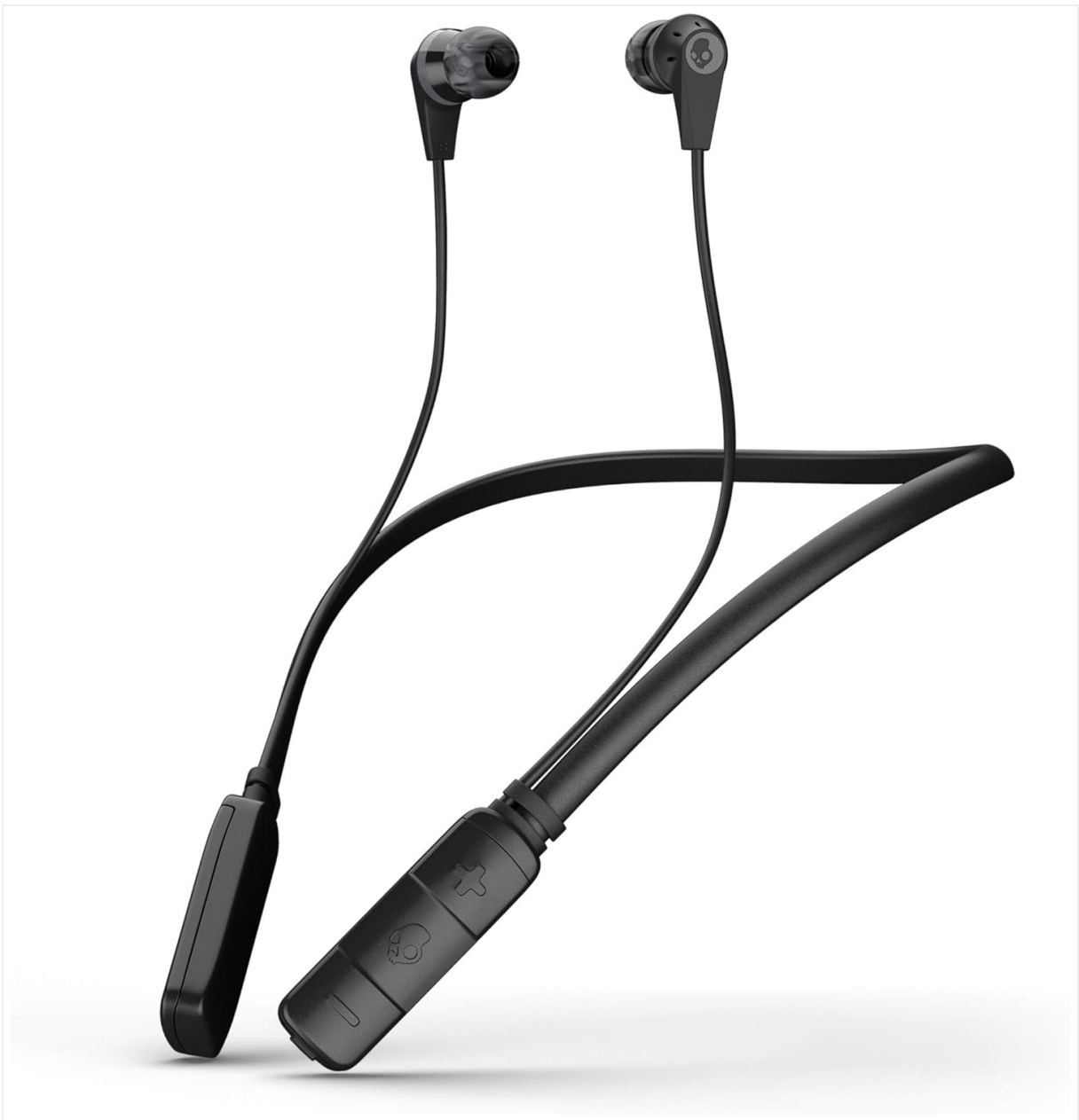
Image: A side view of the Skullcandy Ink'd Wireless Earbuds, showing the ergonomic design of the earbuds and the flexible neckband.