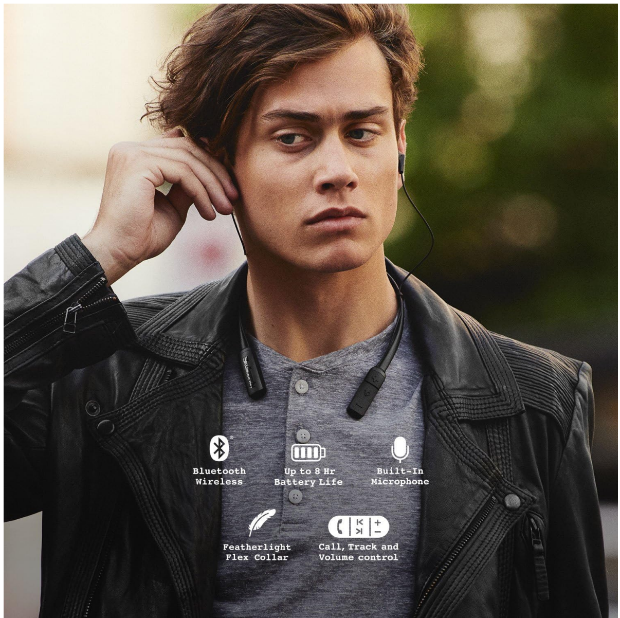
Image: A person wearing the Skullcandy Ink'd Wireless Earbuds, demonstrating the comfortable fit and how the neckband rests around the neck during use.