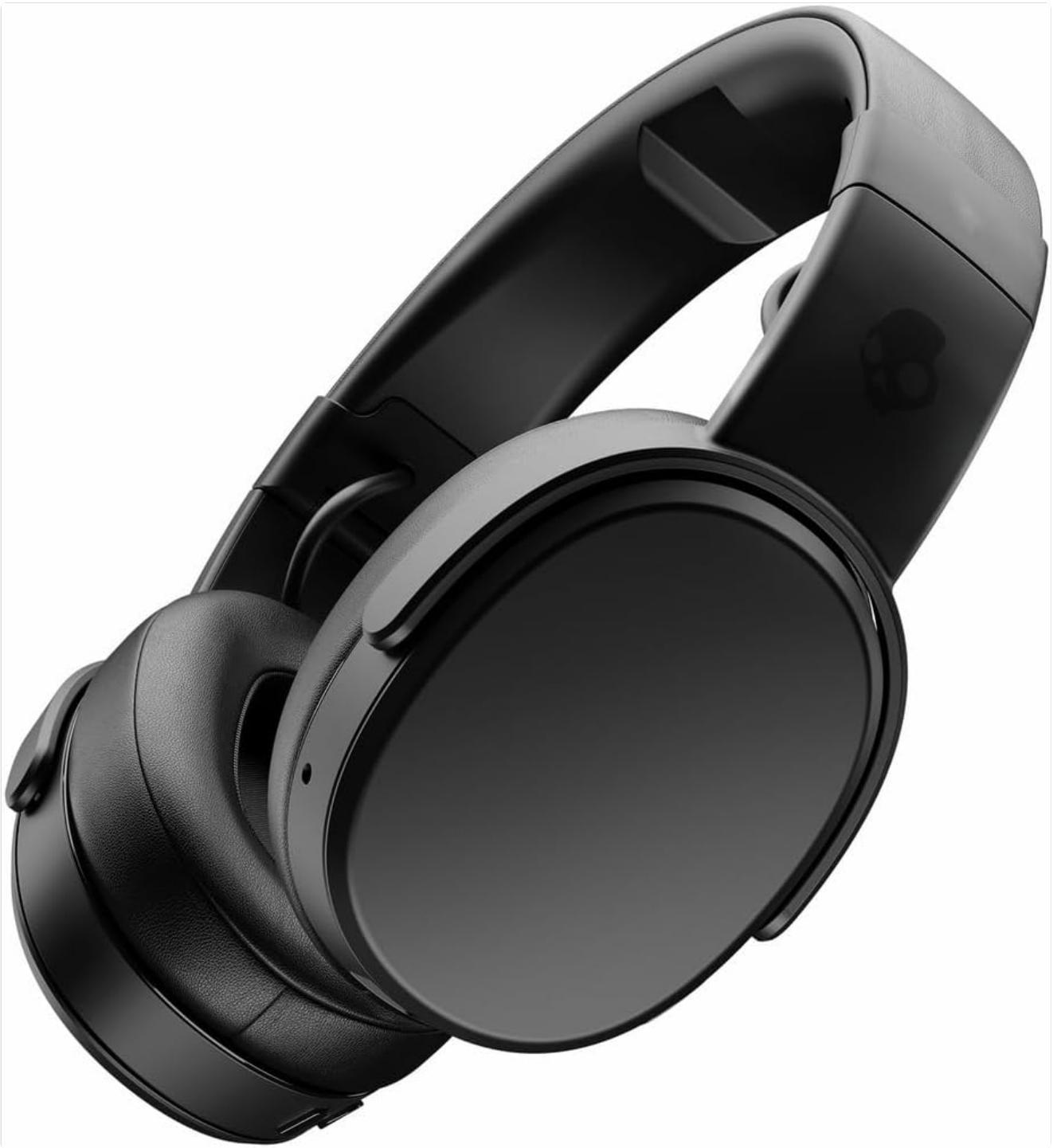
Figure 1.1: Skullcandy Crusher Wireless Headphones. These headphones are designed for immersive audio with powerful bass.