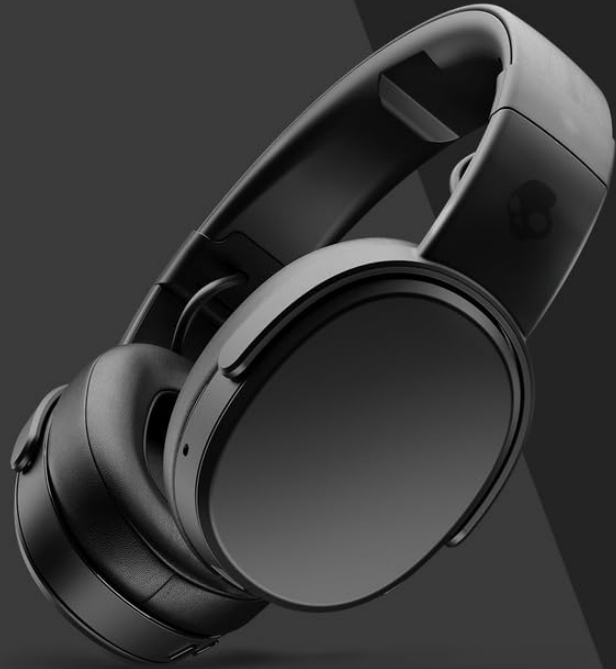
Figure 3.2: The multi-sensory bass technology provides an immersive audio experience.