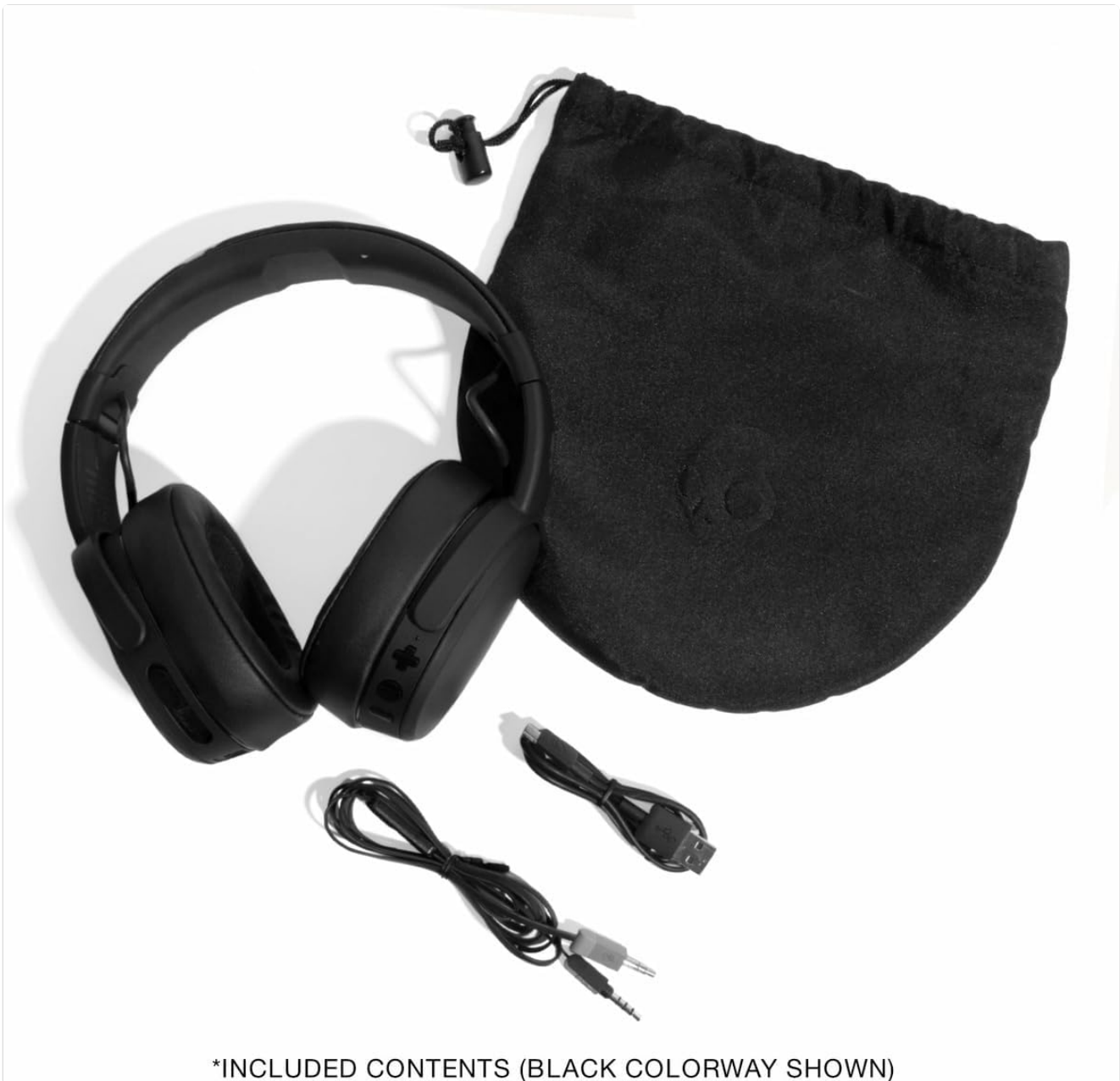
Figure 2.1: Included components with the Skullcandy Crusher Wireless Headphones. The package contains the headphones, charging cable, AUX cable, and a travel bag.