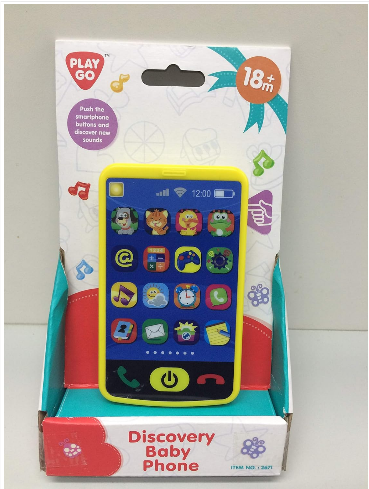
Image: The PLAY Discovery Baby Phone, Model 2671, shown in its retail packaging. The packaging features the toy phone, brand logo, and age recommendation (18m+).