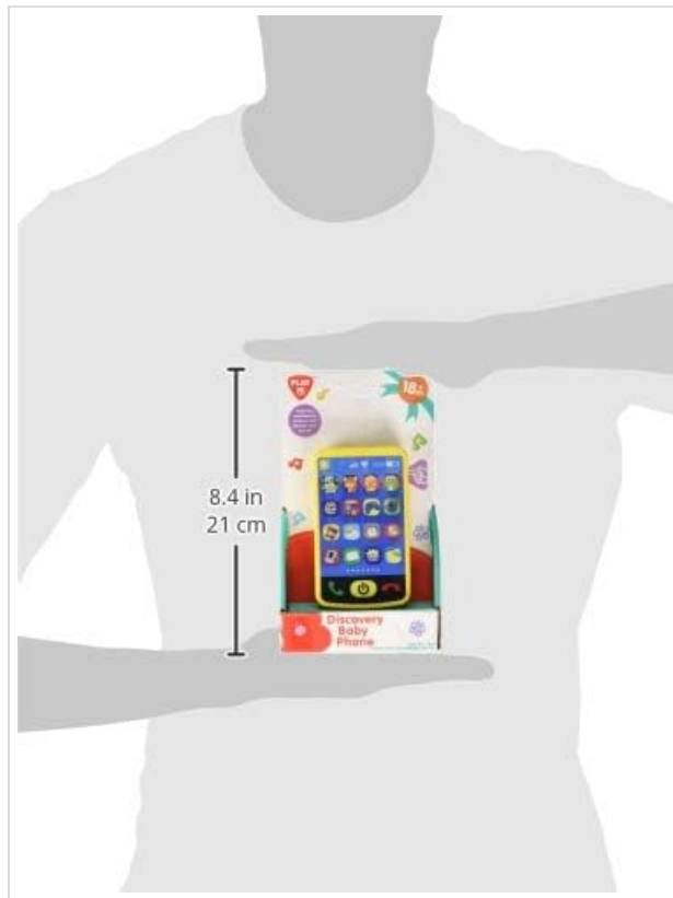
Image: A visual representation of the product's packaging dimensions, indicating a height of 8.4 inches (21 cm).