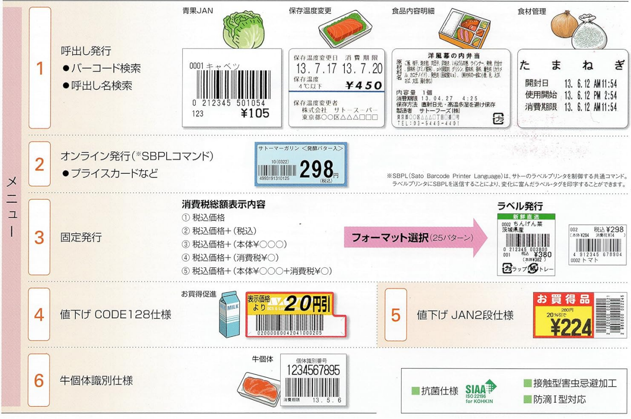
Image: A comprehensive overview of the diverse label issuance modes available, such as Call Issuance (barcode or name search), Online Issuance (SBPL Command), Fixed Issuance (with 25 patterns), Price Reduction (CODE128), Price Increase (JAN2-level), and Cattle Individual Identification. Examples of various labels are shown.