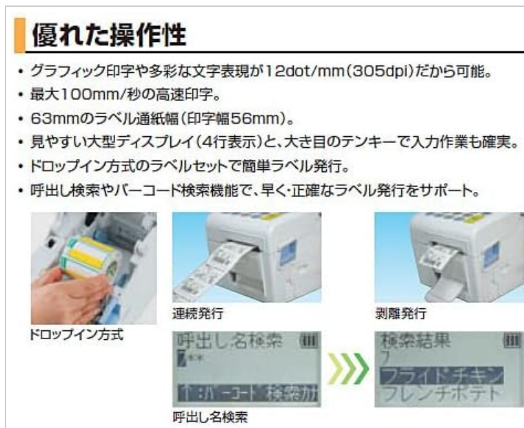
Image: The printer's front cover is open, illustrating the simple drop-in method for loading a label roll. This design facilitates quick and easy label replacement.