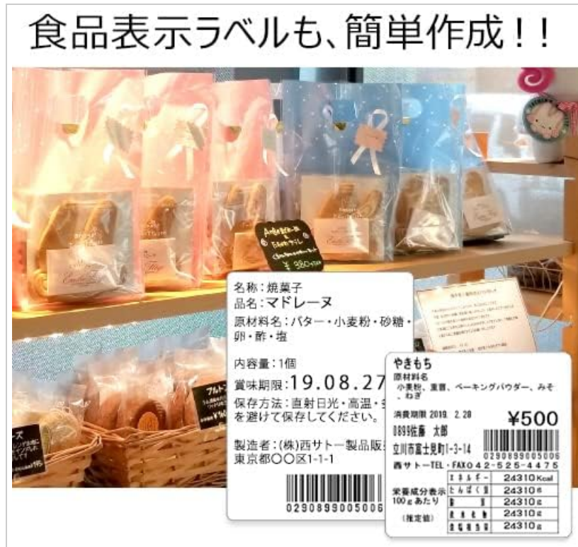
Image: Various examples of food display labels, including product name, ingredients, expiration date, and barcodes, demonstrating the printer's capability for easy label creation.

The Barlabe Fi212T can issue labels independently without a PC. Register label formats and data to the printer's internal memory via the SD card. Use the printer's keypad and display to select and print labels.