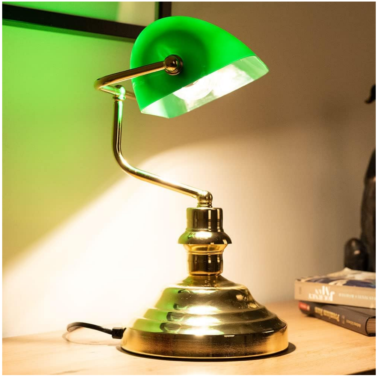
Figure 1: GLOBO LIGHTING 2491K Retro Style Green Table Lamp, illuminated.