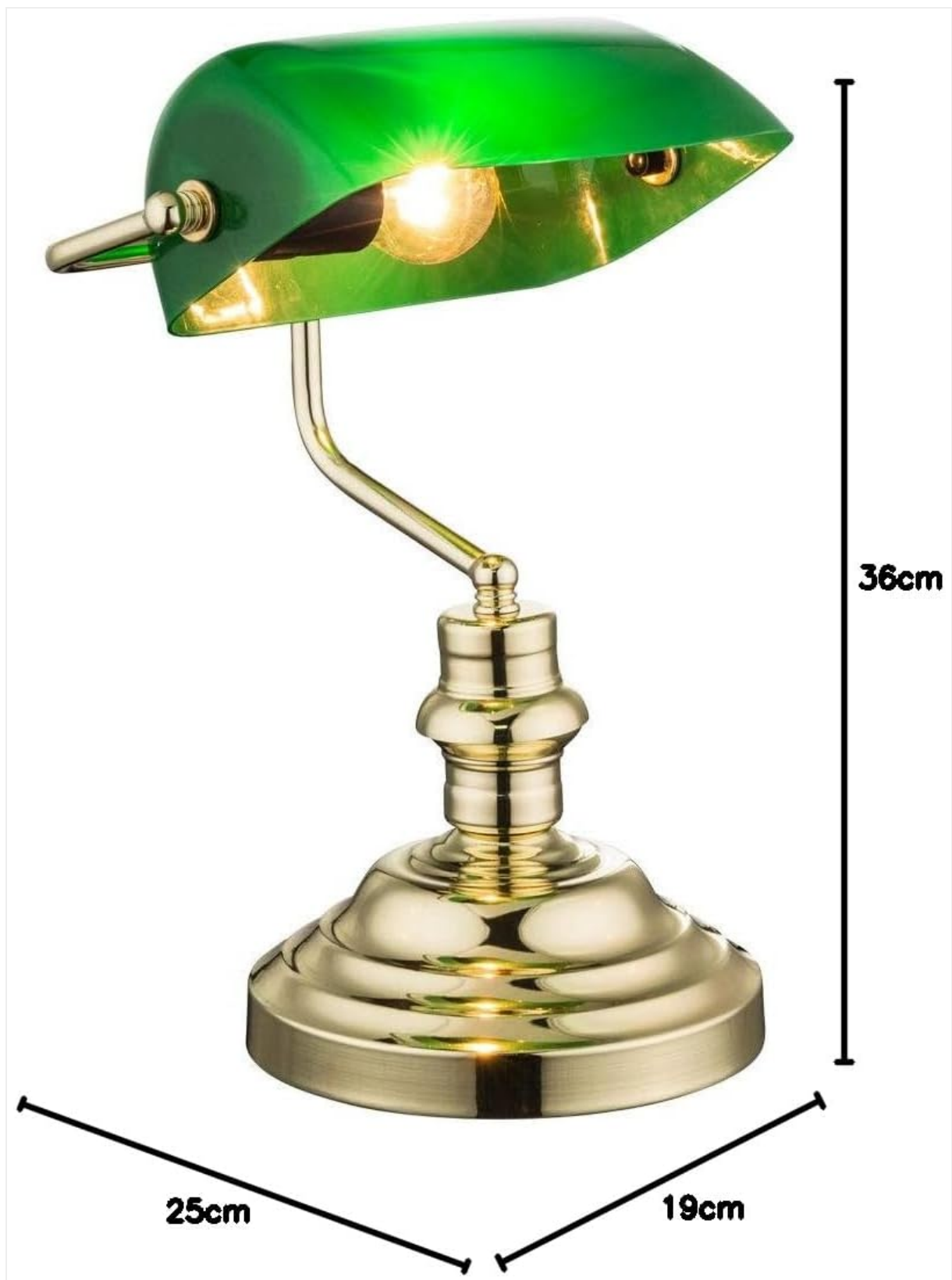
Figure 5: Product dimensions.