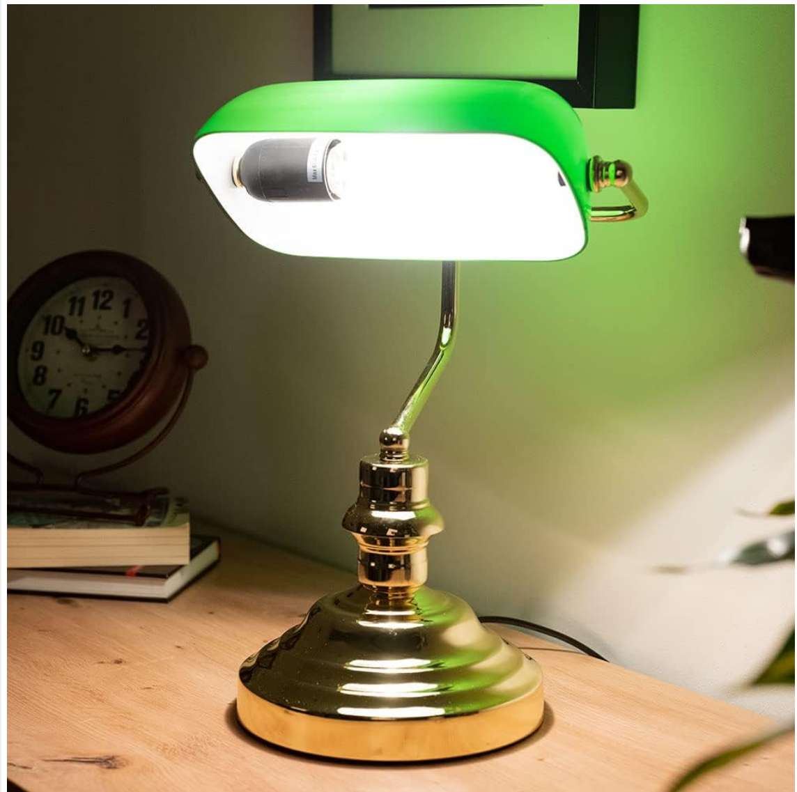
Figure 2: Bulb installation area within the shade.