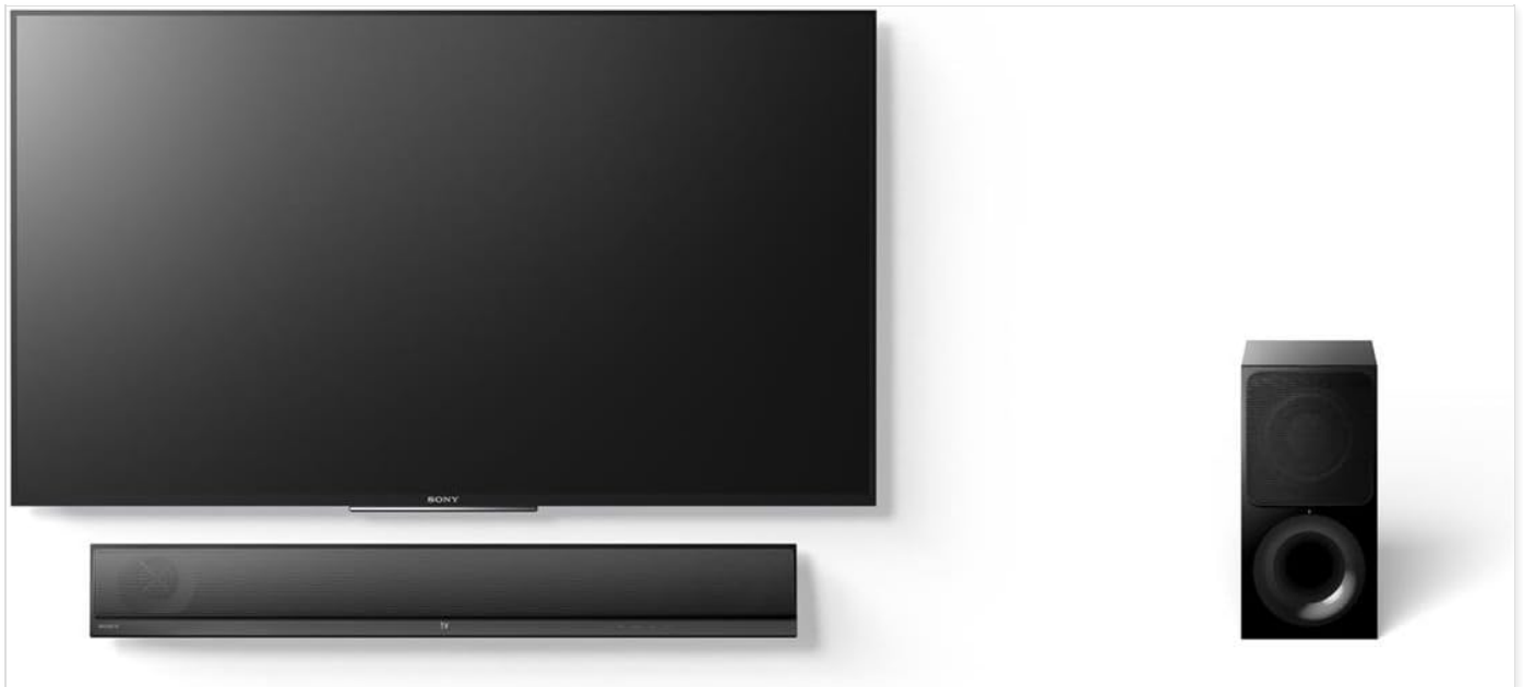
Image: The Sony HTCT390 sound bar positioned horizontally below a television, with the wireless subwoofer placed vertically to the right of the TV setup.

The sound bar can be placed on a TV stand or mounted on a wall. The wireless subwoofer offers flexible placement options, including upright or on its side.