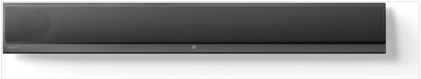
Image: A close-up view of the front panel of the Sony HTCT390 sound bar, showing the Sony logo on the left, a "BT" (Bluetooth) indicator in the center, and various control buttons on the right.