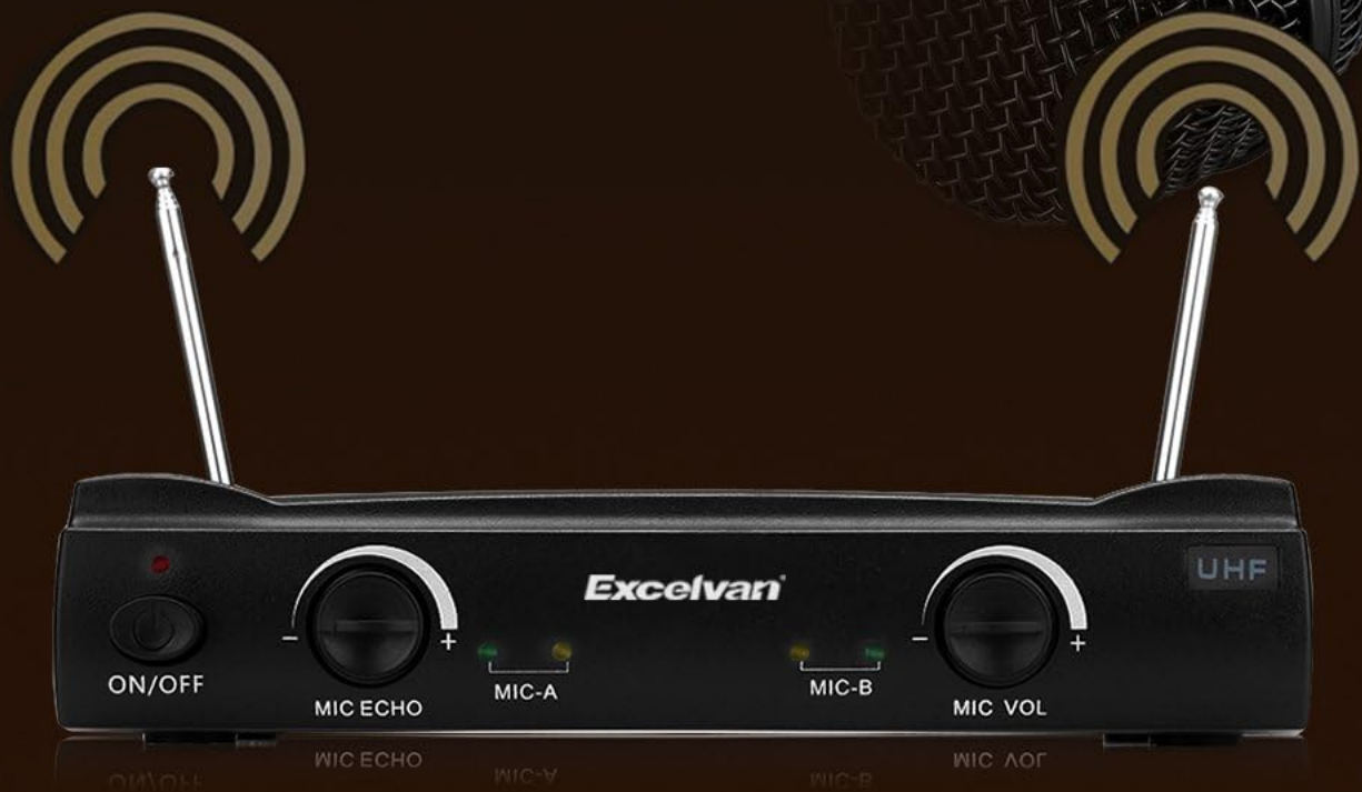
Figure 5.1: Wireless signal transmission and frequency points.

More than 200 frequency points to choose from. perfect receives no interference!