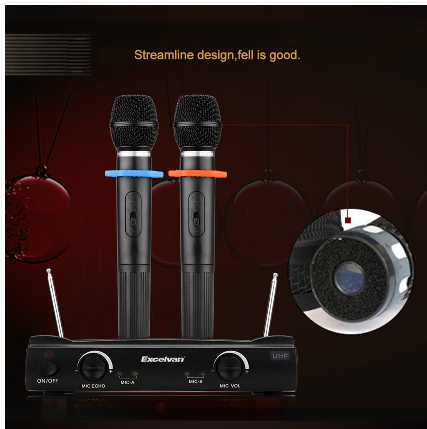
Figure 3.3: Wireless Microphones and Receiver Unit.

Each wireless microphone features an ON/OFF switch and internal battery compartment. The microphones operate on UHF frequencies, offering over 200 frequency points for clear signal reception.