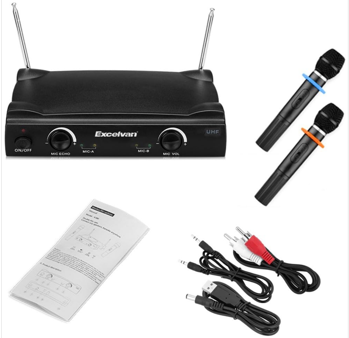
Figure 2.1: Contents included in the Excelvan K380 package.