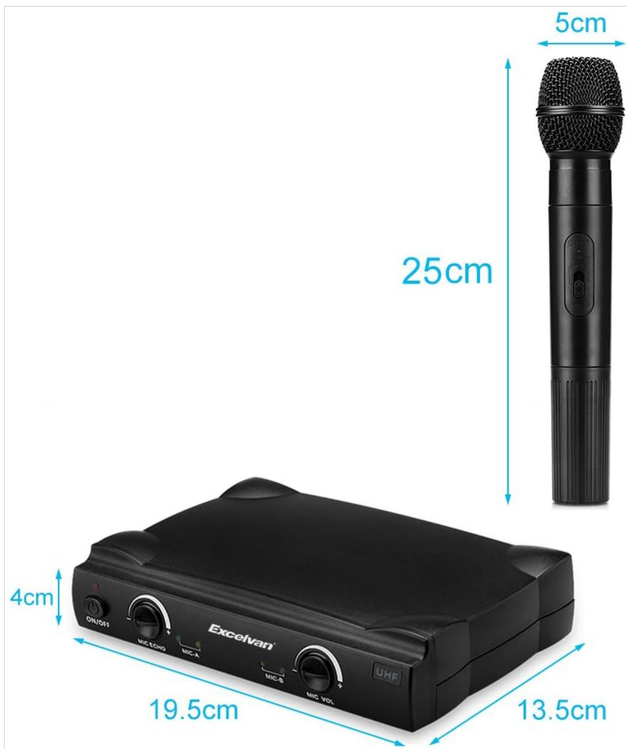
Figure 3.1: Dimensions of the Excelvan K380 receiver and microphone.