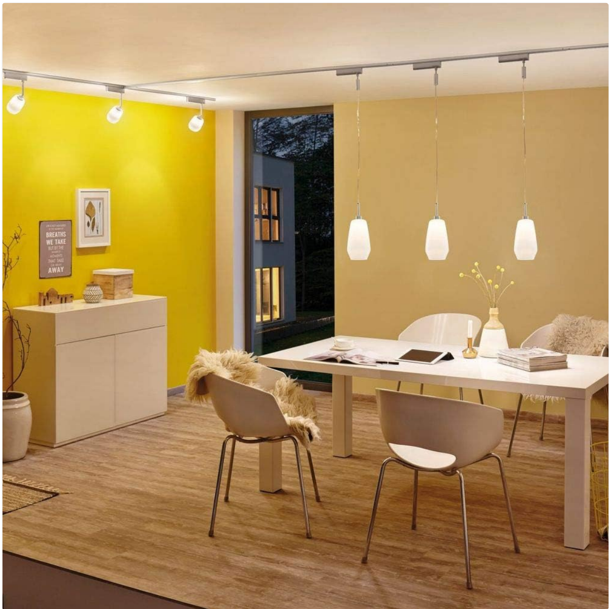
Image: An example of a Paulmann URail lighting system installed in a modern dining room, featuring both spotlights and pendant lights. This system can be controlled by the URail Remote.