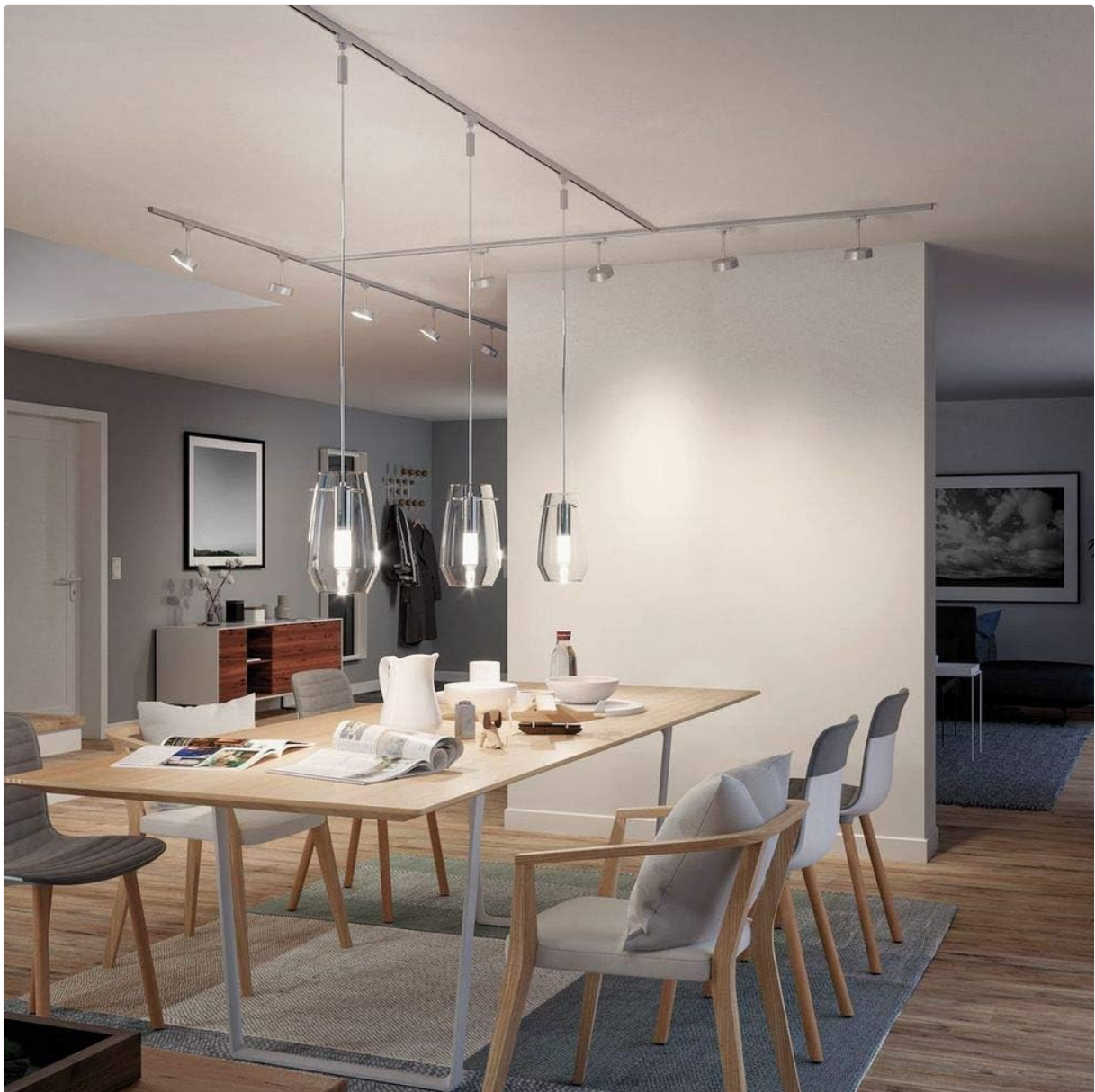
Image: A Paulmann URail track system illuminating a modern living and dining area, demonstrating the versatility of the system controlled by the remote.