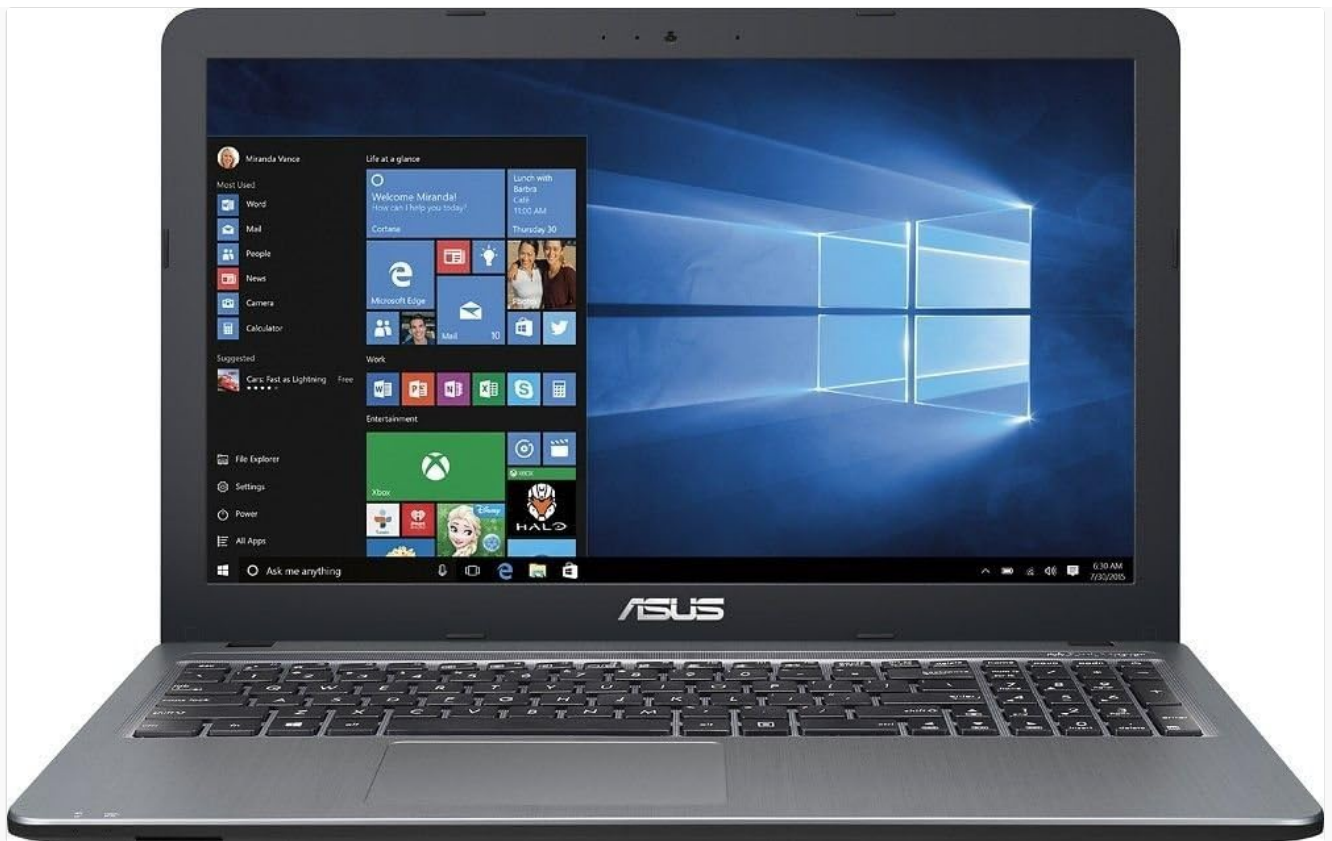
Figure 3.1: Front view of the laptop with the screen open, showing the keyboard, touchpad, and display.