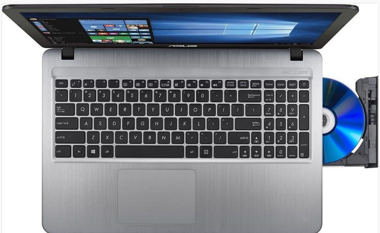
Figure 3.4: The chiclet-style keyboard includes a numeric keypad. The multi-touch touchpad is located below the keyboard.