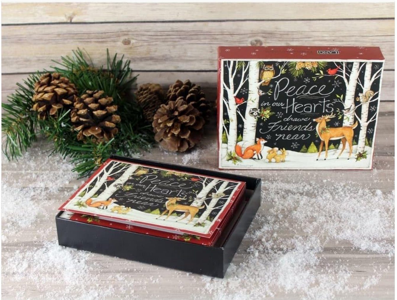
Image 2.3.1: The Christmas card set packaged in its decorative box.