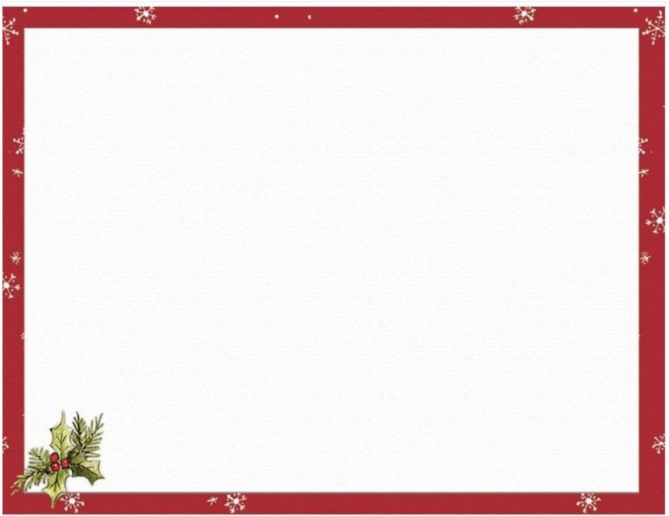
Image 2.2.1: Detail of the envelope's decorative pattern, which coordinates with the card design.