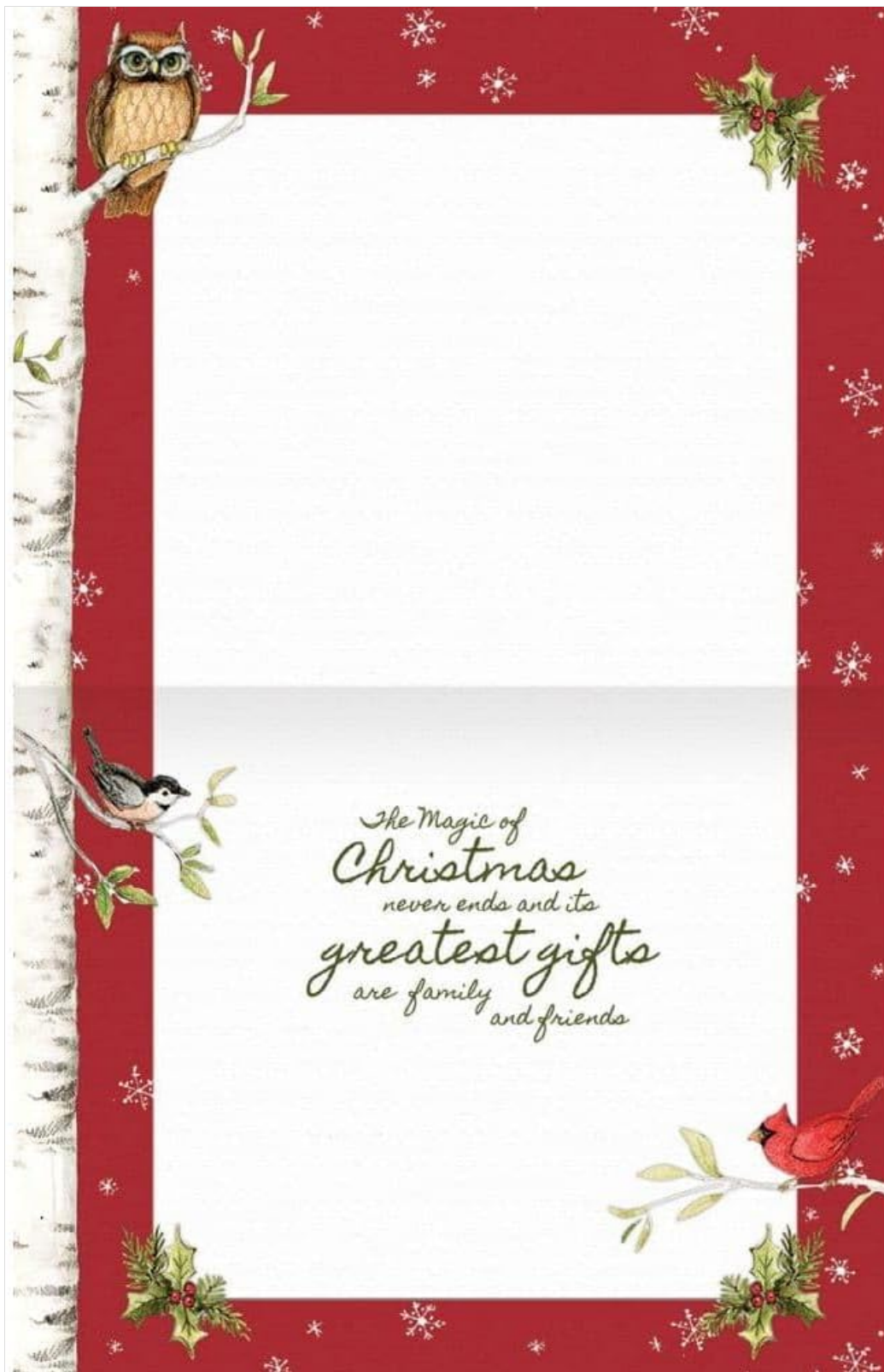
Image 2.1.2: Inside view of the LANG "Peace in Our Hearts" Christmas card, displaying the internal message.