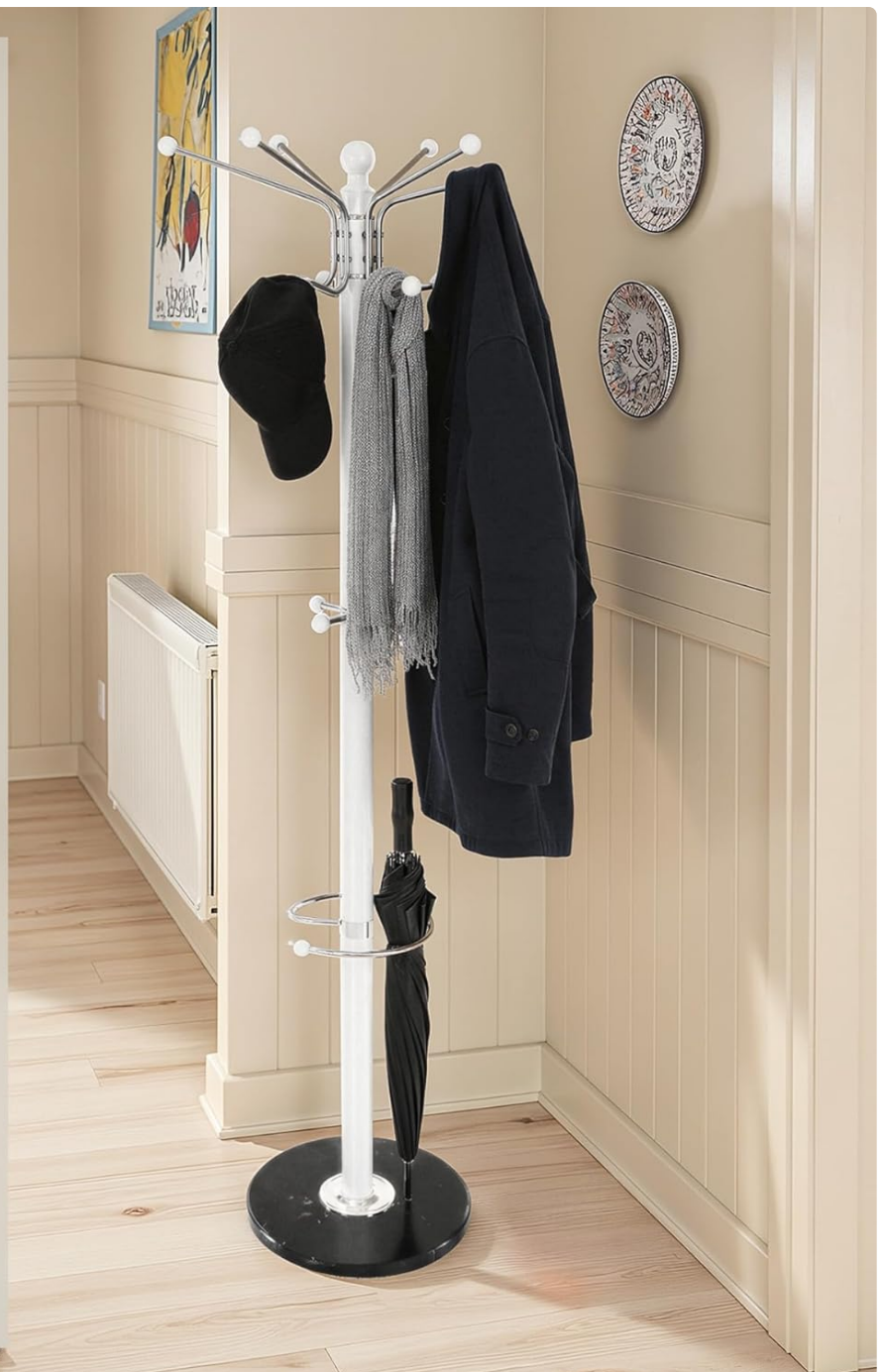
Image 1.1: The tectake Freestanding Metal Coat Rack, showcasing its design and functionality in an entryway setting. It features multiple hooks for garments and a dedicated space for umbrellas.