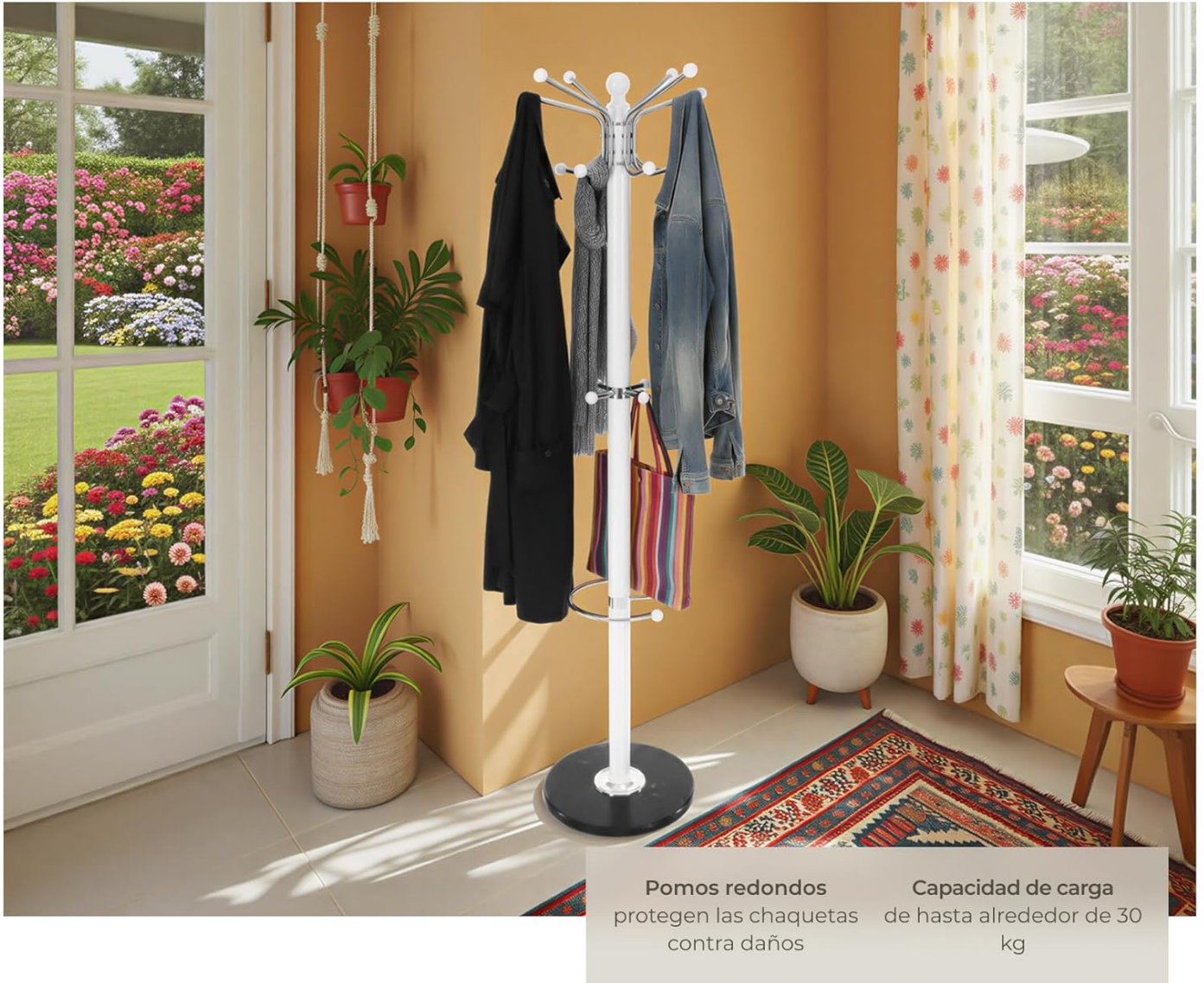
Image 3.1: The coat rack effectively organizing various items, demonstrating its capacity for coats, bags, and umbrellas, helping to maintain an orderly home.