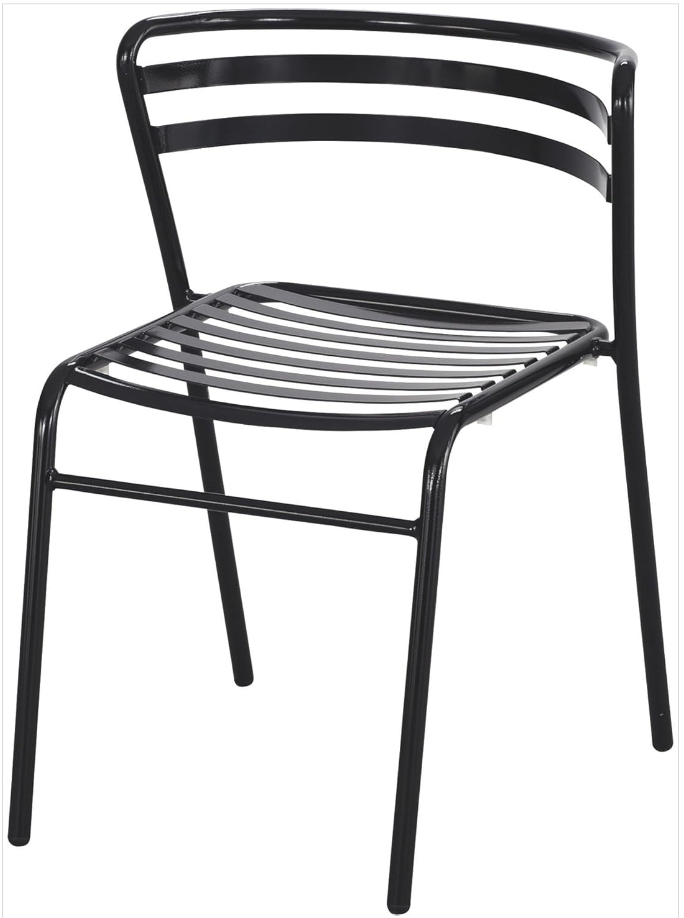
Image: A single black Safco CoGo Steel Chair, showcasing its sleek design and slatted seat and back. This chair is ready for immediate use upon unboxing.