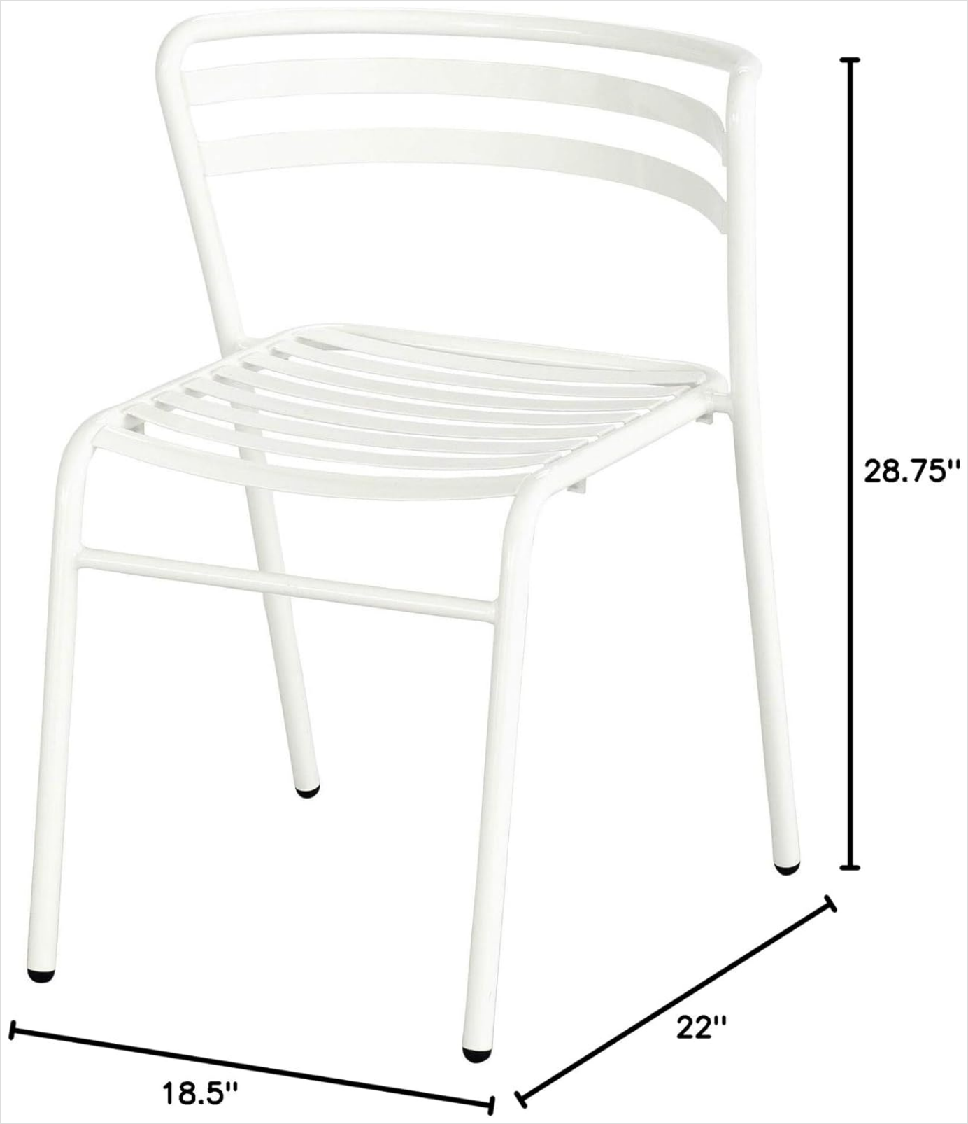
Image: A white Safco CoGo Steel Chair with overlaid measurements indicating its width (18.5"), depth (22"), and height (28.75").