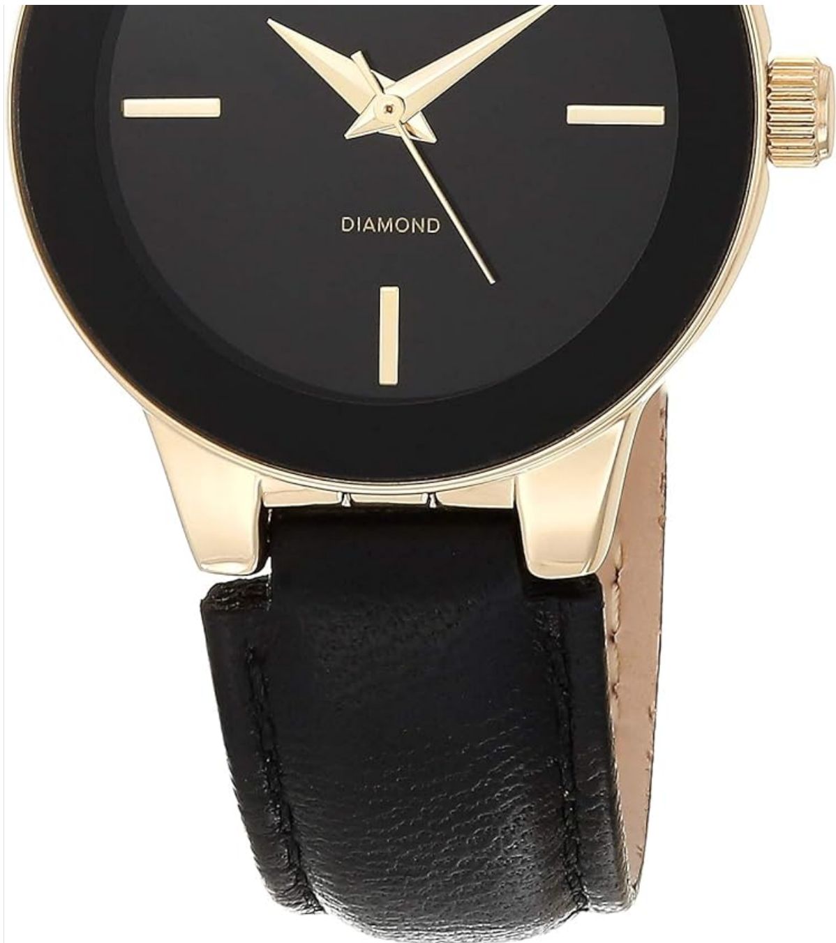
Image: Front view of the Armitron Women's Genuine Diamond Dial Leather Strap Watch, Model 75/5410.