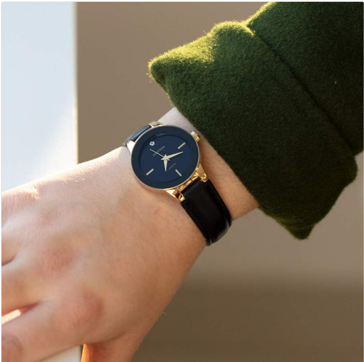
Image: The Armitron watch worn on a wrist, illustrating the fit of the leather strap.