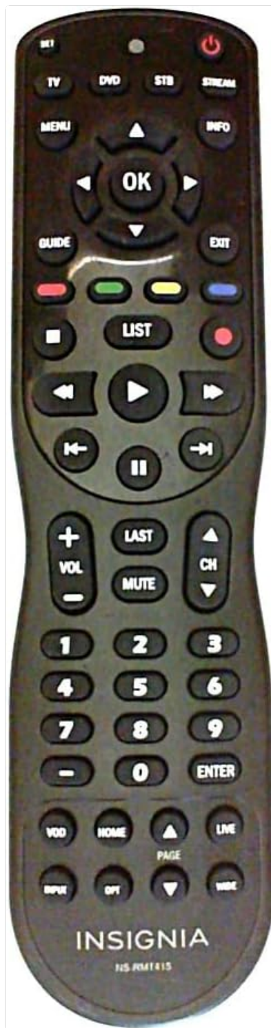
Figure 1: Insignia NS-RMT415 Universal Remote Control. This image displays the full layout of the remote, showing all buttons from the device selection buttons at the top to the Insignia branding at the bottom.

The Insignia NS-RMT415 remote control features a logical button layout for intuitive operation. Key sections include device selection buttons, navigation and menu controls, playback functions, numerical keypad, and special function buttons.