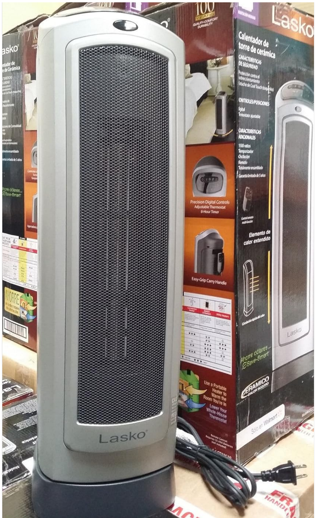
Figure 1: Front view of the Lasko CT22539 Ceramic Tower Heater, showing its sleek design and protective grille,