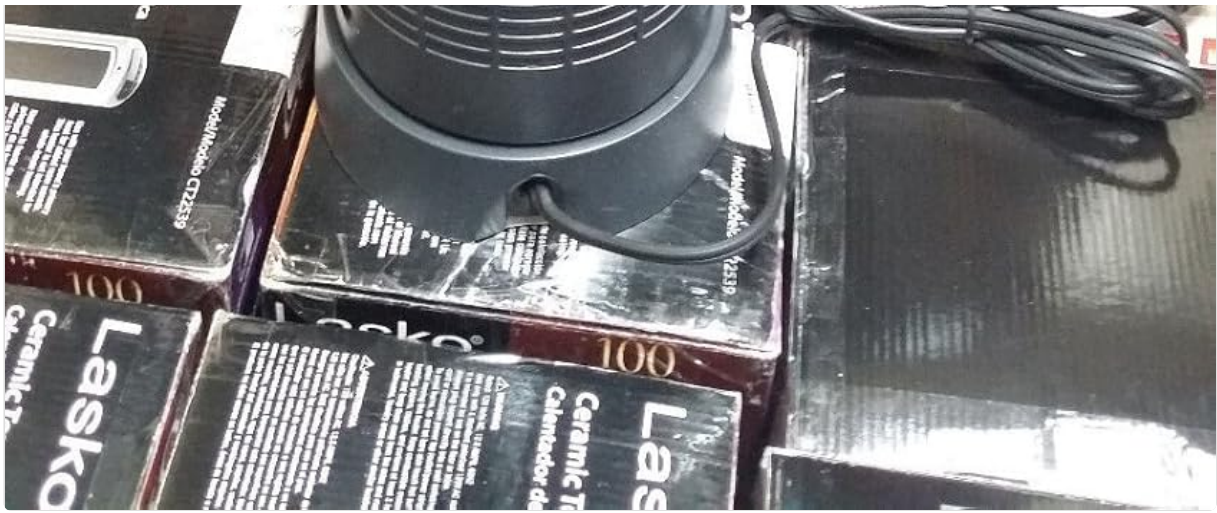
Figure 4: Rear view of the Lasko CT22539 Ceramic Tower Heater, showing the air intake grille and the power cord storage area.