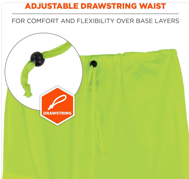
Figure 5: Detail of the adjustable drawstring waistband for a comfortable and flexible fit.