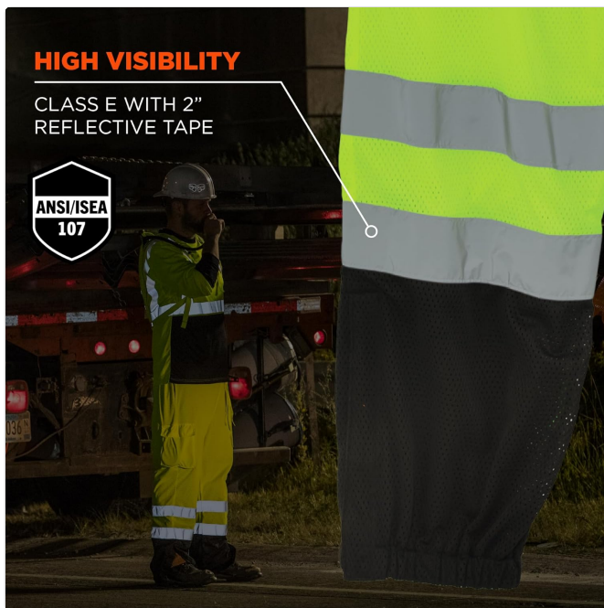
Figure 4: Example of high visibility pants worn in a low-light environment, showcasing reflective tape.