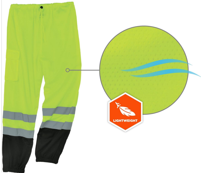
Figure 2: Detail illustrating the lightweight, breathable 3.3oz polyester mesh fabric.