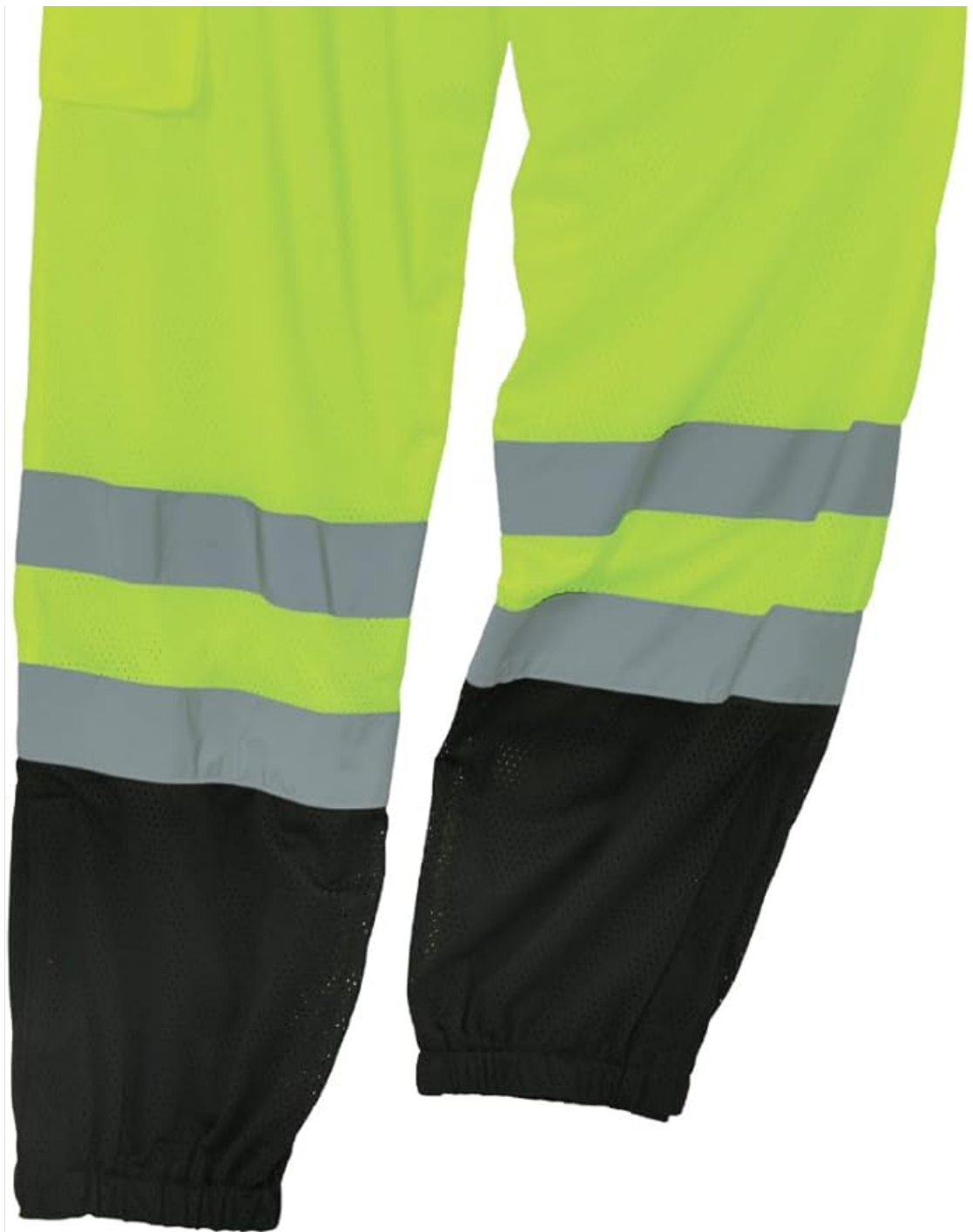
Figure 1: Front view of the Ergodyne GloWear 8910BK High Visibility Safety Pants.