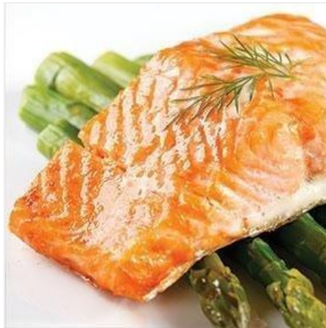
Image: A perfectly cooked salmon fillet with asparagus, demonstrating the even cooking capabilities.

The built-in Genius Sensor automatically adjusts power levels and cooking times by detecting the moisture level in your food. This eliminates guesswork, ensuring optimal results for various dishes, from reheating leftovers to cooking fresh vegetables.