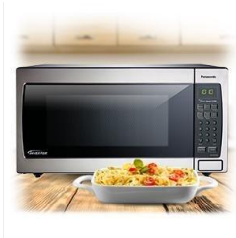
Image: The microwave oven with a dish of pasta, illustrating the interior capacity.

Place the roller ring in the center of the oven cavity floor. Place the glass tray securely on top of the roller ring. Ensure the glass tray is properly seated on the center hub.