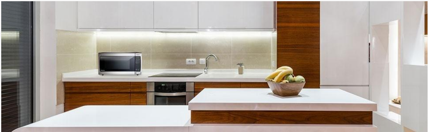
Image: The Panasonic NN-SN766S microwave oven placed on a kitchen countertop.

Your browser does not support the video tag.