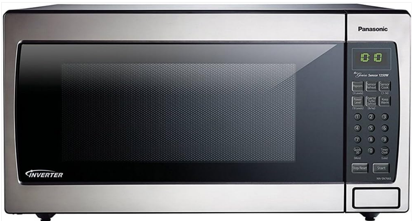
Image: Front view of the Panasonic NN-SN766S Stainless Steel Microwave Oven.

This manual provides detailed instructions for the safe and efficient operation of your Panasonic NN-SN766S Microwave Oven. Featuring advanced Inverter Technology and a Genius Sensor, this 1.6 cubic foot, 1250W microwave is designed for consistent cooking results and convenient use. Please read all instructions carefully before using the appliance.