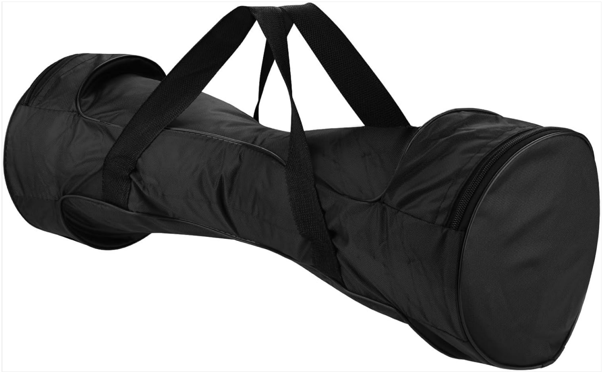
Figure 2.1: The Cosmos Portable Hoverboard Carry Bag, showcasing its design and handles.