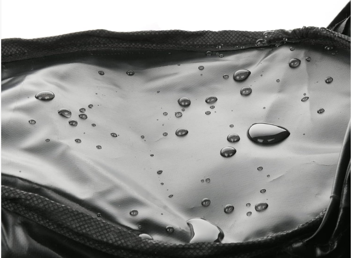
Figure 2.5: The internal waterproof coating, designed to protect the scooter from rain and moisture.