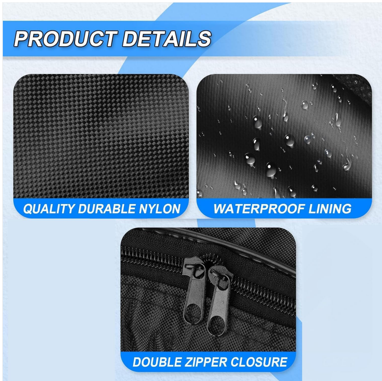
Figure 2.3: Detailed view of the bag's construction, highlighting the durable nylon, waterproof lining, and double zipper.