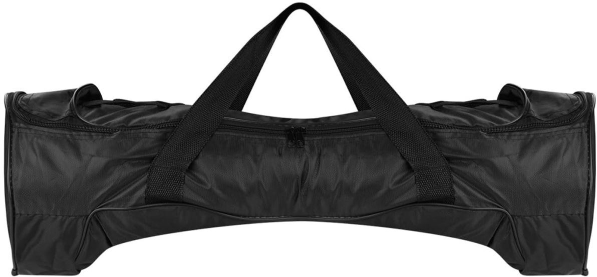
Figure 2.4: Visual representation of the bag's key attributes: durability, smooth zippers, and waterproof/washable design.