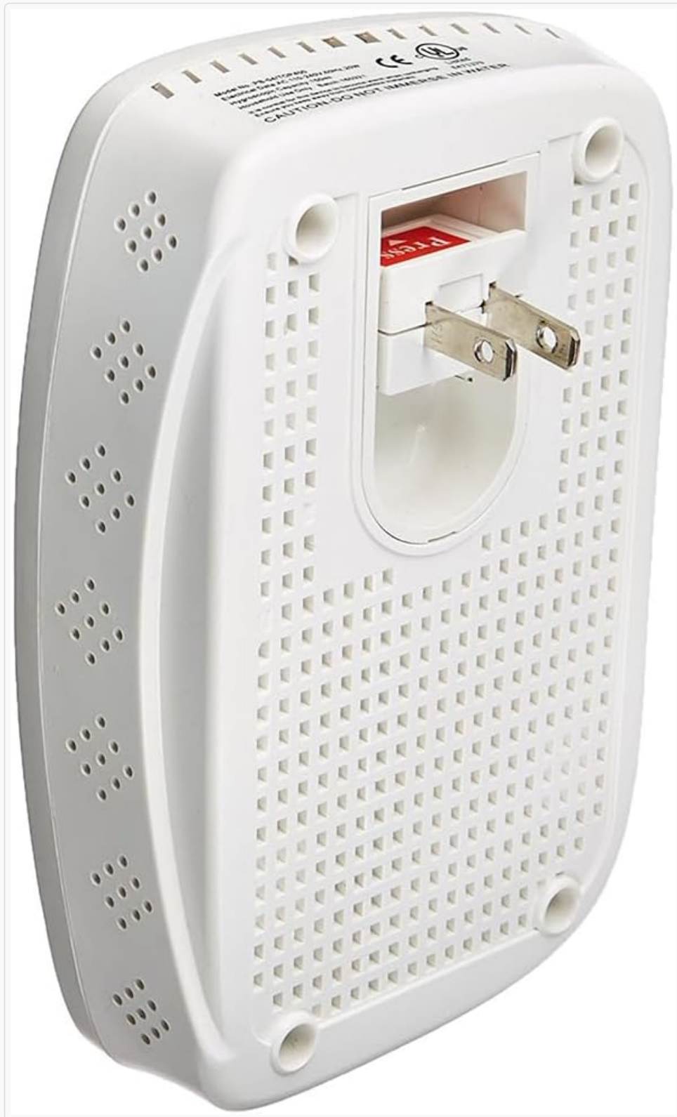
The back of the dehumidifier features a retractable plug for convenient recharging.