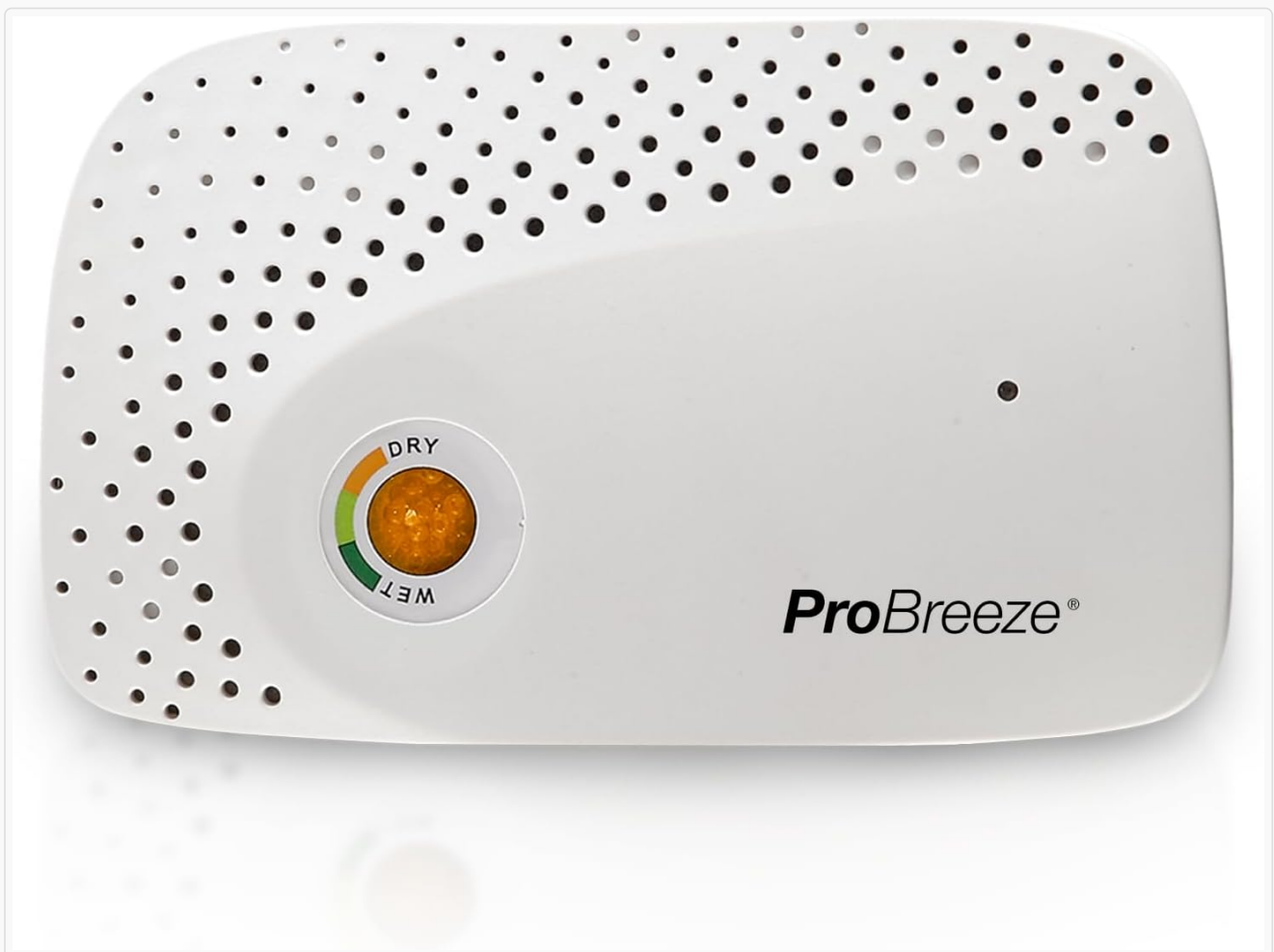
Front view of the Pro Breeze PB-04-US Renewable Mini Dehumidifier, showing its compact white design and the moisture indicator window.

The Pro Breeze™ PB-04-US Renewable Mini Dehumidifier is a compact, cordless device designed to effectively remove excess moisture from small, enclosed spaces. Utilizing advanced silica gel technology, this dehumidifier helps prevent issues caused by high humidity, such as mold, mildew, odors, and dampness, without the need for wires or cables during operation. Its renewable design allows for repeated use, making it an environmentally friendly and cost-effective solution for moisture control.