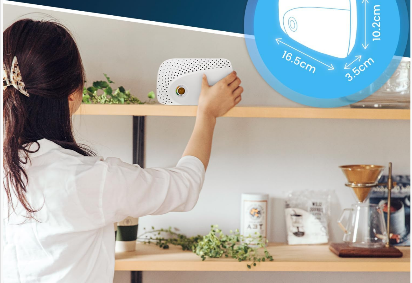
Visual representation of the compact dimensions of the dehumidifier.

Easy to move from room to room and neatly store in small spaces.