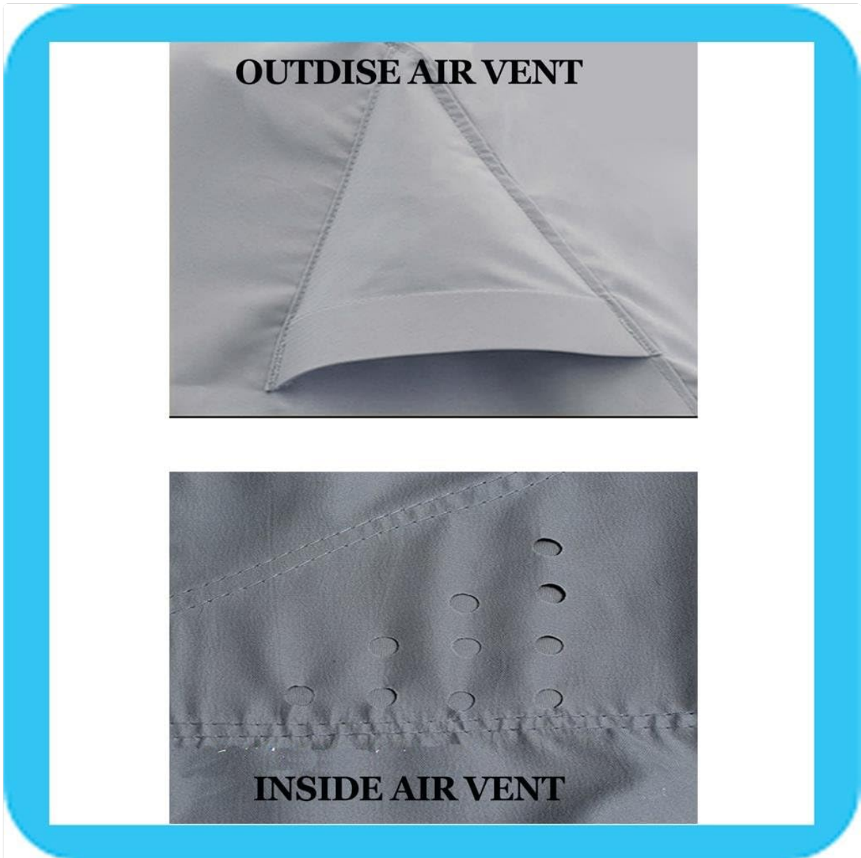
Figure 3.2: Detailed view of the strategically placed air vents, designed to prevent wind lofting and ensure proper ventilation.