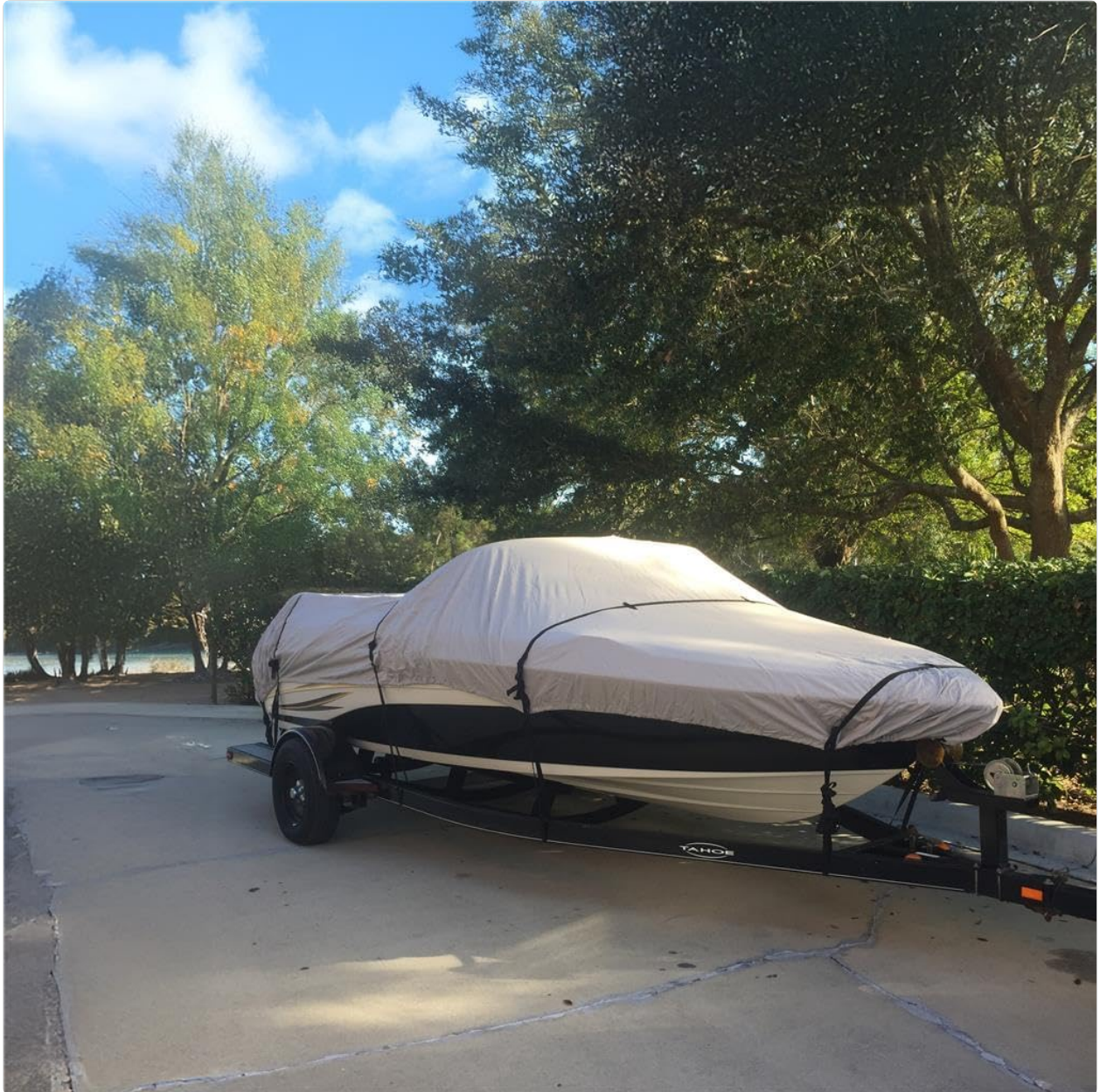
Figure 3.1: The SBU Boat Cover providing protection for a boat on a trailer in an outdoor environment.

The cover includes air vents to prevent wind lofting during trailering and to allow for proper air circulation, reducing moisture buildup and mildew formation.