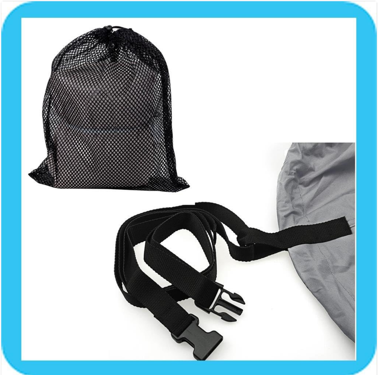
Figure 2.2: The convenient storage bag and essential tie-down trawling straps included with your SBU Boat Cover.

Your browser does not support the video tag.