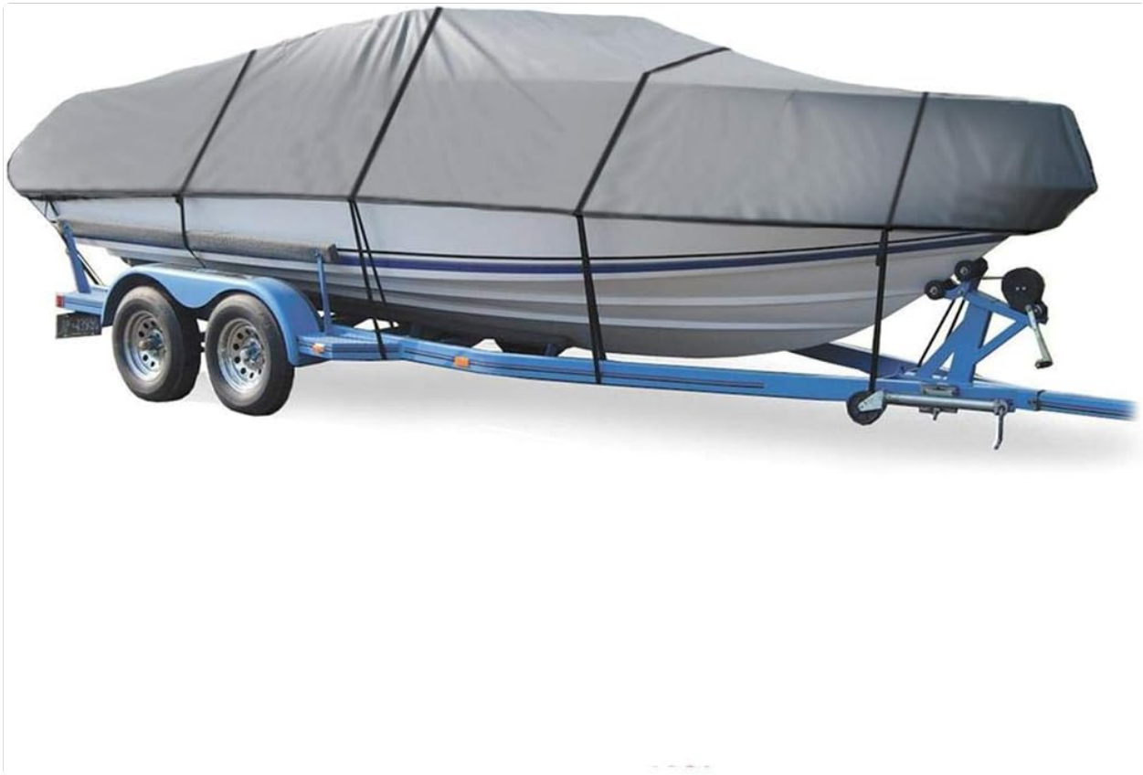
Figure 1.1: The SBU Boat Cover securely fitted on a MAXUM 2100 XC I/O 1991 boat, ready for protection.