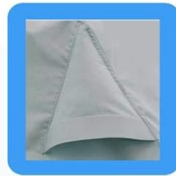
Figure 2.1: Overview of the boat cover's key components, including the water-resistant material, securing buckles, storage bag, and air vents.