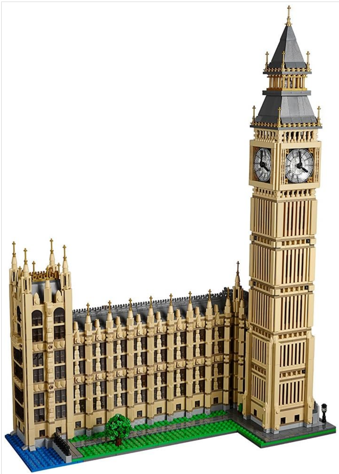
Figure 3.1: An angled view of the completed model, demonstrating the intricate details achieved through careful assembly.

The assembly process is divided into sections, typically corresponding to the numbered bags. It is recommended to complete one section before opening the next set of bags.