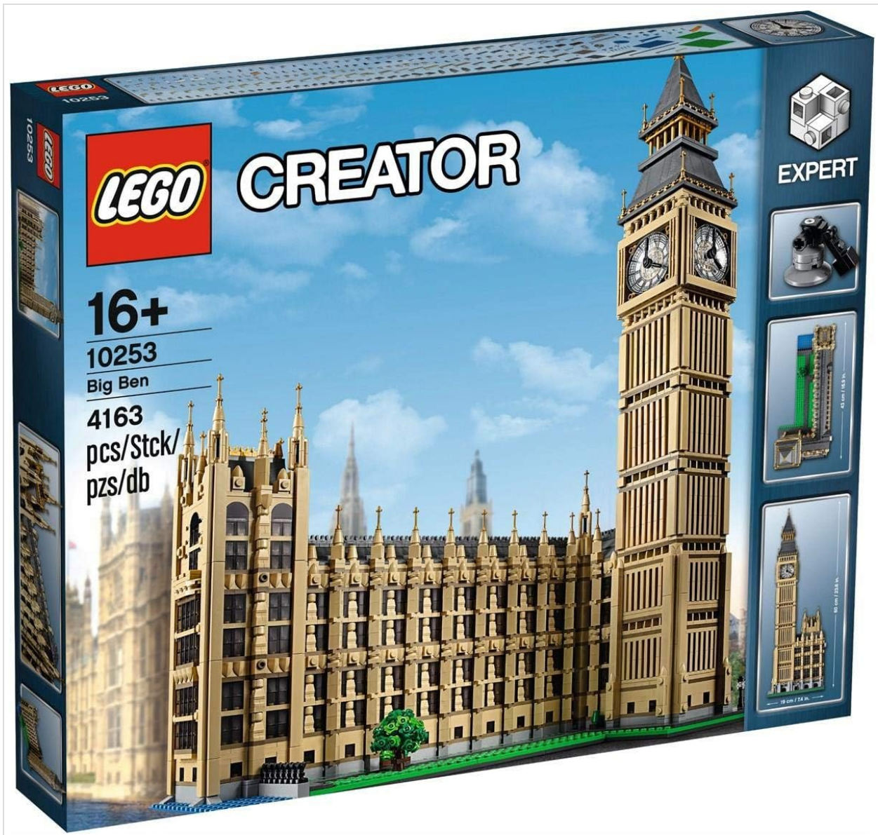
Figure 2.1: Packaging for the LEGO Creator Expert 10253 Big Ben Building Kit, indicating the 4,163 piece count.