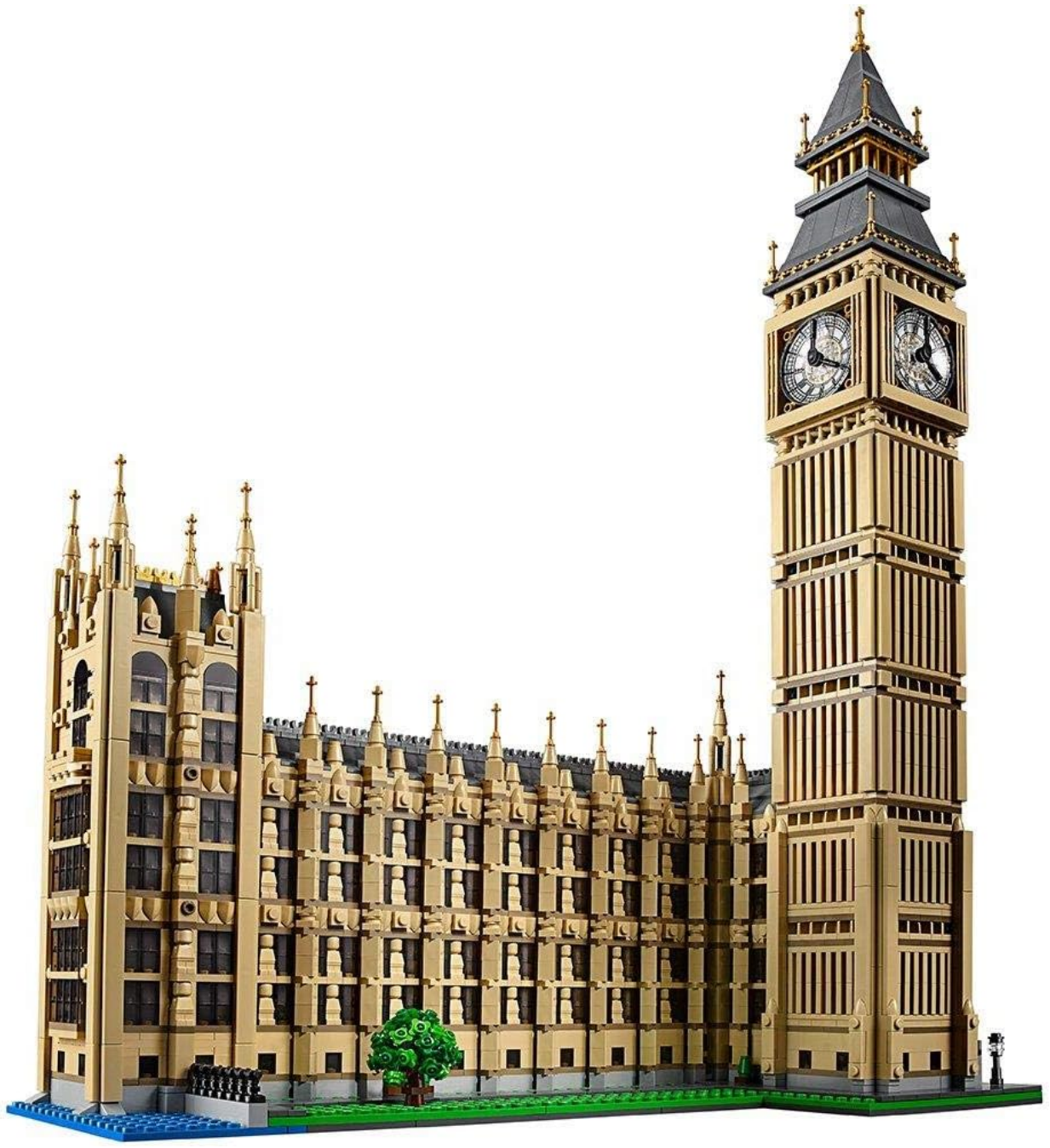
Figure 1.1: The fully assembled LEGO Creator Expert 10253 Big Ben model, showcasing the Elizabeth Tower and a portion of the Palace of Westminster.

The model features a sculptural facade with windows, statues, and shields, the iconic clock tower with golden spires, intricate detailing, the Ayrton Light, and four crafted clock dials with movable hour and minute hands. The top of the tower is removable to reveal the Big Ben bell. A grass area, tree, and sidewalk are included to depict the building's location.