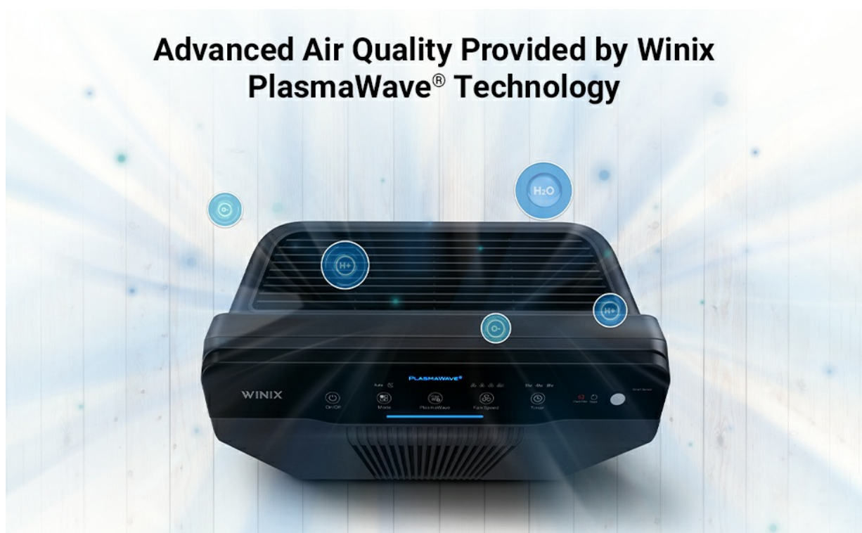
Figure 3: Detailed view of the control panel with various function buttons.