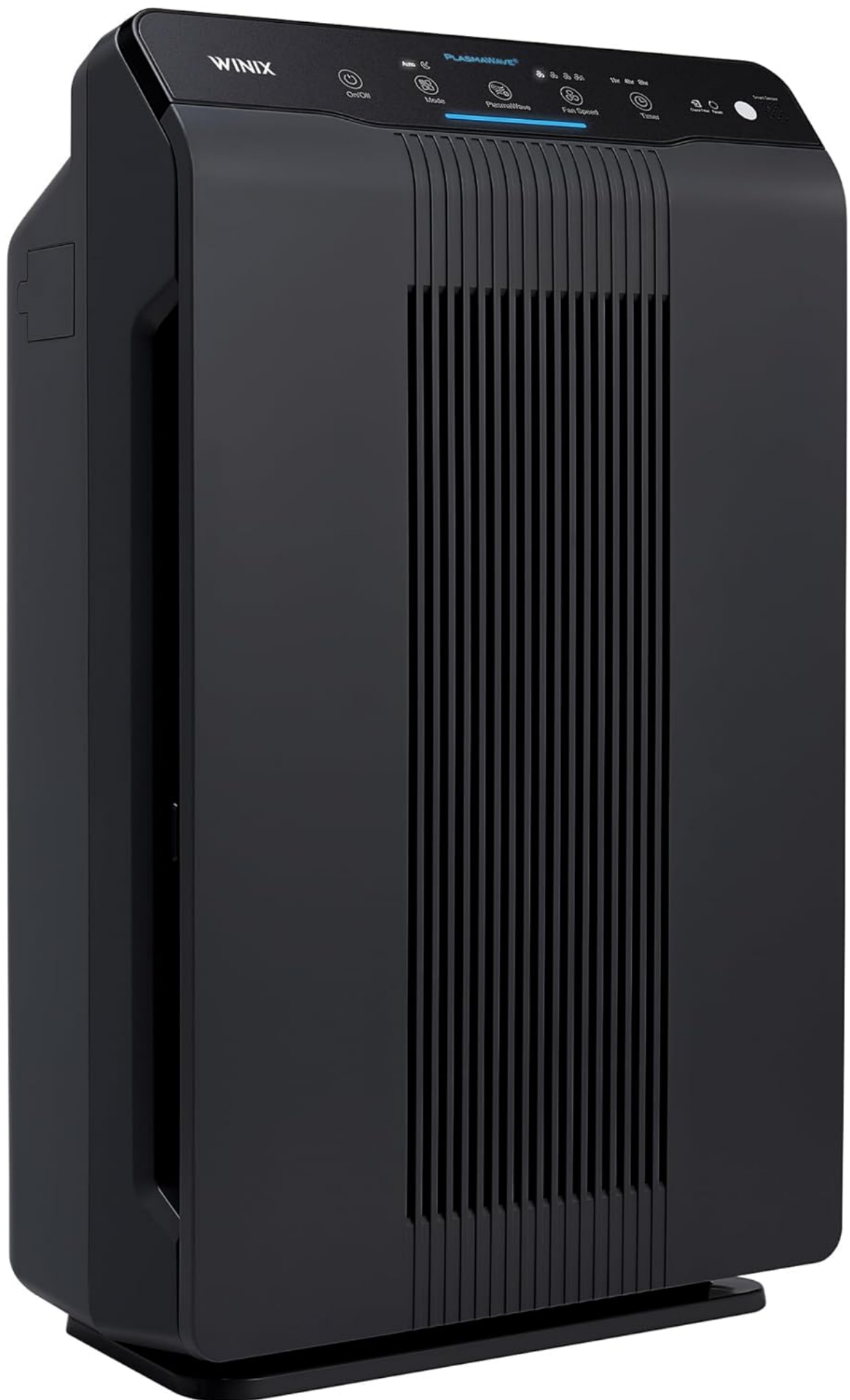
Figure 1: Front view of the Winix 5500-2 Air Purifier in Charcoal Gray.