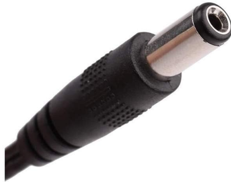
Figure 2: Barrel Connector. This image highlights the barrel connector, which plugs into the compatible device.