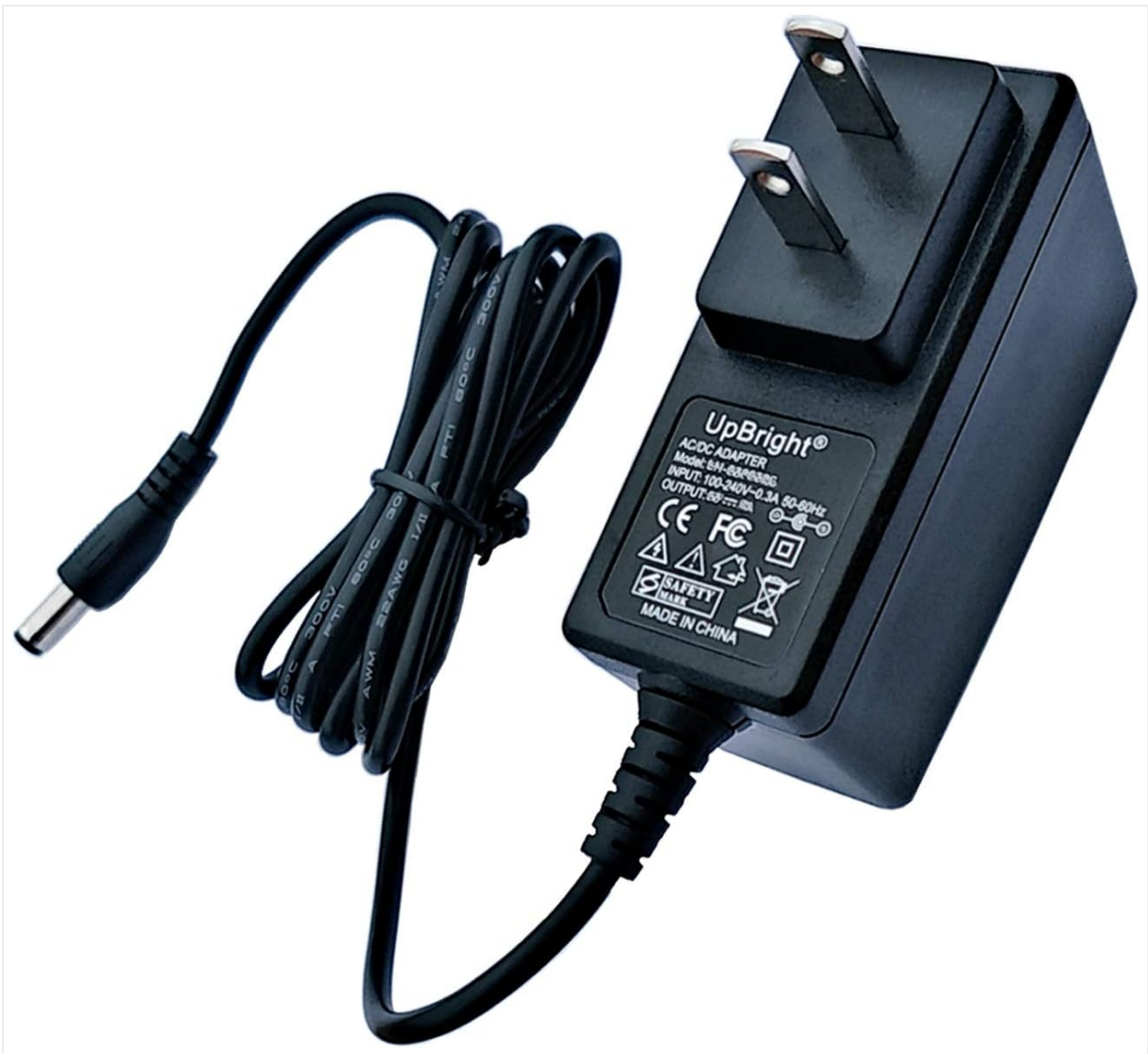
Figure 1: UpBright 12V AC/DC Adapter. This image shows the complete adapter unit with its attached power cord and barrel connector.