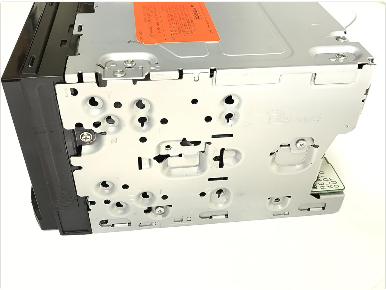
Figure 4.3: Side view of the AVIC-8200NEX chassis.