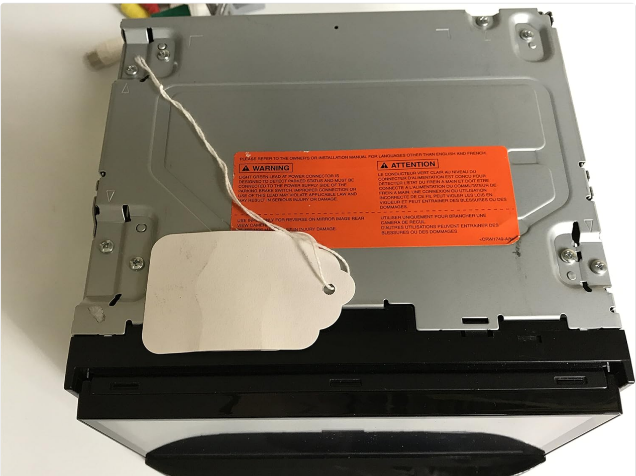
Figure 4.2: Top-rear view of the AVIC-8200NEX chassis.