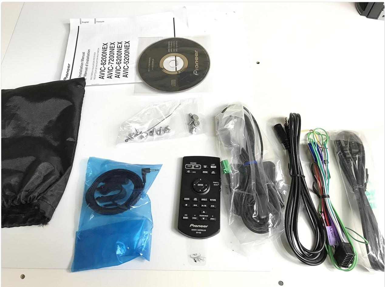
Figure 3.1: Included accessories and components with the AVIC-8200NEX receiver.