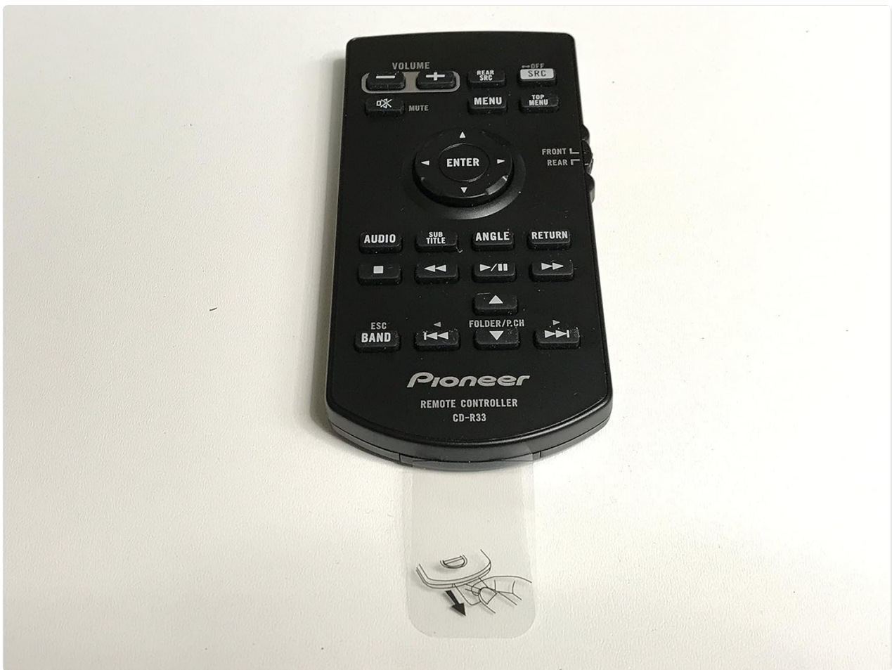
Figure 3.4: Pioneer CD-R33 Remote Control.