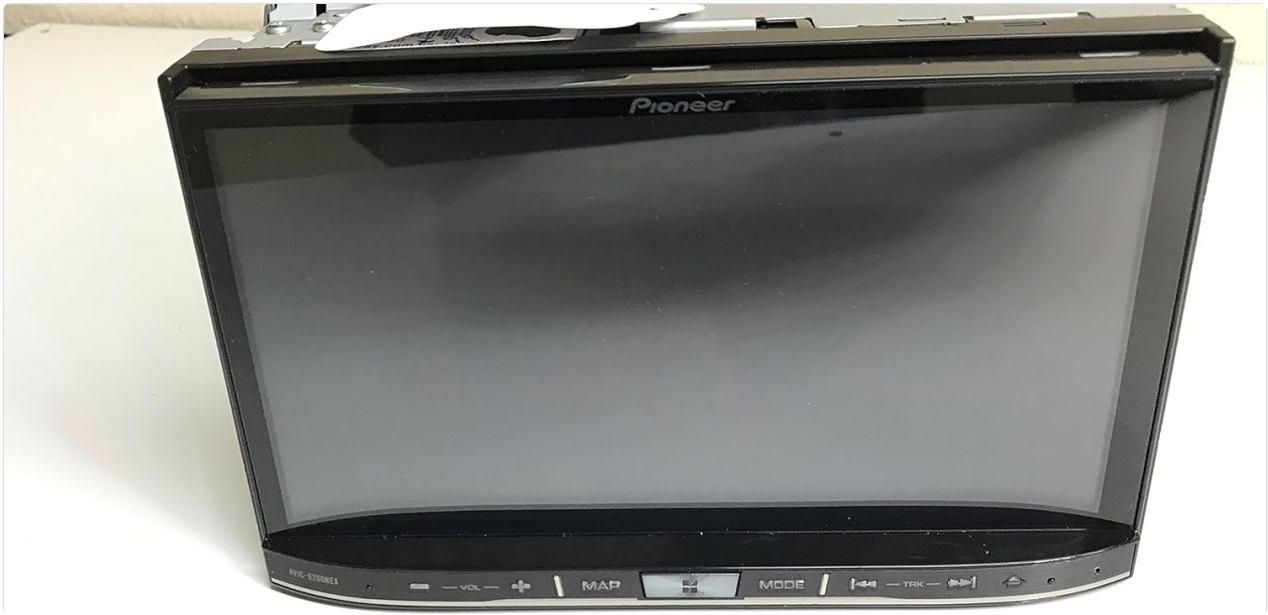
Figure 3.2: Front view of the AVIC-8200NEX receiver.

The main unit is a double-DIN receiver with a 7-inch capacitive touchscreen. It features various ports on the rear for connectivity, including USB, RCA, and antenna inputs.