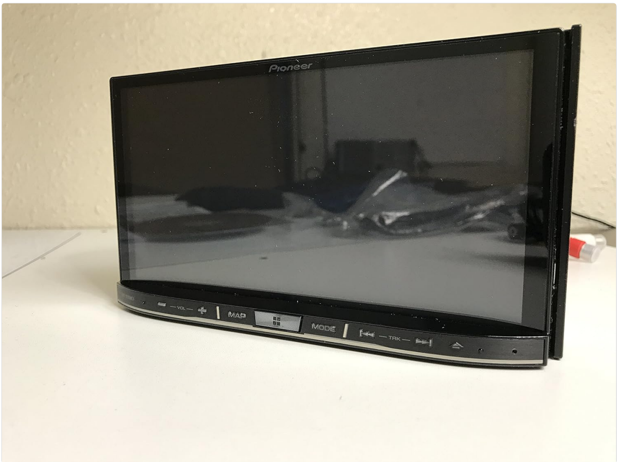
Figure 3.3: Angled view of the AVIC-8200NEX receiver.