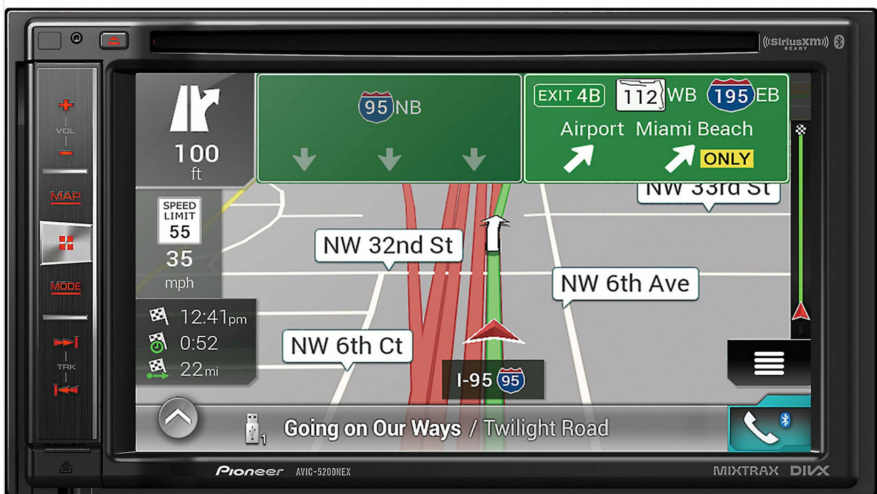
Figure 1: Front view of the Pioneer AVIC-5200NEX Navigation Receiver.

This manual provides essential instructions for the proper installation, operation, and maintenance of your Pioneer AVIC-5200NEX Navigation Receiver. The AVIC-5200NEX is a versatile in-dash unit featuring a 6.2-inch touchscreen, Apple CarPlay compatibility, GPS navigation, and various media playback options. Please read this manual thoroughly before using the product to ensure safe and optimal performance.