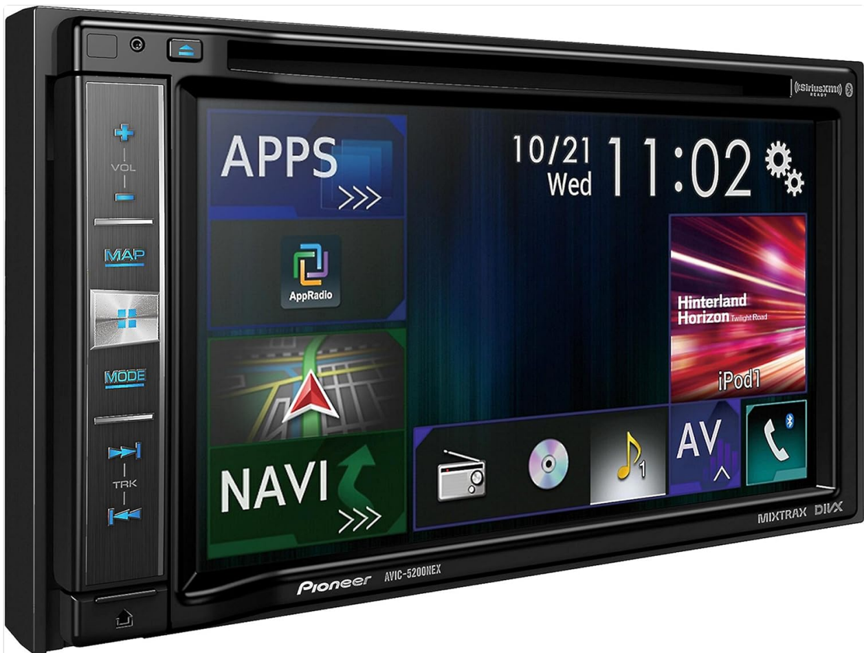
Figure 3: Main menu interface of the AVIC-5200NEX, showing icons for various functions like Radio, Apple CarPlay, Android Auto, and USB.