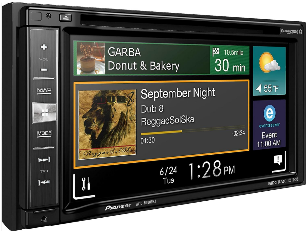
Figure 4: Navigation screen displaying map data, current speed, and media playback information.