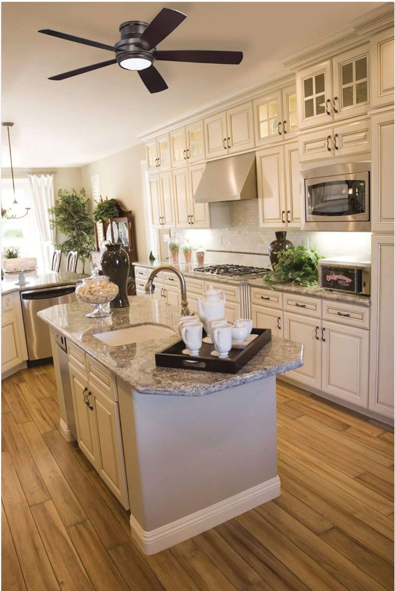
Image: Craftmade Tempo 44 Inch Flush Mount Ceiling Fan with LED Light and Remote, Oiled Bronze finish. This image shows the complete fan assembly.