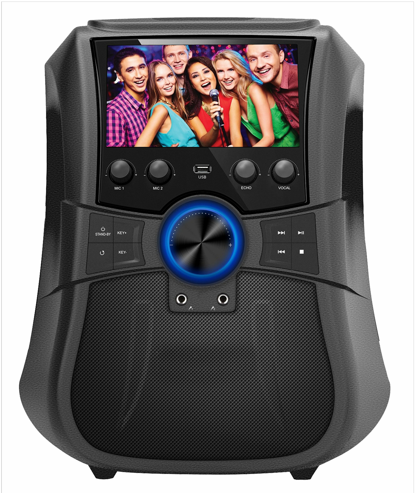
Figure 1: Front view of the SuperSonic SC-3077K Karaoke System, showing the 7-inch LCD screen, control panel, and speaker grille.