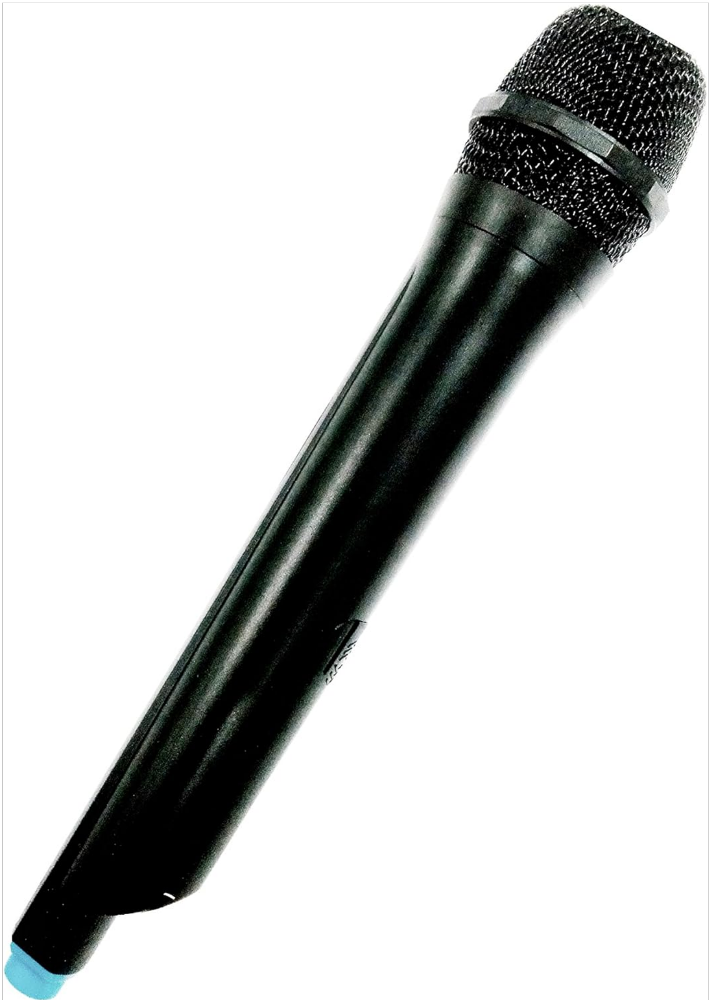
Figure 3: The wired microphone included with the SuperSonic SC-3077K Karaoke System, designed for vocal input.