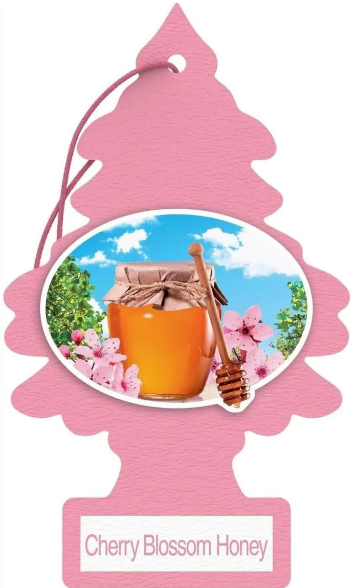
Image 1.1: Front view of the LITTLE TREES Cherry Blossom Honey air freshener.