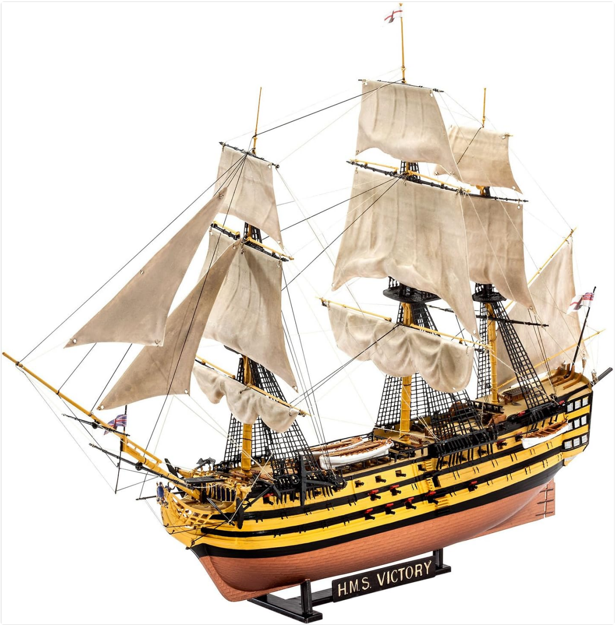
Image: The fully assembled Revell HMS Victory model, showcasing its complete rigging, sails, and detailed hull on a display stand.