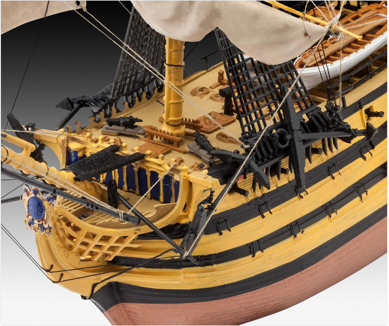
Image: A detailed view of the bow and foredeck of the assembled HMS Victory model, highlighting the intricate carvings and deck features.