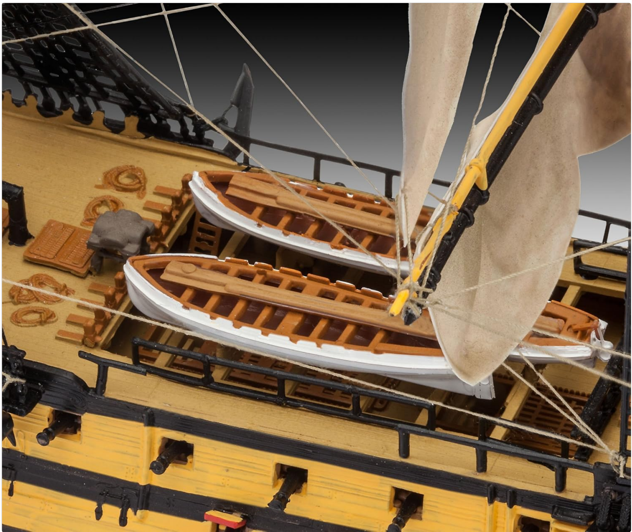
Image: A close-up of the midship section of the HMS Victory model, showing the lifeboats stowed on deck and other deck furniture.