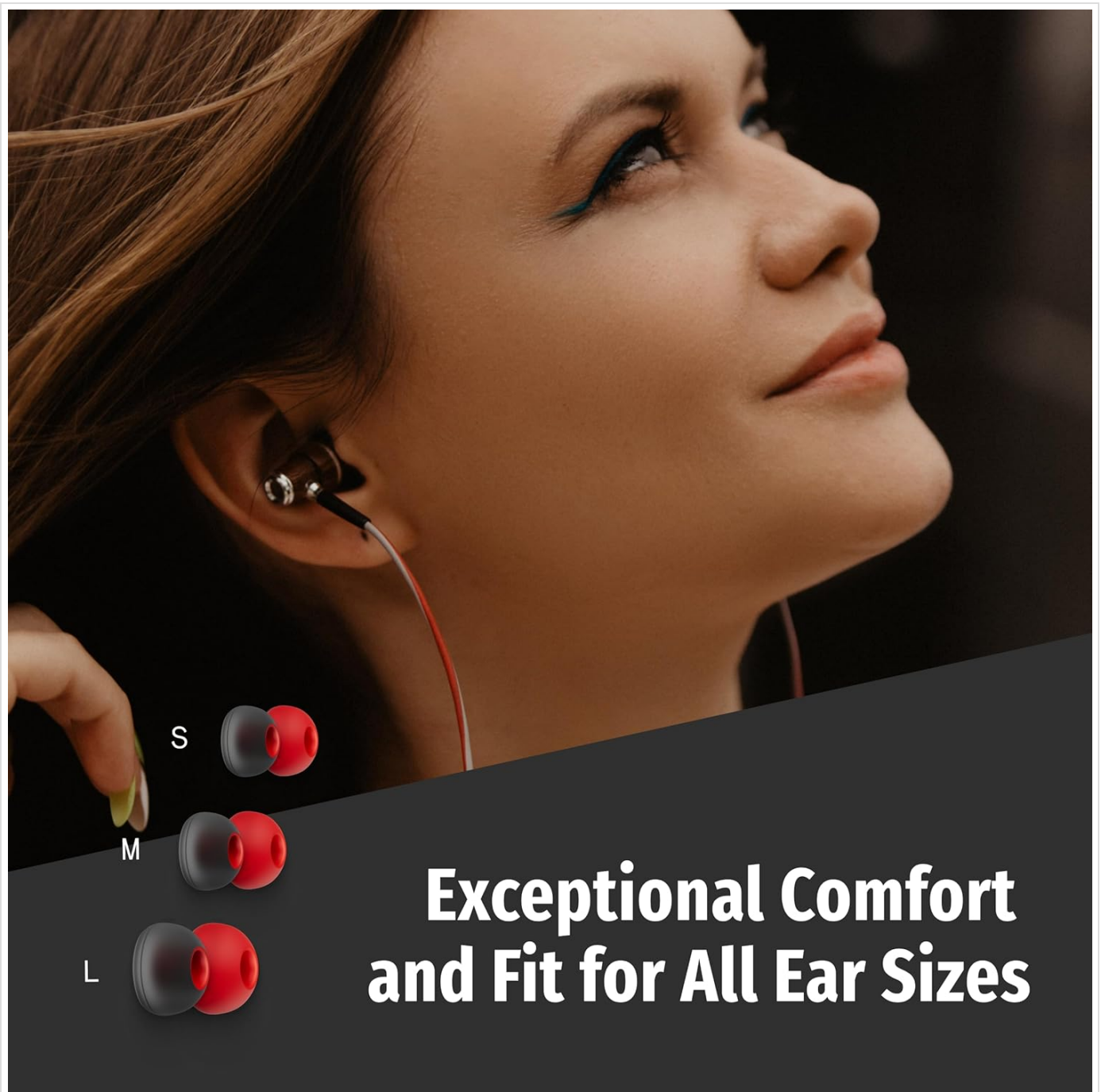
Image: Illustration of different ear tip sizes (S, M, L) and how they fit in the ear for optimal comfort and sound.