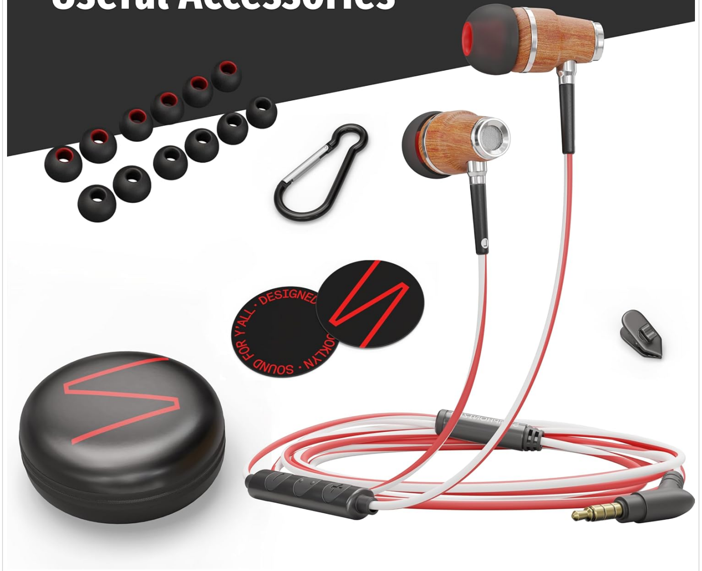
Image: The Symphonized headphones displayed with their included accessories, such as the carrying pouch and different ear tip sizes, emphasizing proper storage and care.