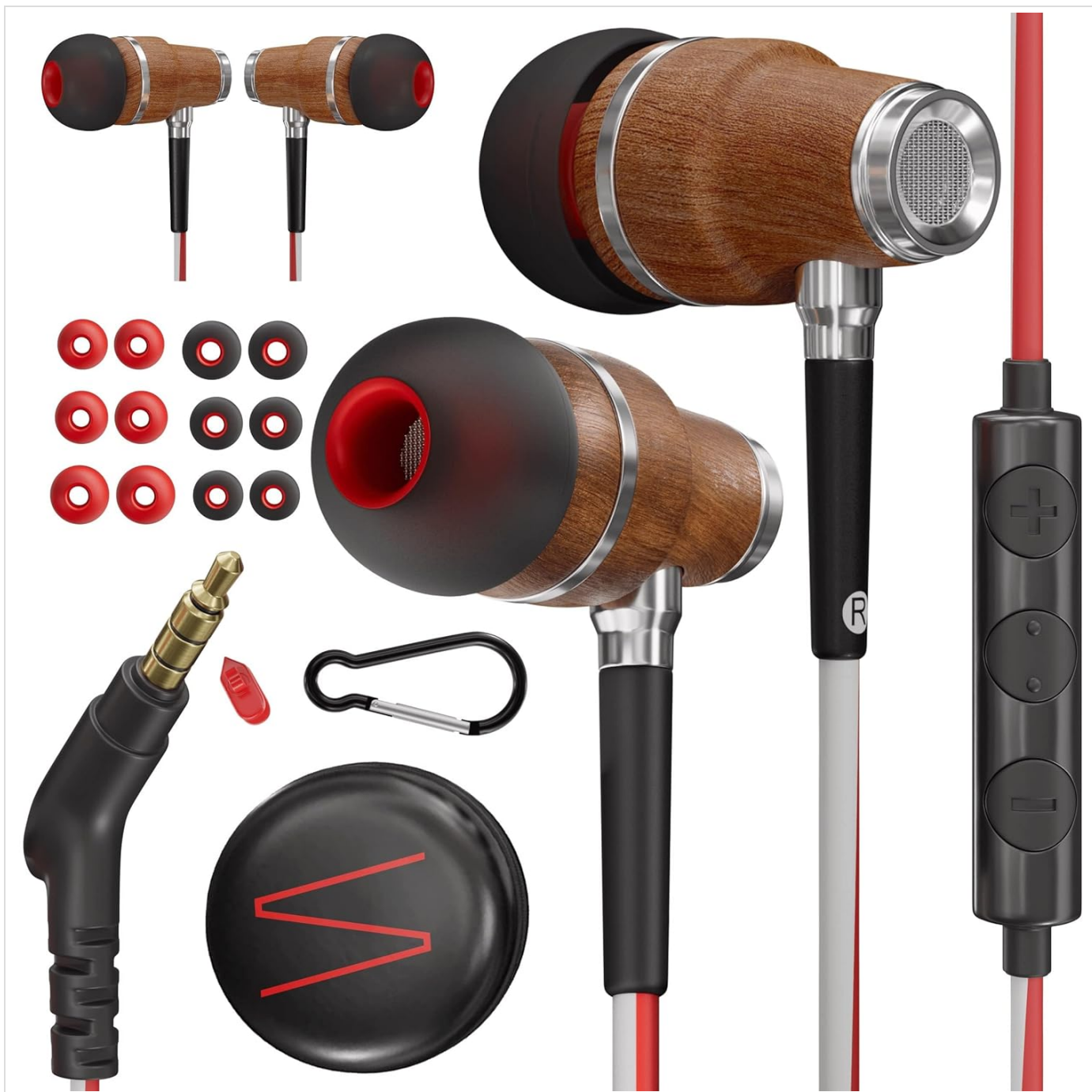
Image: Overview of the Symphonized NRG 3.0 headphones and included accessories.