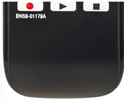
Image 2: Front view of the remote control, displaying all buttons.