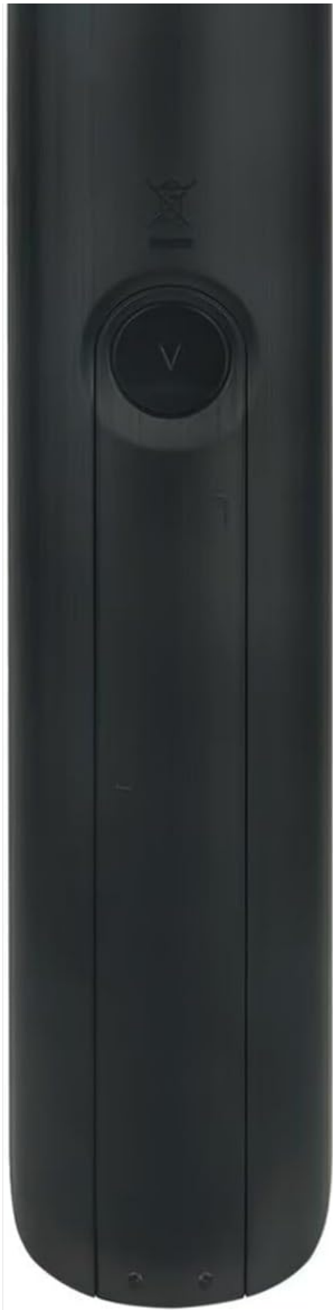
Image 1: Back view of the remote control, highlighting the battery compartment.