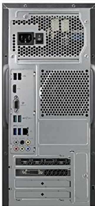
Figure 2: Rear panel of the ASUS G11CB-US014T Desktop, showing various connectivity ports.