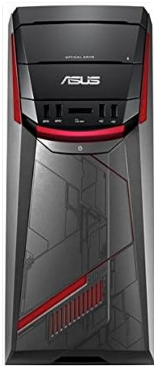
Figure 3: Front panel of the ASUS G11CB-US014T Desktop, highlighting the power button and optical drive bay.