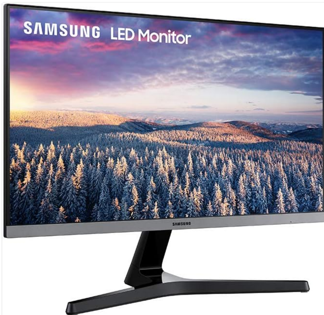
Figure 1.1: Front view of the Samsung S22F350FH monitor.