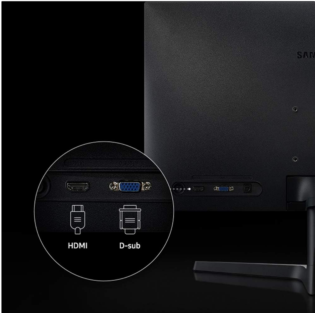
Figure 4.2: Monitor rear ports (HDMI and D-sub).