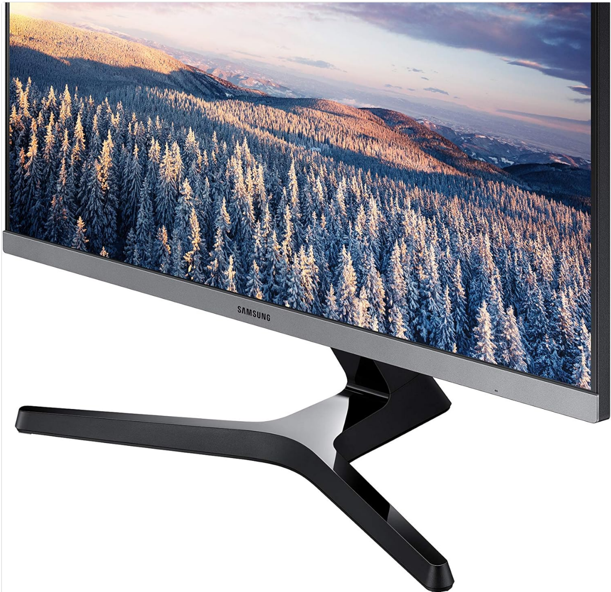
Figure 4.1: Monitor stand assembly detail.