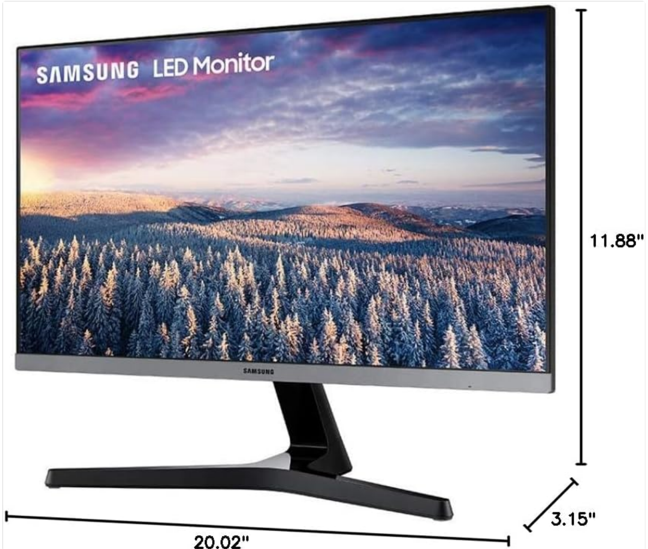
Figure 8.1: Monitor dimensions.

Eye Saver Mode, Flicker Free, Eco-Saving Plus, AMD FreeSync