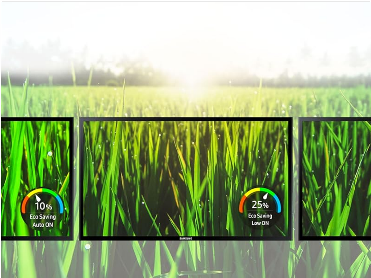
Figure 5.2: Eco-Saving Plus feature for power efficiency.