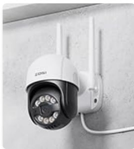
Figure 3.1: Simplified setup steps for the ZOSI system, illustrating NVR connection, camera power, and mobile app integration.