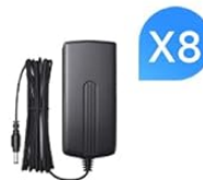
Camera Power Adapter