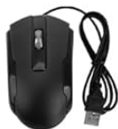
USB 2.0 Mouse