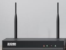
Figure 4.5: Centralized monitoring and management of up to 8 cameras with local storage on the NVR for 24/7 recording.