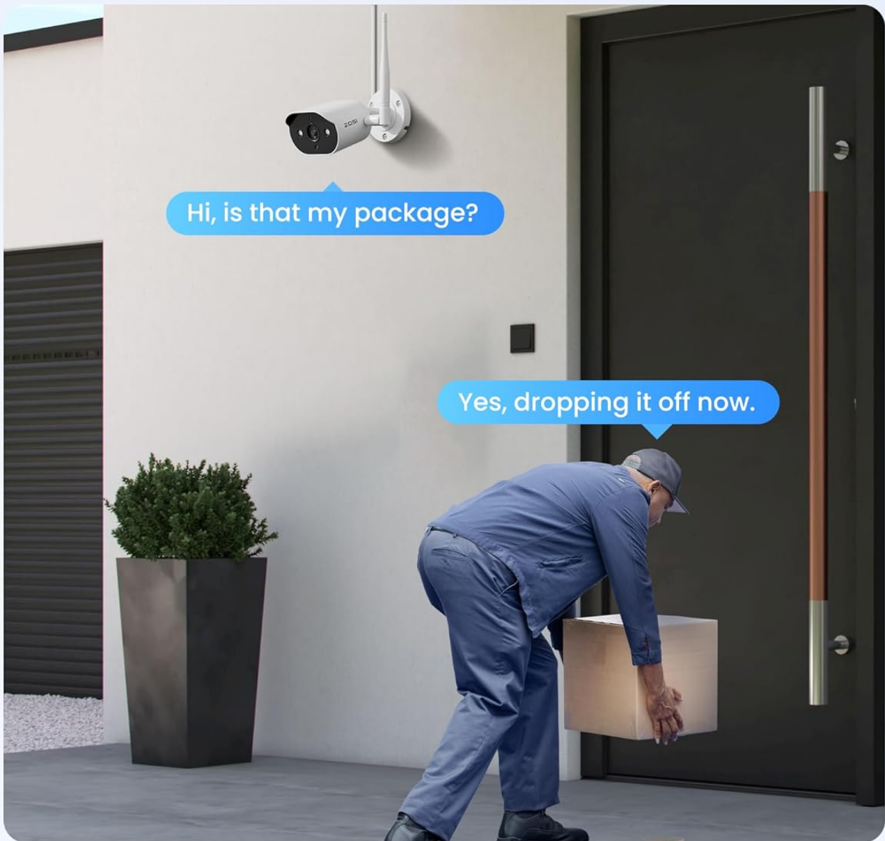
Figure 4.4: Two-way audio enables clear communication through the camera, allowing interaction with visitors or deterrence of unwanted individuals.