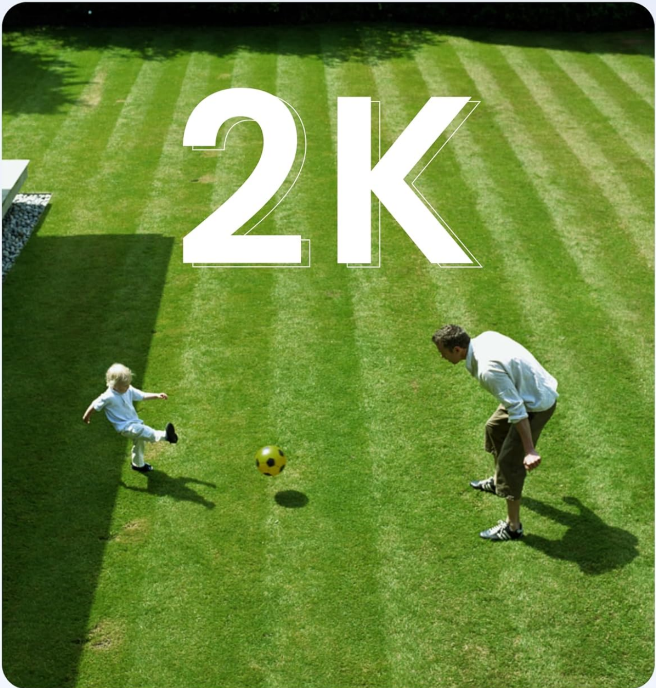
Figure 4.1: Example of 2K video clarity, capturing fine details in the surveillance area.