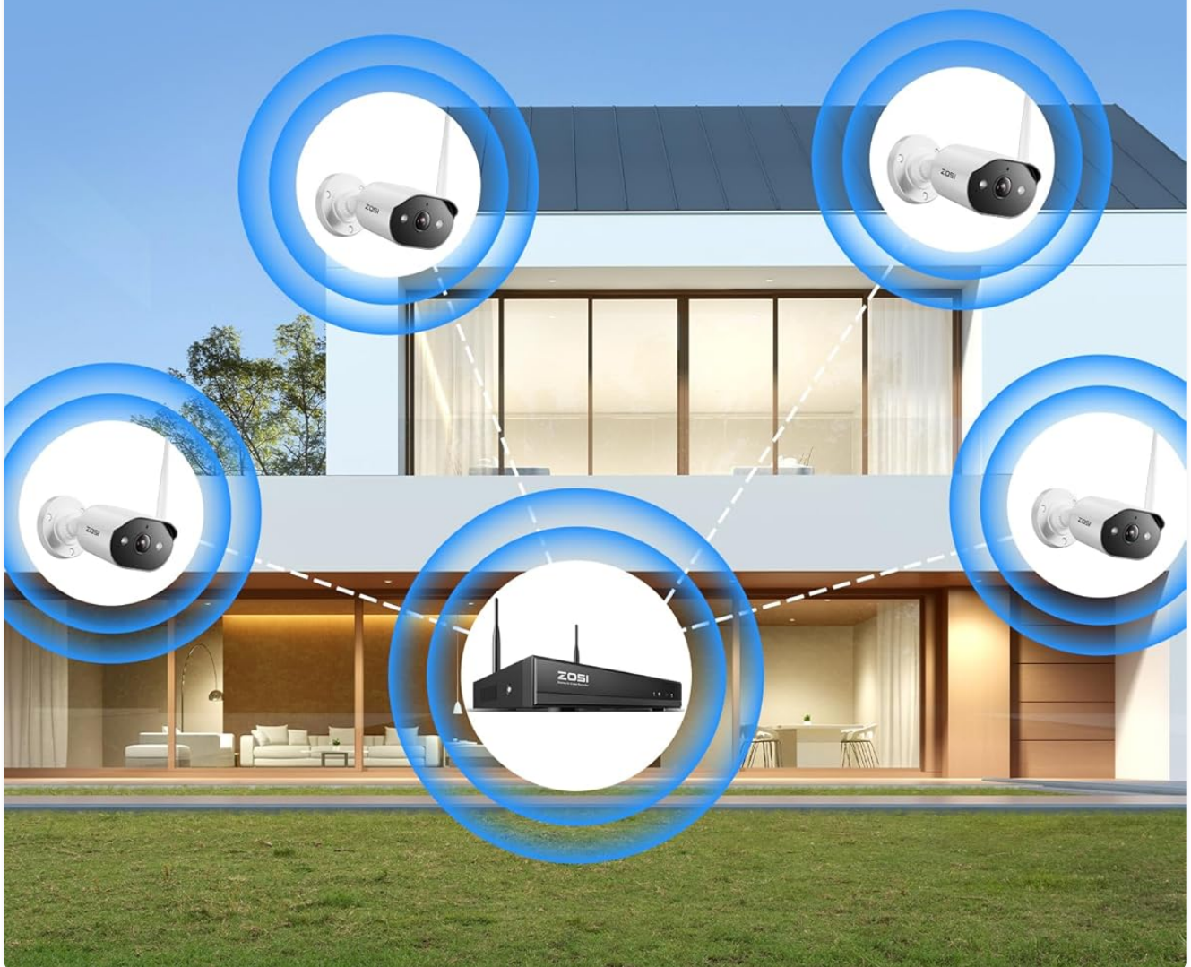
Figure 3.2: Wi-Fi 6 provides enhanced range, speed, and stability for camera connections to the NVR, supporting 2.4GHz Wi-Fi.