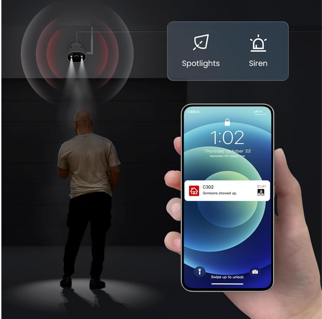
Figure 4.3: Smart human detection activates spotlights and siren, sending instant alerts to your mobile device.