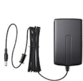
NVR Power Supply