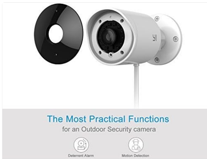
Image: The YI Outdoor Security Camera shown alongside icons representing its key functions: Deterrent Alarm and Motion Detection.