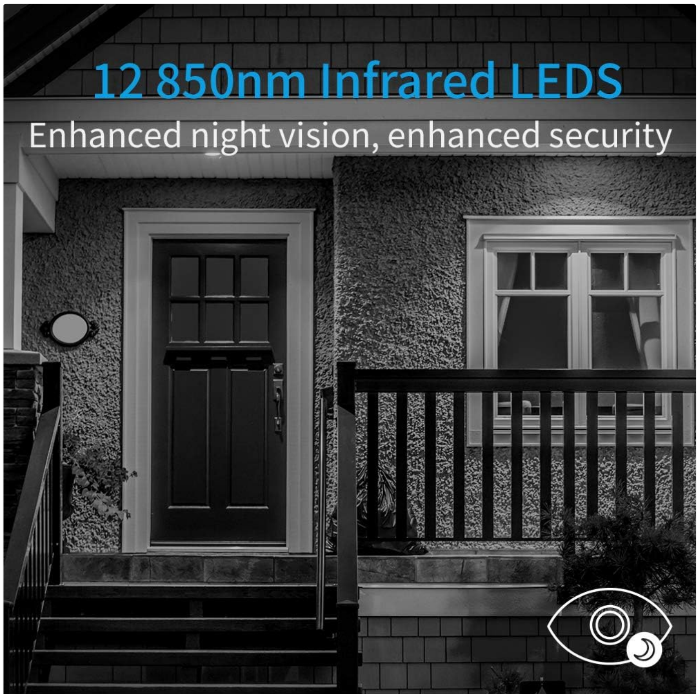
Image: A house exterior at night, demonstrating the enhanced night vision capabilities provided by the camera's 12 850nm infrared LEDs.