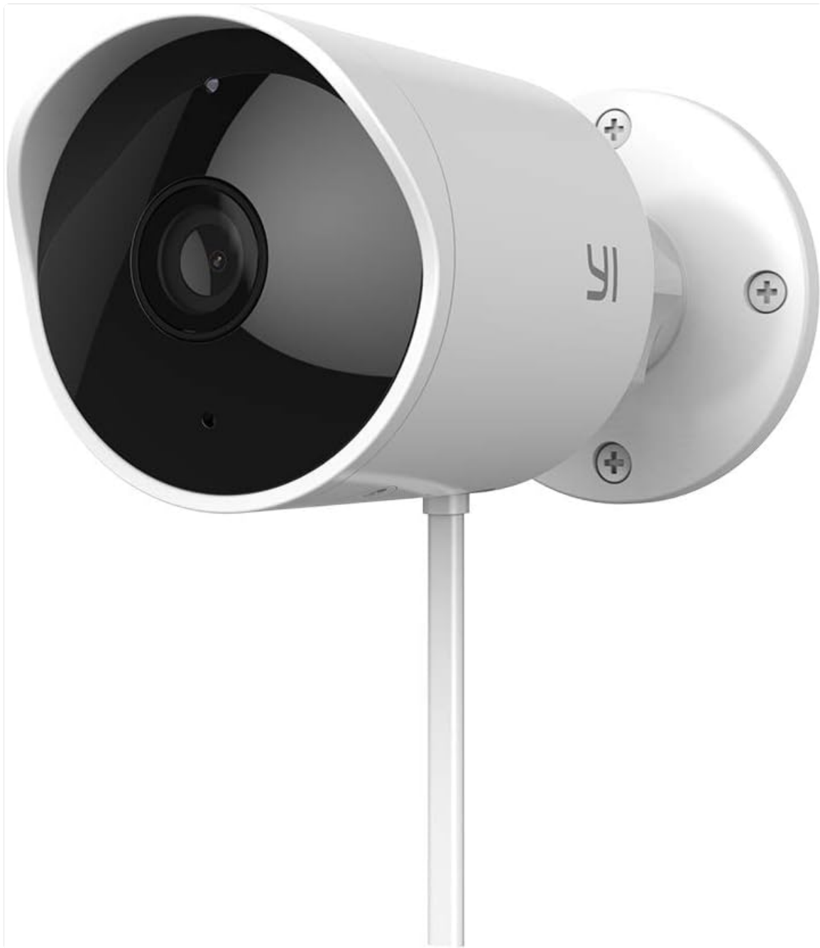
Image: The YI Outdoor Security Camera, a white cylindrical camera with a black lens, mounted on a wall bracket.