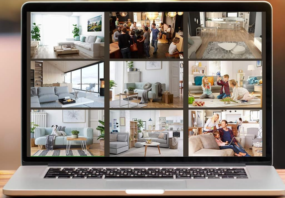
Image: A laptop displaying the YI Home Desktop App interface, showing live feeds from up to nine cameras simultaneously.

Connect and view up to 9 cameras simultaneously