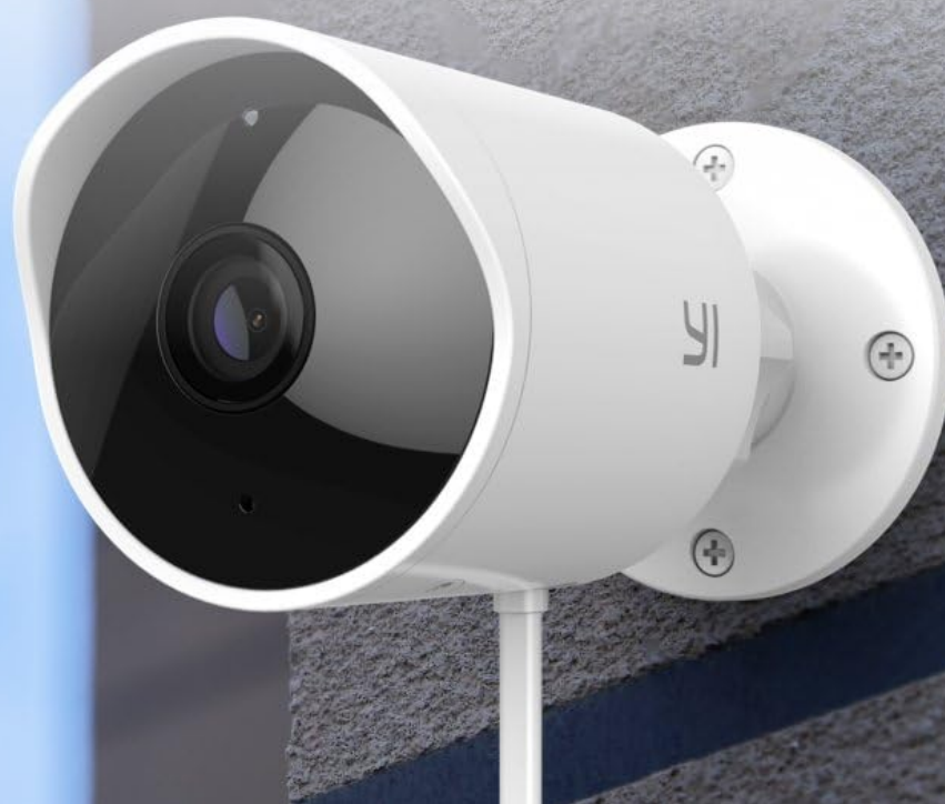
Image: The YI Outdoor Security Camera with icons highlighting its features: 1080P HD, 110° View, Weatherproof, Two-way Audio, and Nightvision.