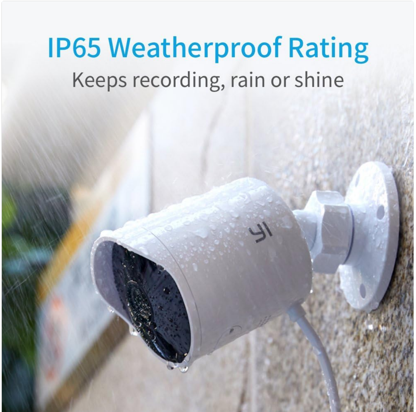
Image: The YI Outdoor Security Camera mounted on an exterior wall, with water droplets on its surface, illustrating its IP65 weatherproof rating.

The YI Outdoor Security Camera is designed for wall mounting. Choose a location that provides the desired viewing angle and has access to a power source. The camera is weather-resistant (IP65 rated) for outdoor use.