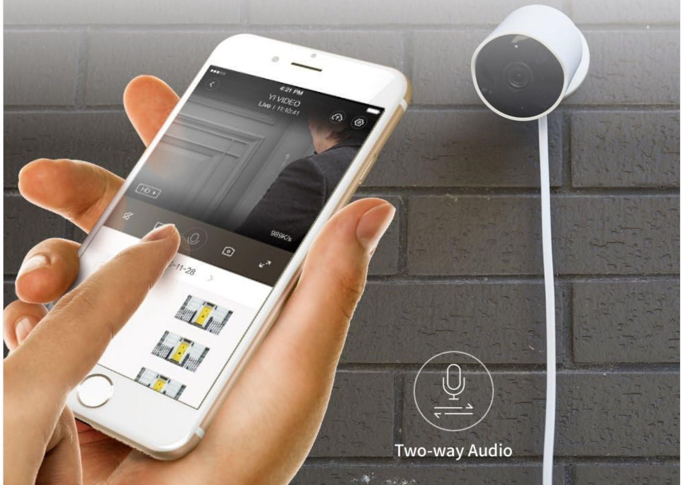
Image: A hand holding a smartphone showing the YI camera app's live view, with a microphone icon indicating the two-way audio feature.