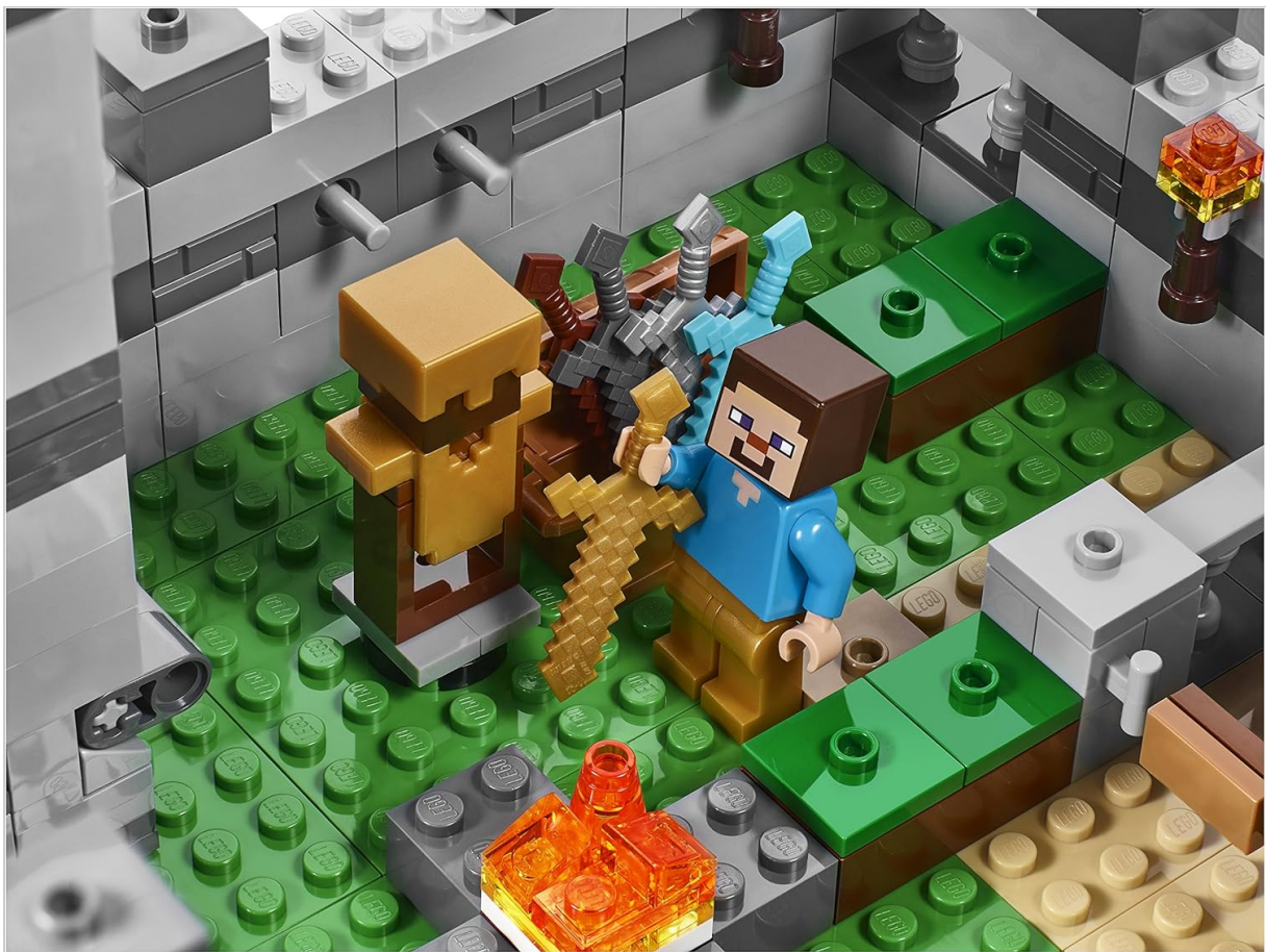
Figure 3.1: Steve minifigure and accessories included in the set.