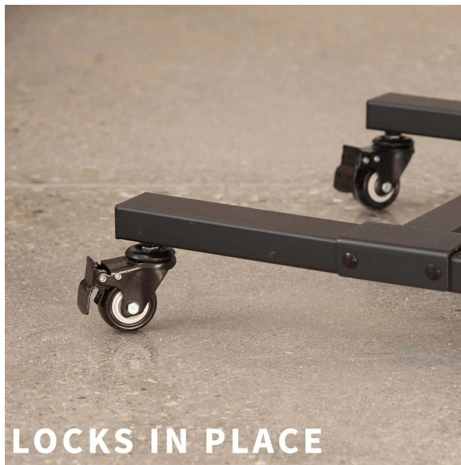
Image 4: Detail of the lockable wheel casters for securing the stand.

The 20-inch by 18-inch base is equipped with four wheels for easy mobility. Two of the front wheels are lockable. To secure the stand in place, press down on the locking levers of the front wheels.