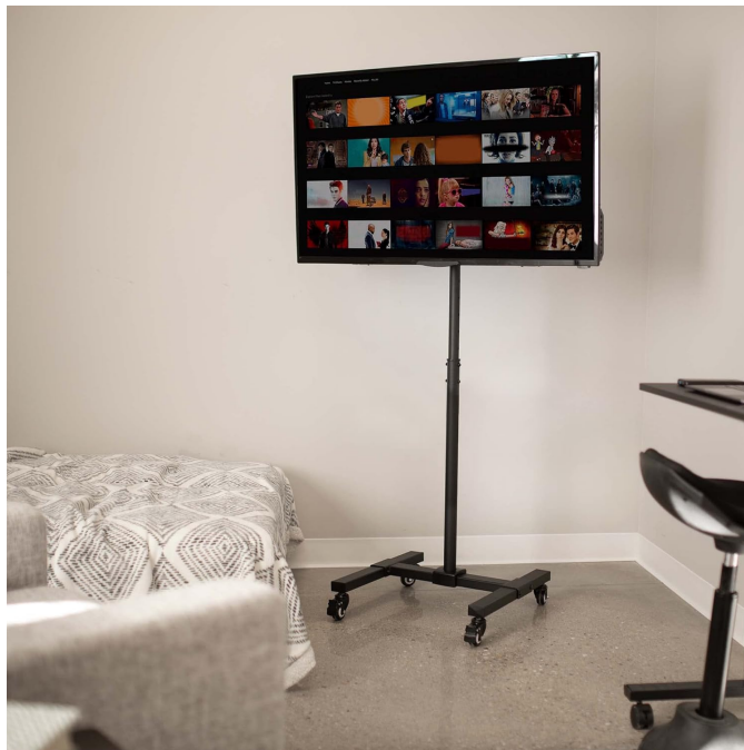
Image 2: The mobile TV stand positioned in a room, demonstrating its portability.