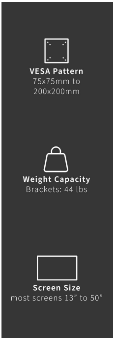
Image 5: Detailed measurements and VESA compatibility information for the stand.