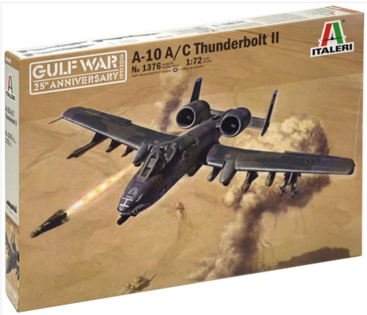
Figure 2.1: The product box for the Italeri 1:72 A-10 Thunderbolt II Gulf War model kit, showing the aircraft in flight with a desert background.