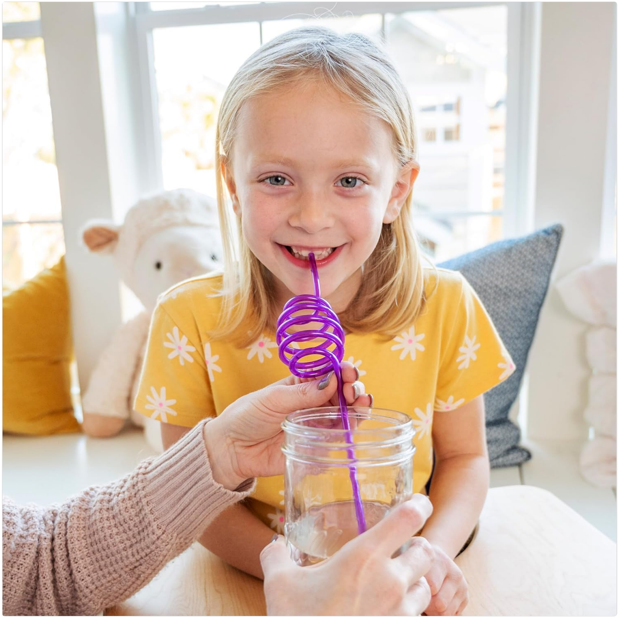
Image: A girl smiling while using a purple spiral TalkTools straw in a clear glass, held by an adult.