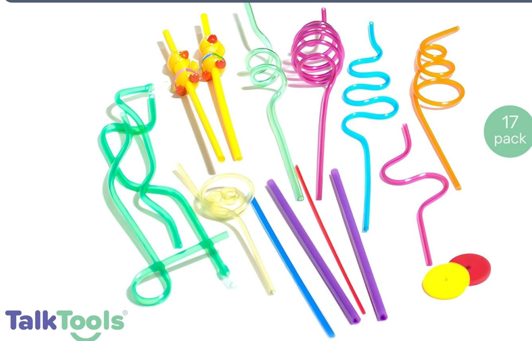
Image: The TalkTools Drinking Therapy Straw Kit, featuring 17 assorted straws of various shapes and sizes, designed to improve speech clarity and feeding abilities. The kit is developed and tested by speech-language pathologists and occupational therapists.