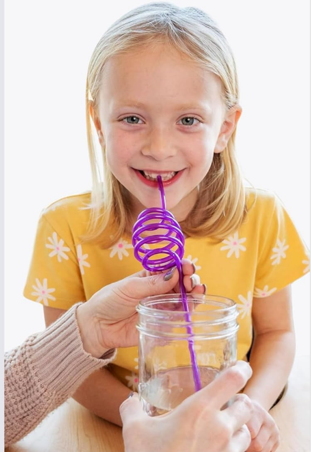
Image: A child using a TalkTools straw, demonstrating its application as an oral therapy tool for both kids and adults, emphasizing its safe and BPA-free composition.