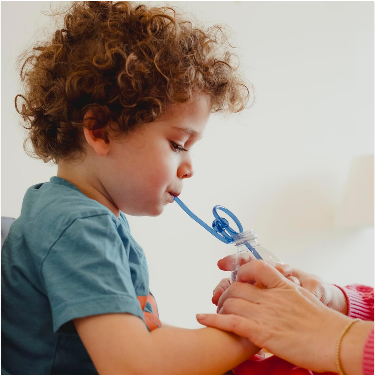
Image: A child demonstrating the use of a blue looped TalkTools straw, held by an adult, for drinking.