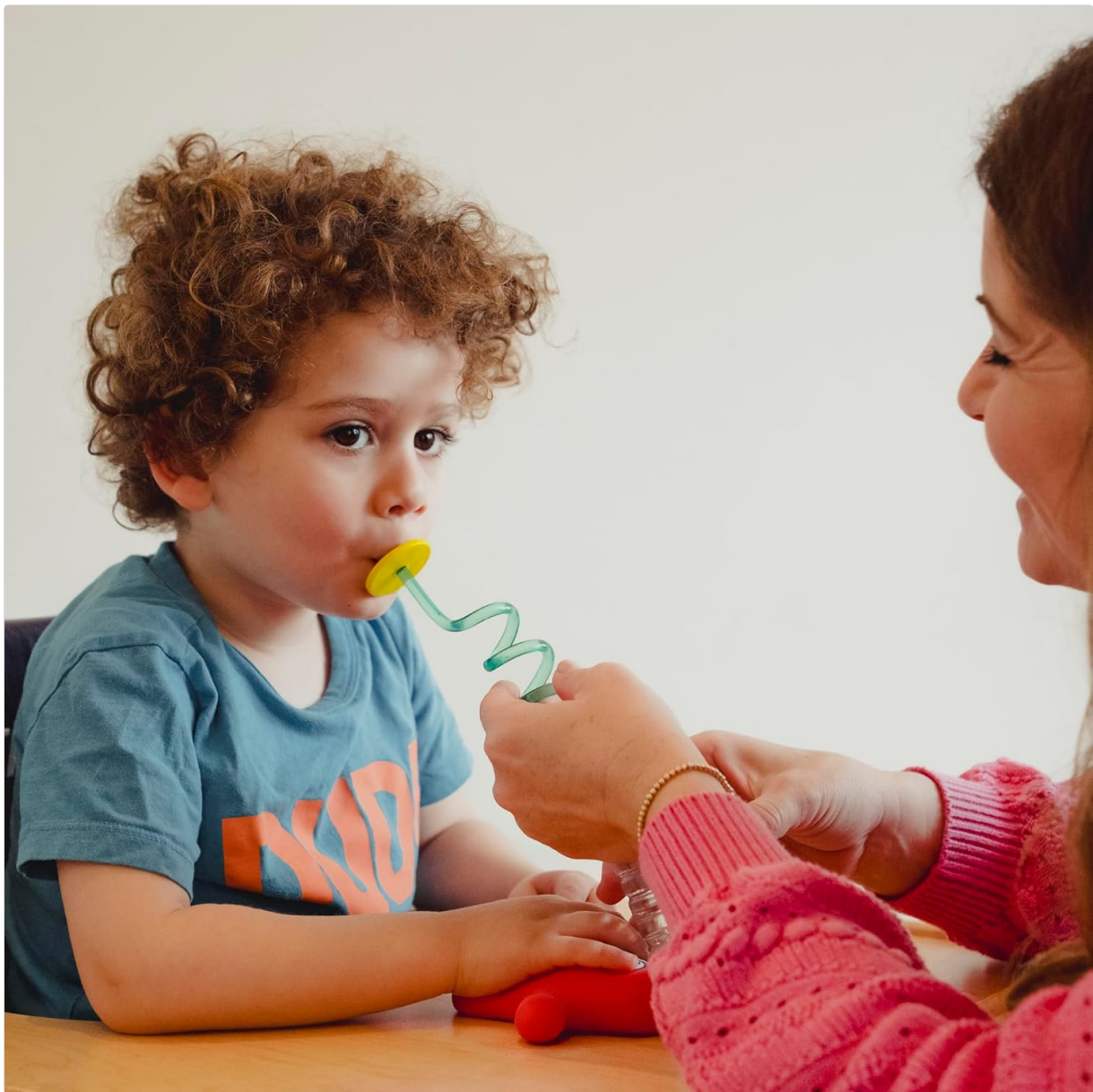
Image: A child using a green spiral TalkTools straw, held by an adult, for drinking.