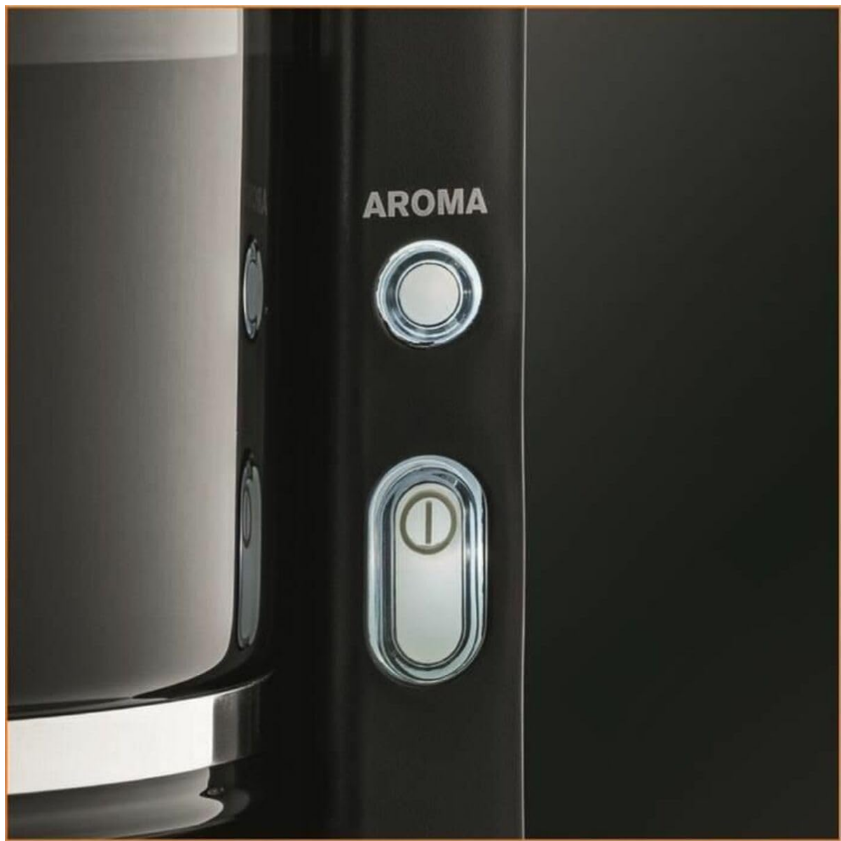
Figure 4: Close-up of the control panel, highlighting the "AROMA" button for strength selection and the main power button.