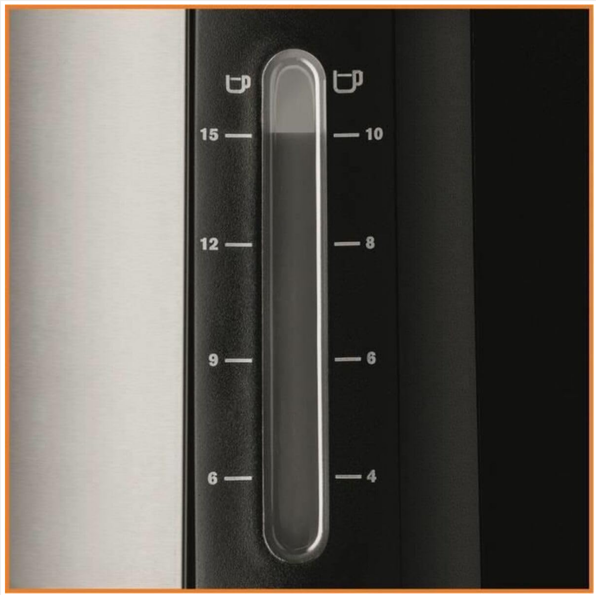
Figure 3: Close-up of the clear water level indicator, showing markings for 6, 9, 12, and 15 cups, and 4, 8, 10 cups on the other side.