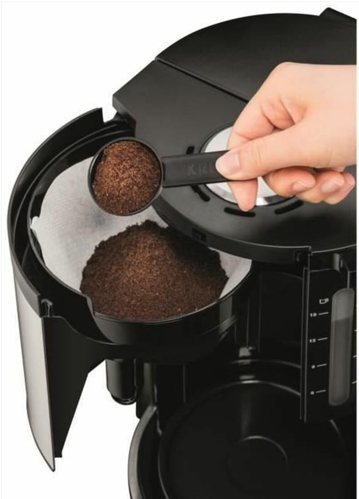
Figure 2: A hand adding ground coffee into the filter basket, demonstrating the easy-access filter holder.