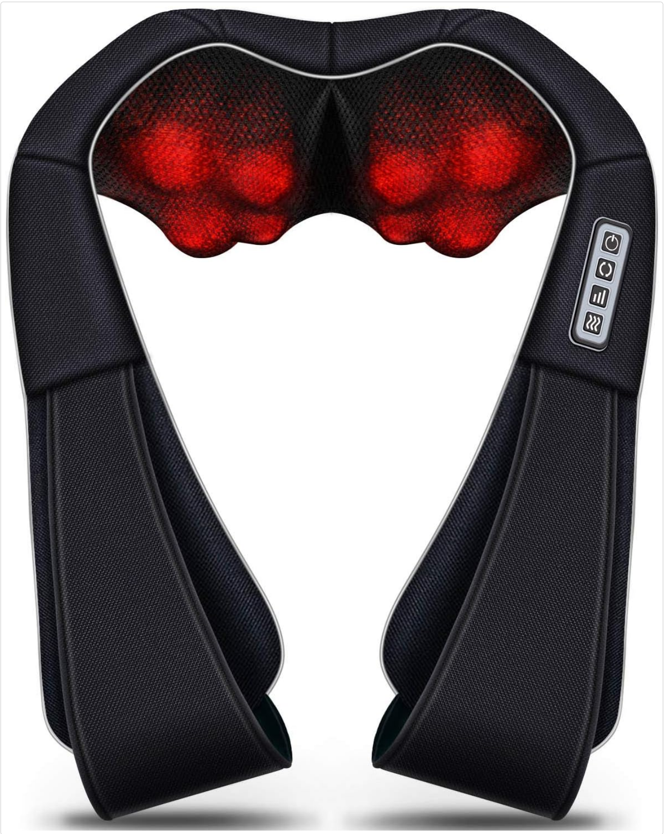
The VIKTOR JURGEN Shiatsu Neck and Shoulder Massager, showcasing its ergonomic design and control panel.