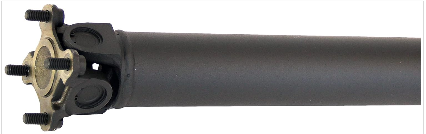
Figure 4.1: Driveshaft Flange Detail

This image provides a detailed view of one end of the driveshaft, showing the flange and bolt holes, which connect to the vehicle's differential or transmission.