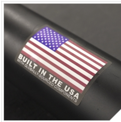
Figure 9.1: Built in the USA

For specific warranty information, technical support, or to explore Dorman's full range of products, please visit the official Dorman website or contact their customer service directly. You can also visit the Dorman Store on Amazon .