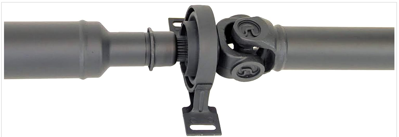
Figure 4.2: Center Support Bearing and U-Joint

This image provides a detailed view of one end of the driveshaft, showing the flange and bolt holes, which connect to the vehicle's differential or transmission.