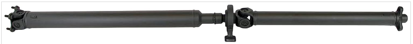
Figure 1.1: Dorman 936-342 Rear Driveshaft Assembly

The Dorman 936-342 Rear Driveshaft Assembly is an OE FIX replacement part designed for specific BMW models. This assembly addresses a common issue with original driveshafts that have permanently staked universal joints, making servicing difficult. The Dorman OE FIX design incorporates serviceable U-joints, simplifying future maintenance. This driveshaft is manufactured new, ensuring no core charge or return hassle, and is shipped pre-assembled and factory balanced for immediate smooth operation upon installation.