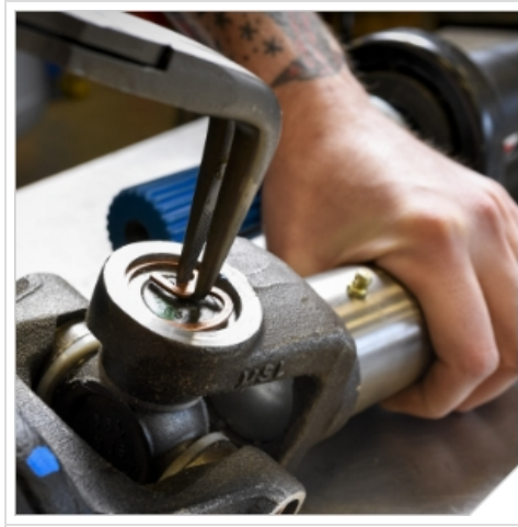
Figure 6.1: Servicing a Universal Joint

This image shows a hand using pliers to service a universal joint, demonstrating the accessibility for maintenance on the Dorman OE FIX driveshaft.