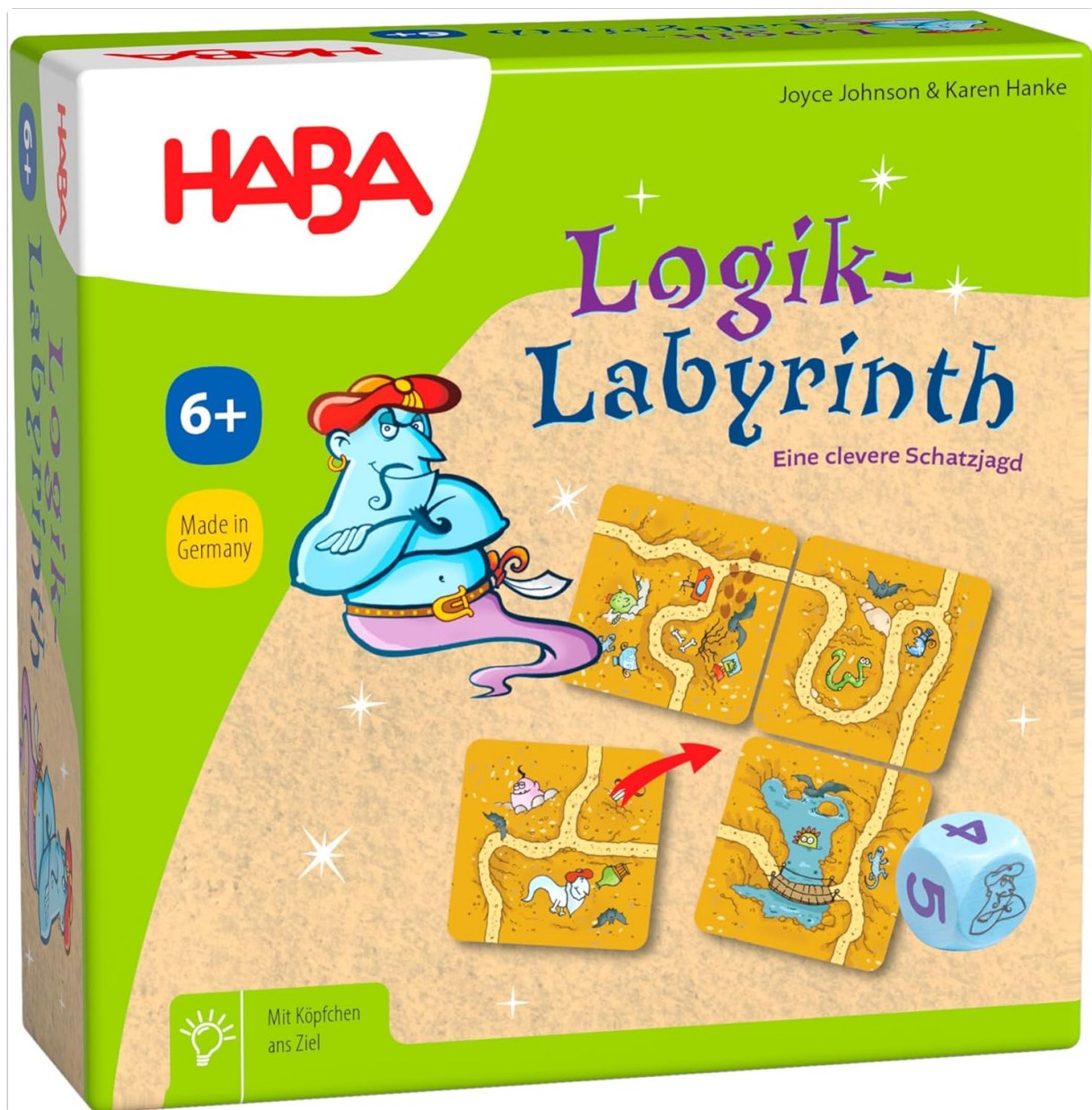
Figure 1: Front view of the HABA 301886 Logic Labyrinth game box.