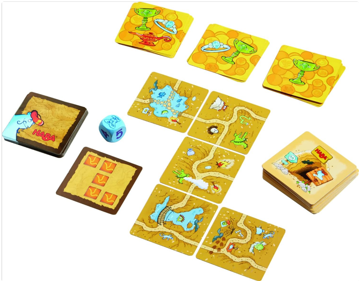
Figure 2: Detailed view of the game components, including various cards and the die.