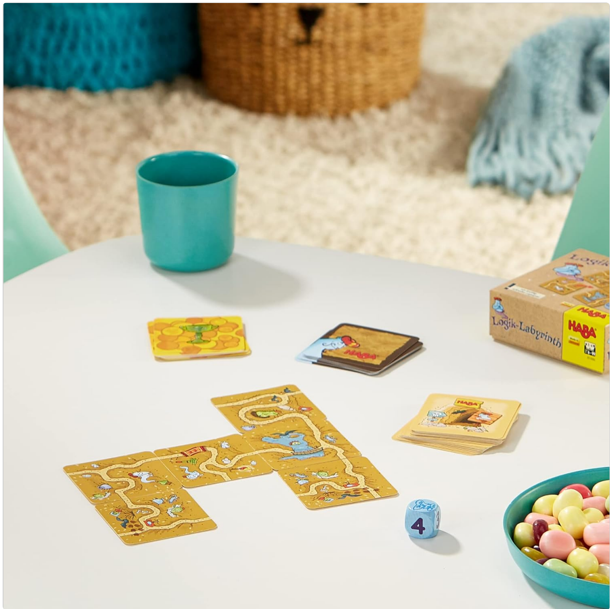
Figure 3: An example of the game setup with cards laid out and the die ready for play.